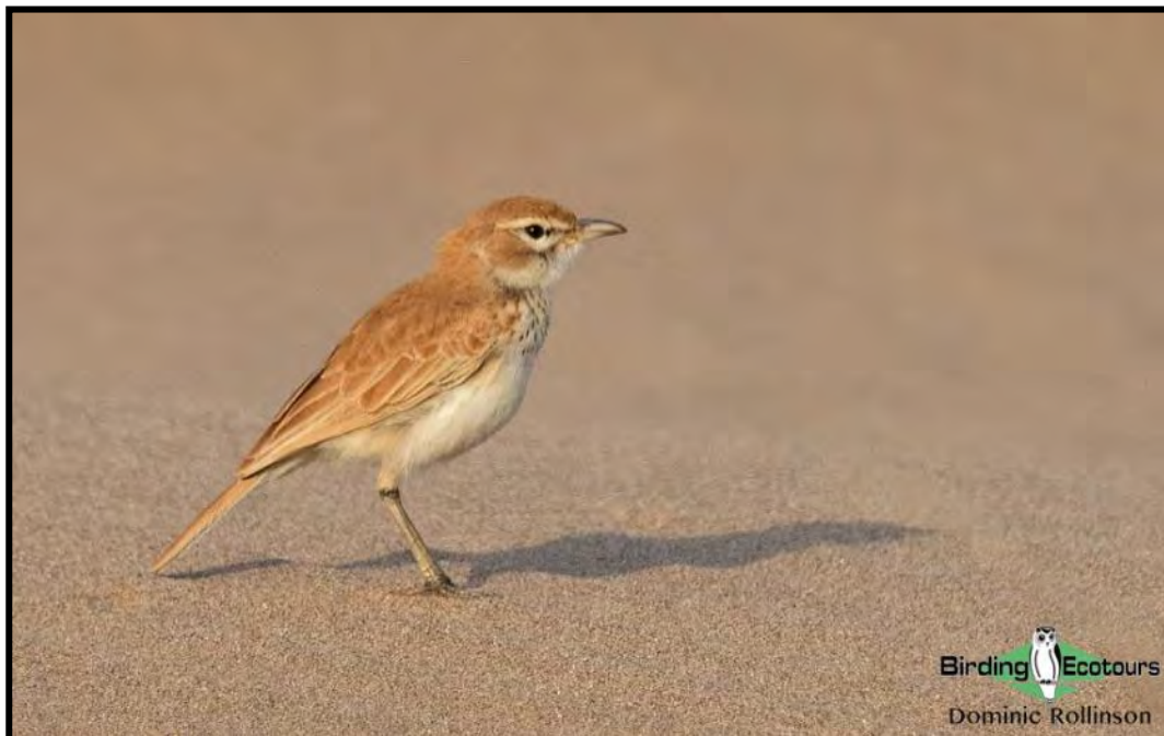
Dune Lark, Namibia's only endemic bird, should be seen around Walvis Bay.