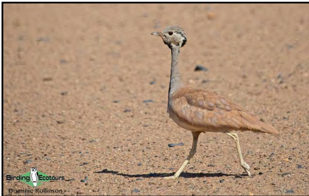
Another Namib Desert special we'll search for on this tour, Rüppell's Korhaan

Heading inland and northward we start encountering some spectacular mountains. The Spitzkoppe in particular is a huge inselberg that rises abruptly from the desert plain. The flat surrounding areas are good for Burchell's Courser , Rüppell's Korhaan , Ludwig's Bustard , a number of localized lark species such as Karoo Long-billed Lark (replaced by Benguela Long-billed Lark slightly farther north), etc. The mountains themselves are where we search for the enigmatic, bizarre Herero Chat , noisy little flocks of Rosy-faced Lovebirds , a couple of hornbill species basically restricted to the Namib and adjacent arid habitats, Bradfield's Swift , and many others.