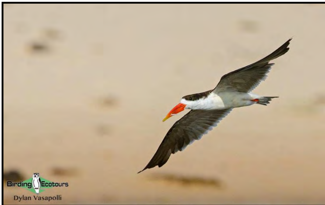
African Skimmer is regular around the Okavango Panhandle.

Overnight: Mahangu Safari Lodge or Ndhovu Safari Lodge , Divundu