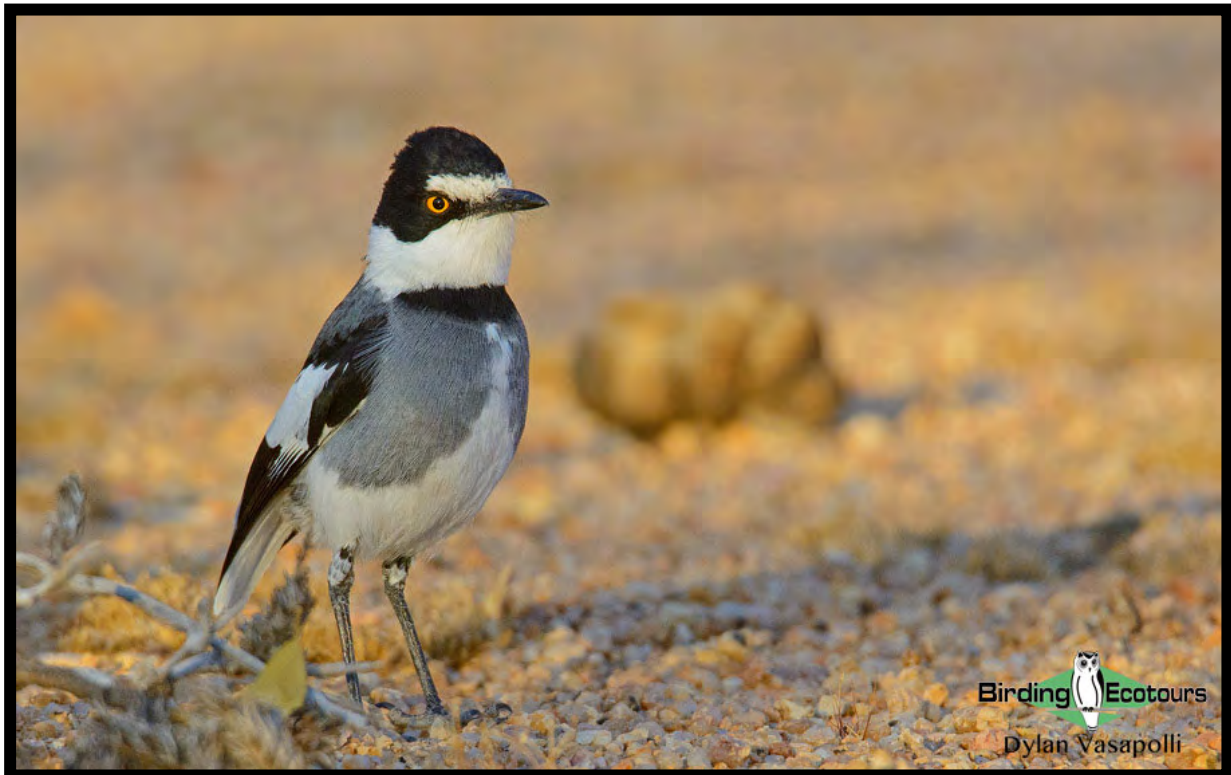
The cute White-tailed Shrike is a sought-after Namibian near-endemic.