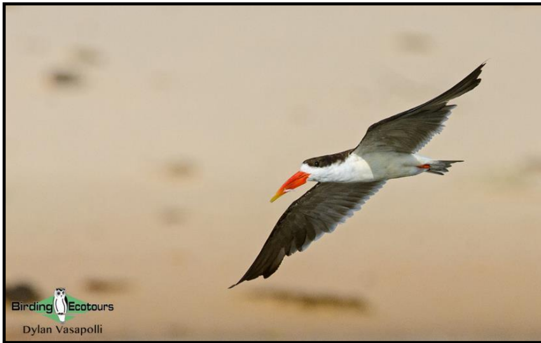
African Skimmer is regular around the Okavango Panhandle.

Overnight: Mahangu Safari Lodge or Ndhovu Safari Lodge , Divundu