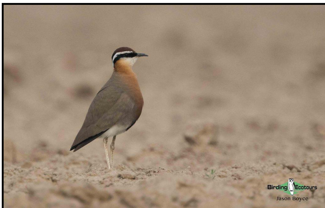
Indian Courser can be seen in Bardia National Park.