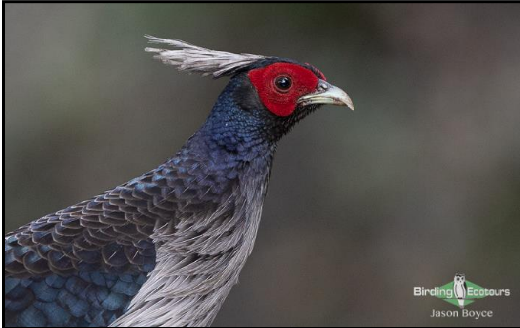
The gorgeous Kalij Pheasant can be found in Nepal.