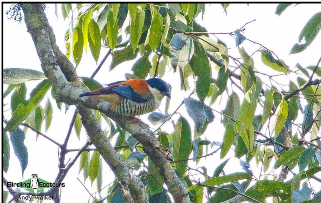
The spectacular Himalayan Cutia is always a prized sighting.

We will have two days birding within and around the Kathmandu Valley as we acclimatize to the area from our base in Kathmandu. We will spend time birding around Shivapuri Nagarjun National Park, Phulchowki, the highest of the hills surrounding the Kathmandu area at 2,800 meters (9,185 feet), and the nearby Godavari Botanical Garden. All are beautiful spots with luscious gardens and forests. The Shivapuri Nagarjun and Phulchowki areas provide us with an opportunity to see a wide diversity of central Himalayan mountain specialties and some fantastic and classic Himalayan views. The highly enigmatic and colorful Himalayan Cutia is one of our main targets over these two days, but with luck we may also find Golden-naped Finch , Tibetan Serin , Maroon-backed Accentor , or the rare and local endemic Spiny Babbler .