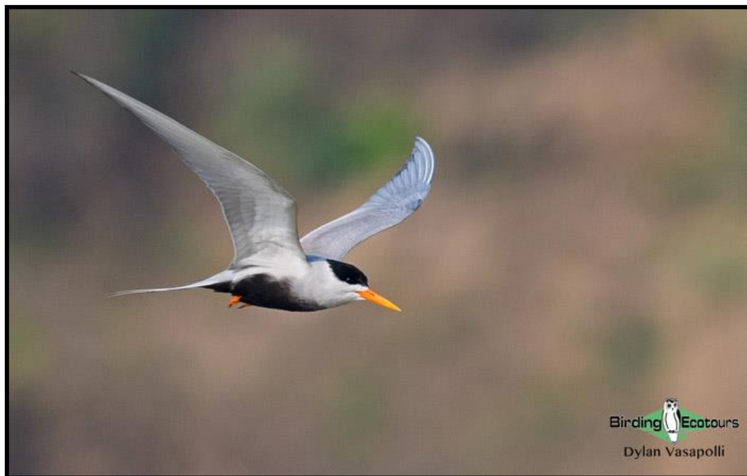
Black-bellied Tern is rather attractive.

The exciting wetlands, grasslands, and scrublands around Koshi Tappu are home to an impressive array of species. The reeds of the wetland habitats hold species such as Cinnamon Bittern , Black Bittern , Ruddy-breasted Crake , and Greater Painted-snipe . The threatened Swamp Francolin may be seen scuttling through the tall grasslands, and here we will also look for White-tailed Stonechat , Striated Grassbird , Citrine Wagtail , and Rosy Pipit , among many others, which include the blood-red Red Avadavat , the spectacular Siberian Rubythroat , and the cryptic Rufous-vented Grass Babbler (formerly called Rufous-vented Prinia until a recent taxonomic update). Koshi Tappu is the only location in the world where the Nepalese-endemic subspecies of the grass babbler is known to occur, so this is a big target and another potential split – the other subspecies in the complex occurs several thousand kilometers away in the Indus plains of Pakistan. Impressive numbers of waterfowl on the nearby Kosi Barrage may include the striking Falcated Duck as well as Ferruginous Duck among the commoner and more widespread species. Both Black-bellied Tern and River Tern also occur here.