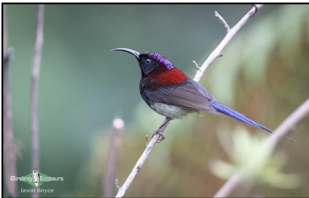
The beautiful Black-throated Sunbird is fairly common on this tour.

Other species that we will search for include the aptly named Hoary-throated Barwing , the kaleidoscopic Bar-throated Minla , and the dazzling Scarlet Minivet . Laughingthrushes abound, and we will hope to see Striated Laughingthrush , Streaked Laughingthrush , Grey-sided Laughingthrush , Rufous-chinned Laughingthrush , Chestnut-crowned Laughingthrush , and White-throated Laughingthrush . Other central-Himalayan specialties include Darjeeling Woodpecker , Rufous-breasted Accentor , Rufous-vented Yuhina , Stripe-throated Yuhina , Whiskered Yuhina , White-tailed Nuthatch , Nepal Fulvetta , White-browed Fulvetta , Rufous-winged Fulvetta , and a host of warblers, which includes the colorful Chestnut-crowned Warbler , Black-faced Warbler , and Ashy-throated Warbler . Barbets are numerous here and include Great Barbet and Golden-throated Barbet . With some luck and patience we may get good views of the remarkable Chestnut-headed Tesia or the skulking Himalayan Shortwing (formerly called White-browed Shortwing prior to that complex getting split), while flowering trees may attract the stunning trio of Fire-tailed Sunbird , Green-tailed Sunbird , and Black-throated Sunbird . We will also keep our eyes firmly peeled on any shady watercourses for the stunning Spotted Forktail and Blue Whistling Thrush .