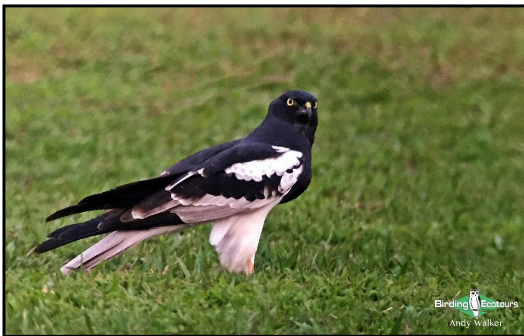
Pied Harrier — surely one of the prettiest raptors in the world