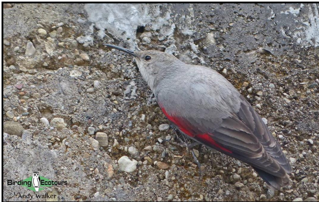
Wallcreeper is one of our spectacular monotypic targets on this trip.

Our itinerary is designed to maximize your exposure to the different habitats and incredible birds Nepal has to offer without trekking on foot for days into the higher Himalayas (though we can arrange trekking after your tour as an extension should you wish to explore some areas on foot). We will target the sole Nepalese endemic, Spiny Babbler , as well as two monotypic families with the highly-sought duo of Ibisbill and Wallcreeper along with further exciting avian possibilities including Indian Courser , Swamp Francolin , Lesser Adjutant , Sarus Crane , Black-bellied Tern , White-tailed Stonechat , Himalayan Rubythroat , Indian Grassbird , Bristled Grassbird , Rufous-vented Grass Babbler , Nepal Fulvetta , Himalayan Cutia , and Tibetan Serin , along with a large list of other birds.