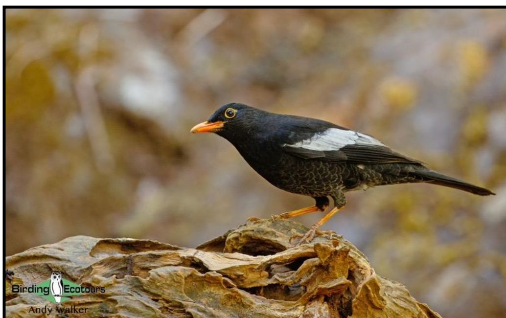
Another beautiful thrush that is possible in Nepal – Grey-winged Blackbird.

A huge number and wide range of species are possible at Bardia National Park. High-quality birds we could find during our time here including Sarus Crane, Swamp Francolin, Sirkeer Malkoha, Yellow-footed Green Pigeon, Lesser Adjutant, Black Stork, Painted Stork, Black-necked Stork, Red-naped Ibis, Oriental Darter, Indian Courser, Black-bellied Tern, Dusky Eagle-Owl, Red-headed Vulture, White-rumped Vulture, Slender-billed Vulture, Indian Spotted Eagle, Great Hornbill, Great Slaty Woodpecker, White-naped Woodpecker, Yellow-crowned Woodpecker, Maroon Oriole, Short-billed Minivet, Rosy Minivet, Small Minivet, Black-headed Jay, Bengal Bush Lark, Tawny-bellied Babbler, Striated Babbler, Chestnut-tailed Starling, Brahminy Starling, Grey-winged Blackbird, Tickell's Thrush, Slaty-backed Forktail, Blue-capped Rock Thrush, and White-tailed Stonechat.