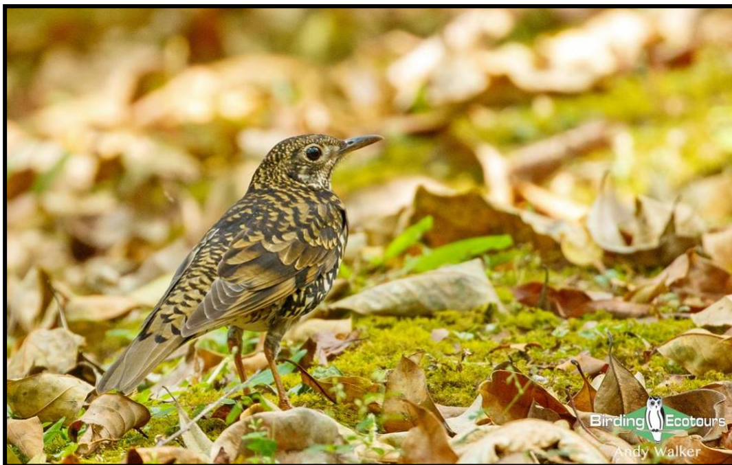
The cryptically plumaged Scaly Thrush hides very well in the leaf litter.