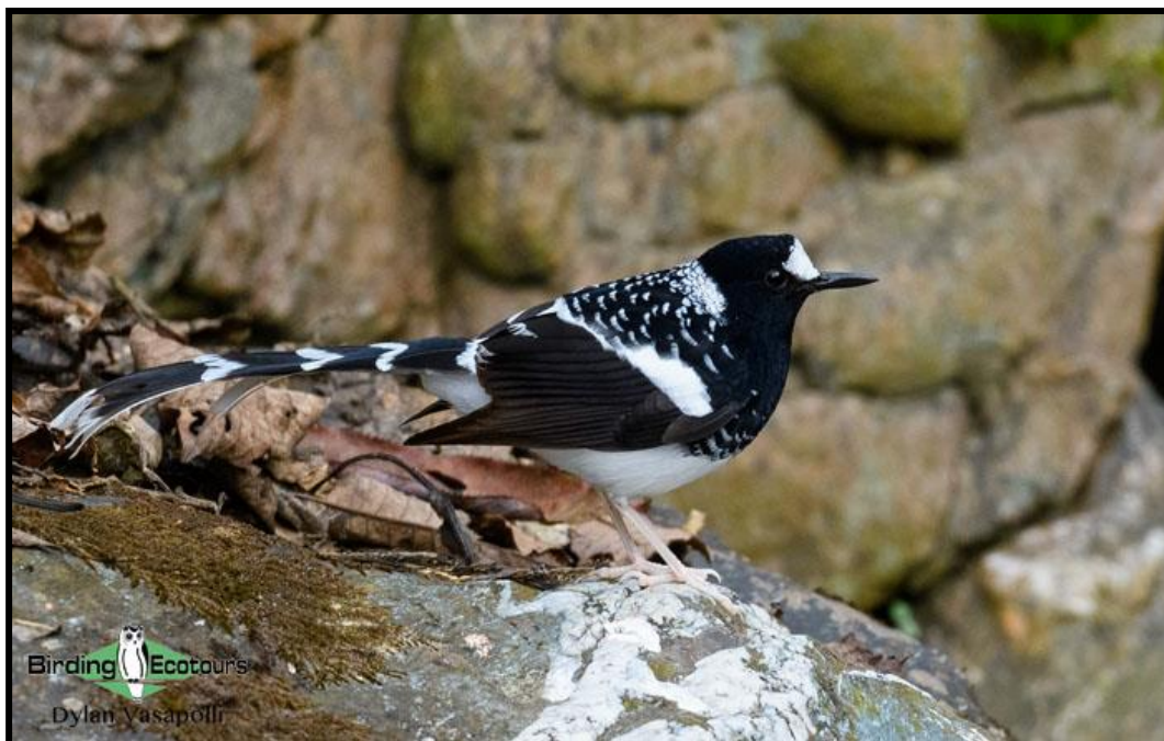
The spectacular Spotted Forktail can be found in the mountains.