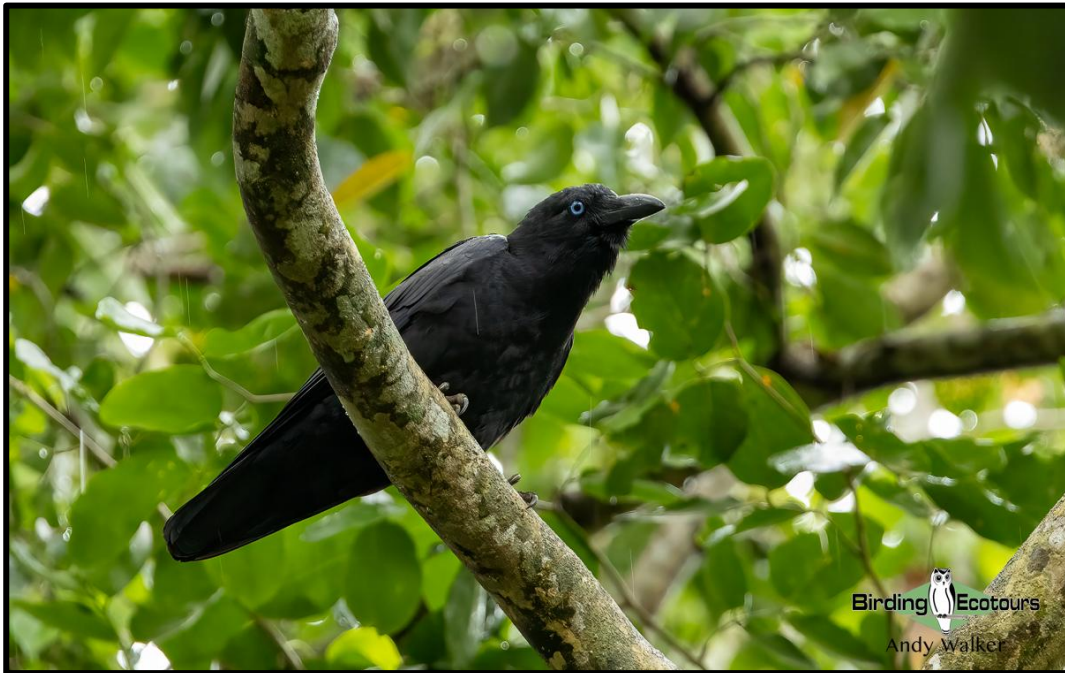
Bismark Crow can be found around our accommodation.