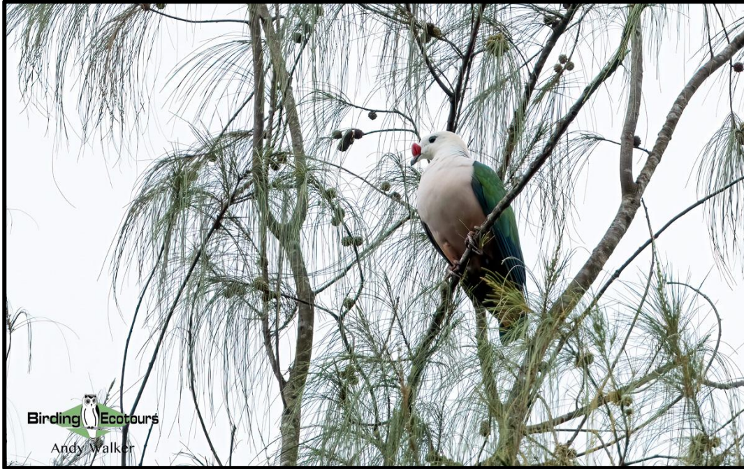
Red-knobbed Imperial Pigeon is a large and interesting looking bird.