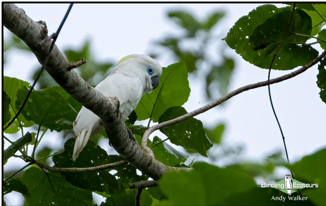
Blue-eyed Cockatoo is an attractive New Britain endemic.

On this short New Britain bird tour, we will find numerous New Britain endemics, along with plenty of Bismarck Archipelago endemics, and some Solomon Islands endemics too. Some of the many possible highlights include Melanesian Megapode , Golden Masked Owl , Blue-eyed Cockatoo , Black-capped Paradise Kingfisher , and Bismarck (New Britain) Pitta . We will also enjoy sightings of numerous parrots, pigeons, kingfishers, and exciting passerines that will provide an incredible splash of color.