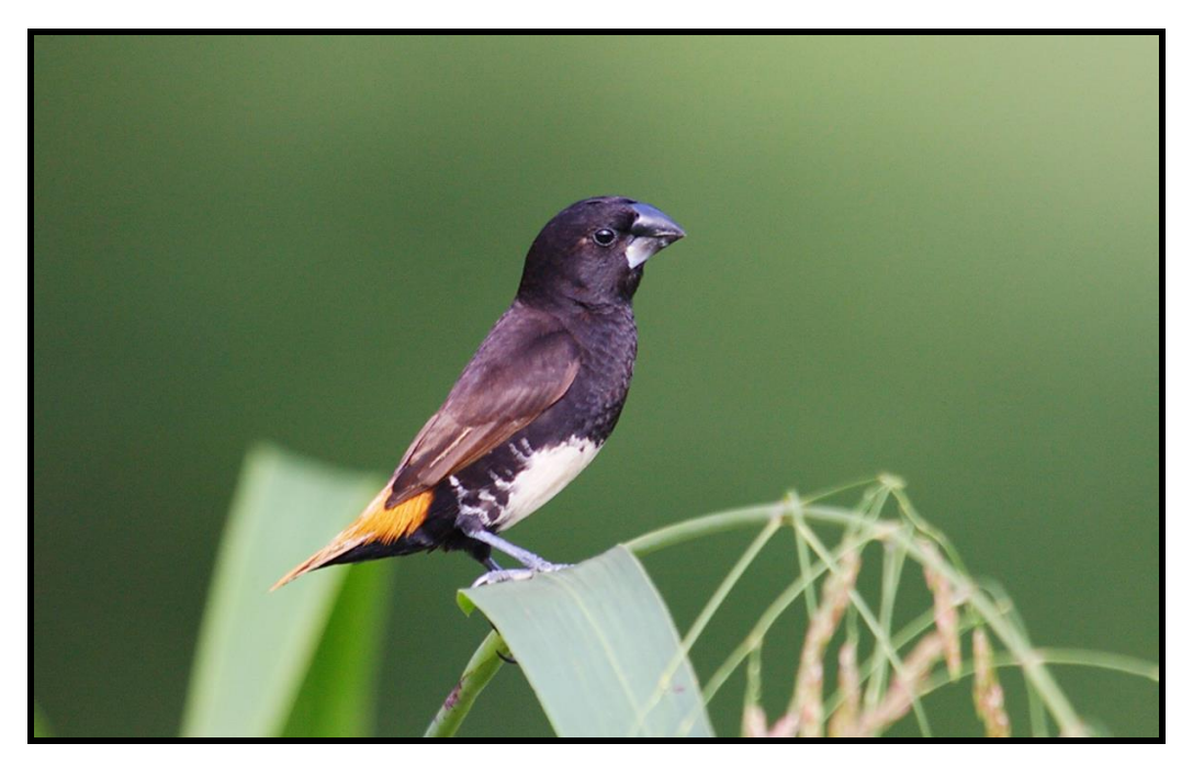
Buff-bellied Mannikin is found in the Bismarck Archipelago and Bougainville