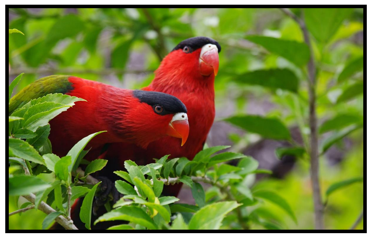
Purple-bellied Lory is one of the many species of colorful parrots to be found on this New Britain birding tour.