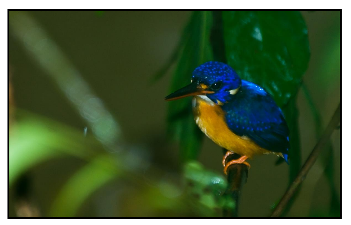
New Britain Dwarf Kingfisher is one of several regional endemic species we will look for on our New Britain birding tour.