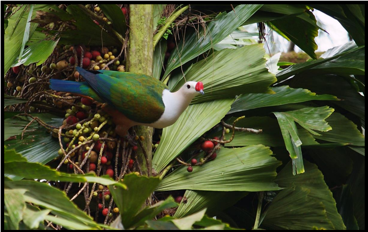
The striking Red-knobbed Imperial Pigeon will be a target while birding in New Britain.