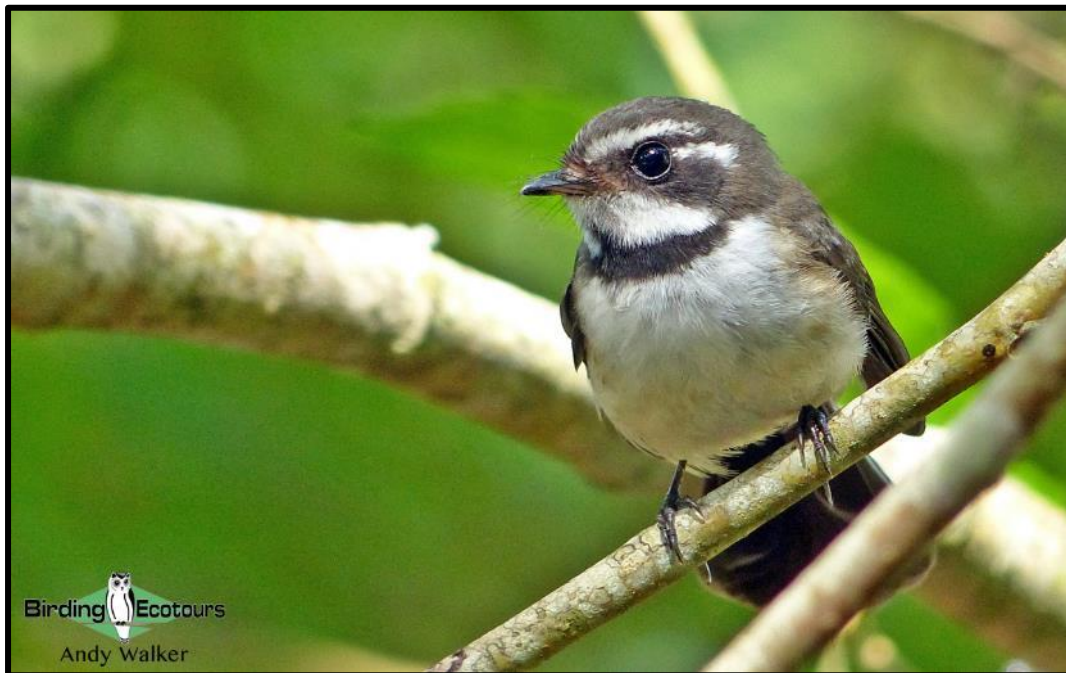
The often confiding, Kadavu Fantail can be in the resort garden.