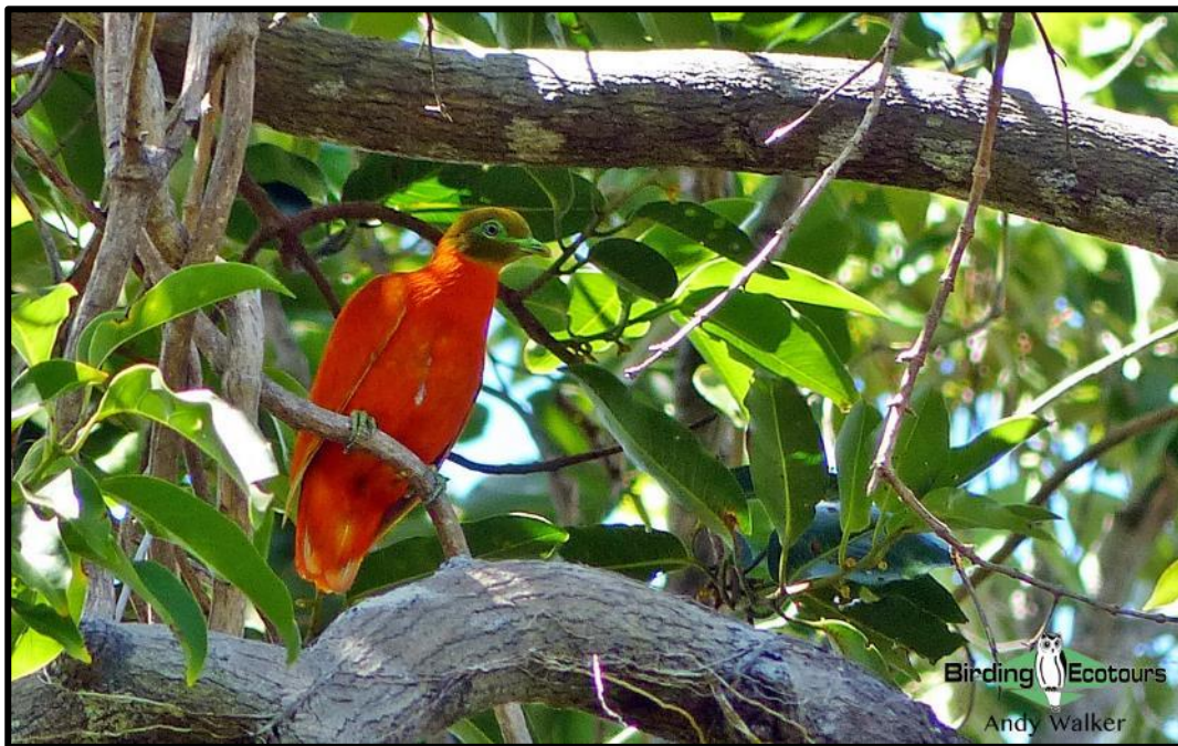
Orange Fruit Dove needs to be seen to be believed! What an incredible bird.

This is sure to be an epic birdwatching trip through some exciting Pacific islands and we look forward to showing you a range of unique and thrilling birds.