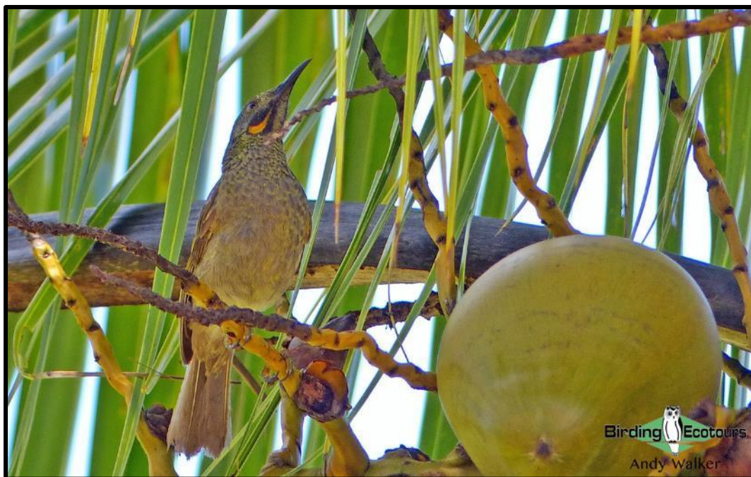
Kikau is a honeyeater with a limited global range.