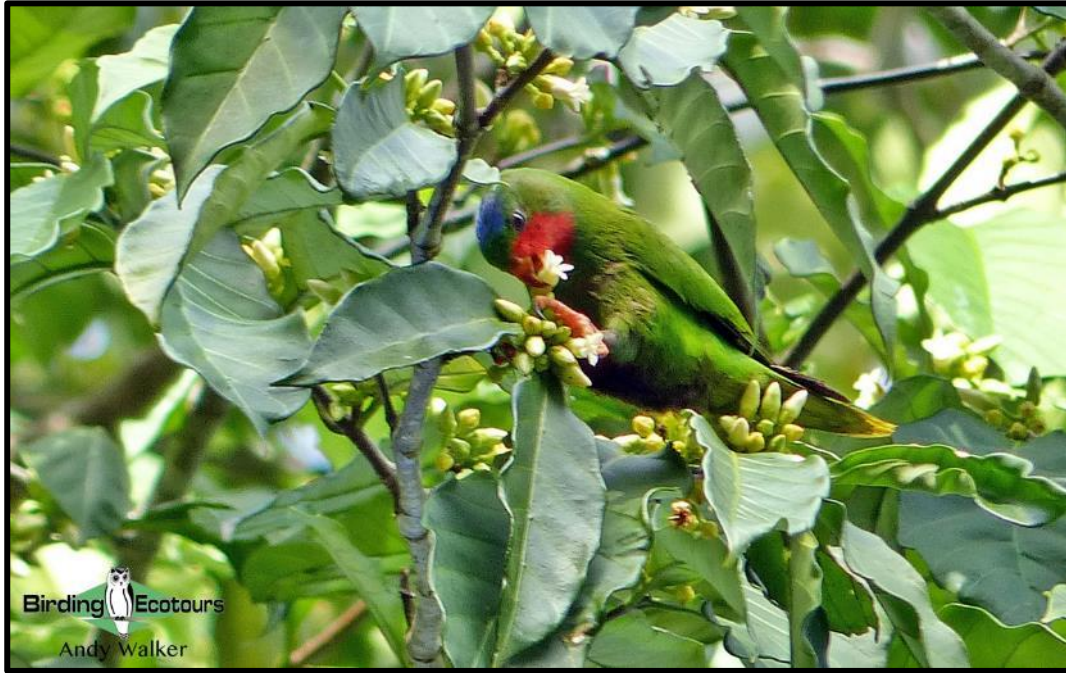
Blue-crowned Lorikeet will be a special target while birding Samoa.