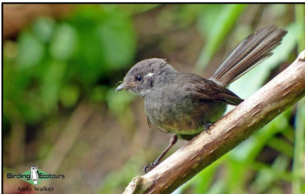
Samoan Fantail is one of several endemics we should see while birding on Upolu.