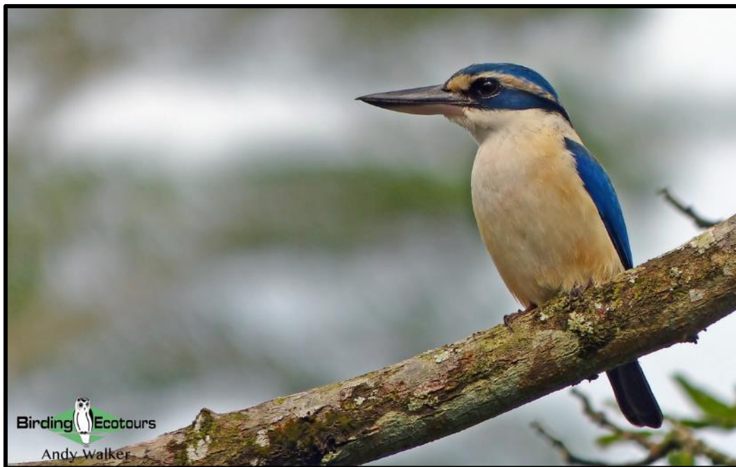
Pacific Kingfisher can be found on Viti Levu and occasionally shows very well.