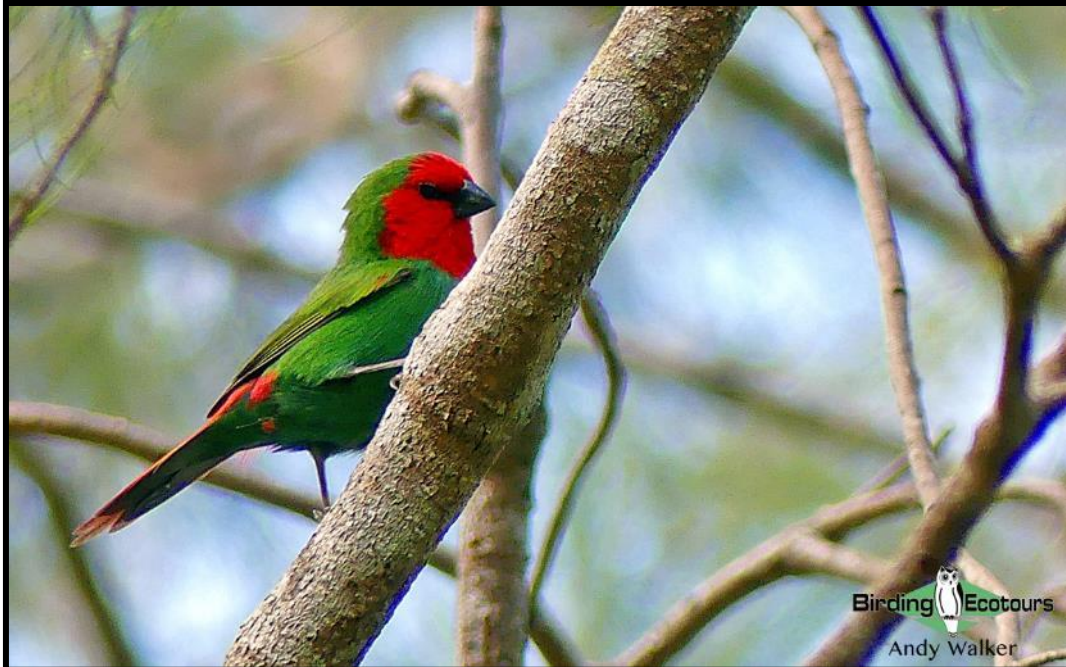
The endemic Red-throated Parrotfinch is one stunning bird and it can be seen in the Farino area.