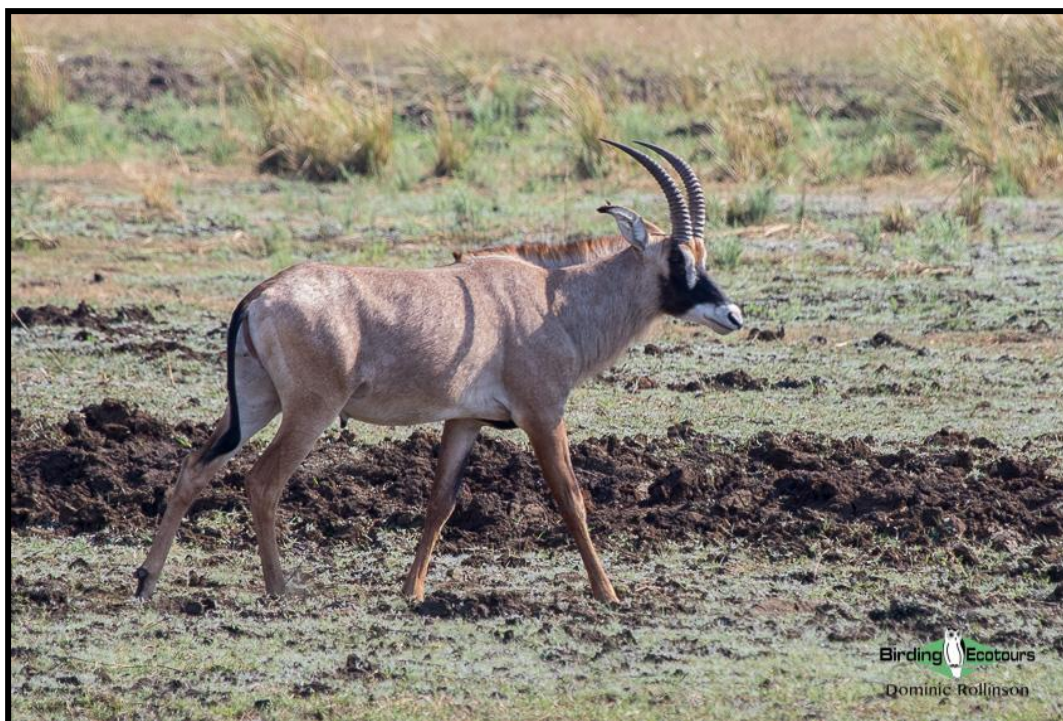
The rare Roan Antelope may be encountered on this trip.

With an early start we have the advantage of having the park to ourselves, since other game drive vehicles will only start making their way into the park. While looking for any nocturnal animals and birds that might still be out and about, we will make our way towards the teak and broadleaved woodland of the Kalwezi Valley and Nantanga cutline. Here we will focus our attention on finding Arnot's Chat, Broad-tailed and Long-tailed Paradise Whydahs, Racket-tailed and Broad-billed Rollers, Tree and Wood Pipits, Dusky Lark, Dickinson's Kestrel, White-breasted Cuckooshrike, Bronze-winged Courser, Orange-winged Pytilia, Green-capped Eremomela, African Cuckoo-Hawk, Ayers's Hawk-Eagle, and Lizard Buzzard .