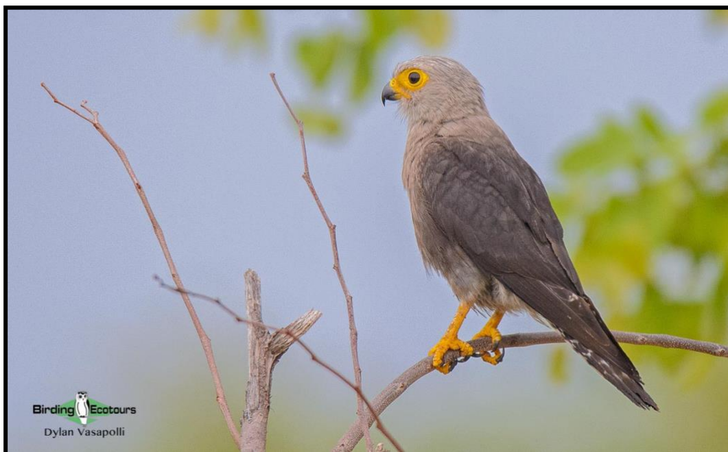
Dickinson's Kestrel; another raptor target.