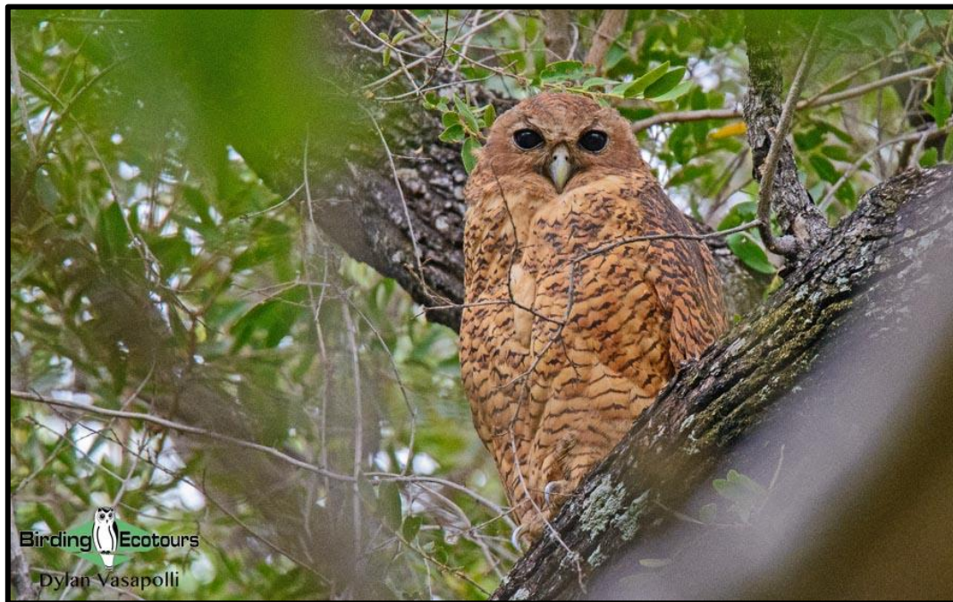
Pel's Fishing Owl is always a big target on a trip to the Okavango area.

Some of the birds we will be looking for include Pel's Fishing Owl, White-backed Night Heron, African Finfoot, Western Banded Snake Eagle, Rock Pratincole, Hartlaub's Babbler, Luapula and Chirping Cisticolas, Schalow's Turaco, Brown Firefinch, Coppery-tailed and White-browed Coucals, African Skimmer, Swamp Boubou, Copper Sunbird, Holub's Golden and Southern Brown-throated Weavers, Greater Swamp Warbler, Slaty Egret, and African Pygmy Goose.