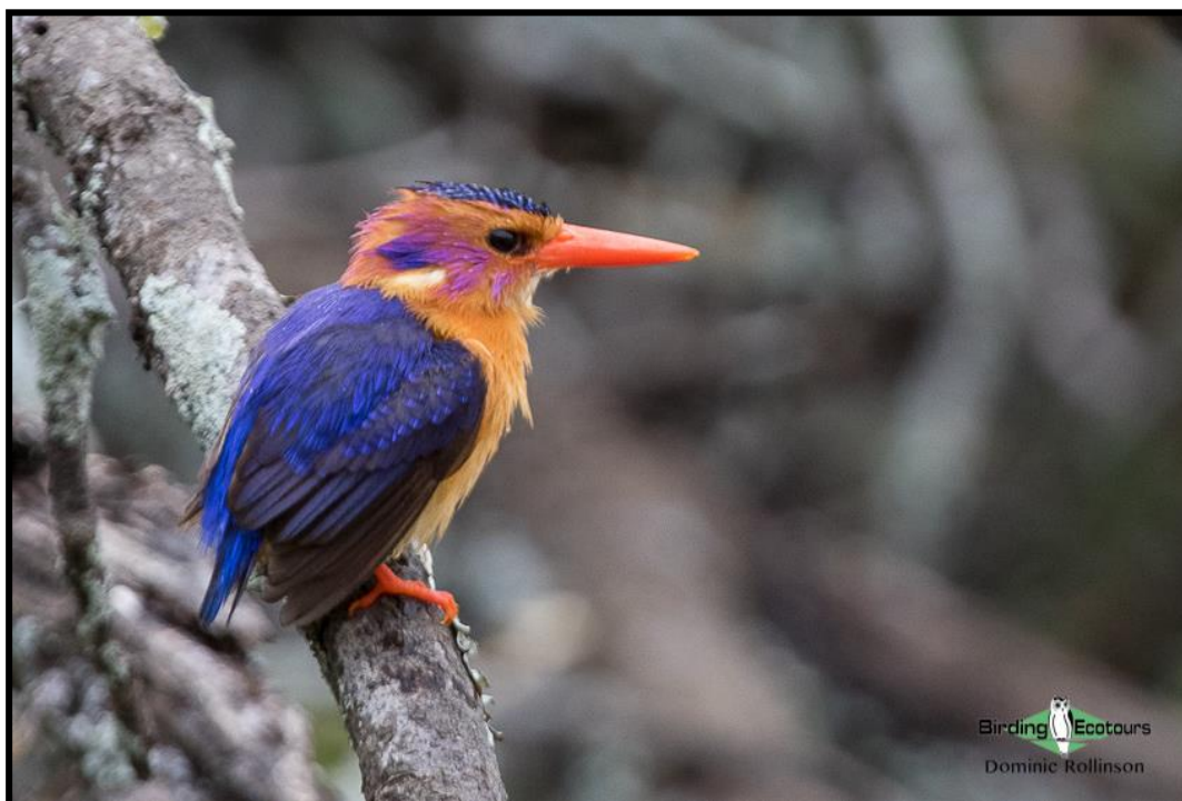
The tiny African Pygmy Kingfisher is an intra-African migrant to the area.

After lunch and relaxing for a few hours we will finish the day with a boat cruise in Chobe. Besides the birds mentioned earlier we will look for huge flocks of Collared and, if we are lucky, Black-winged Pratincoles, Southern Carmine and White-fronted Bee-eater colonies, Water Thick-knee, African Marsh Harrier, and Pink-backed and Great White Pelicans. The beautiful African Skimmer and African Fish Eagle are always present in good numbers. Between the birding we will also enjoy great game viewing, and seeing a baby elephant holding on to its mother's tail while crossing the river is an unforgettable sight.