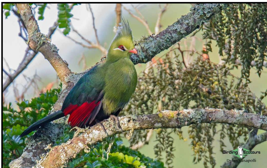
The loud and brightly colored Schalow's Turaco is found on Impalila Island.