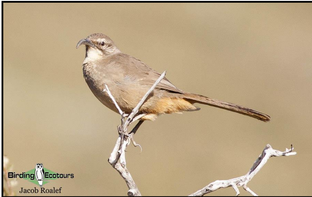
California Thrasher is typically found in thickets and shrubs.