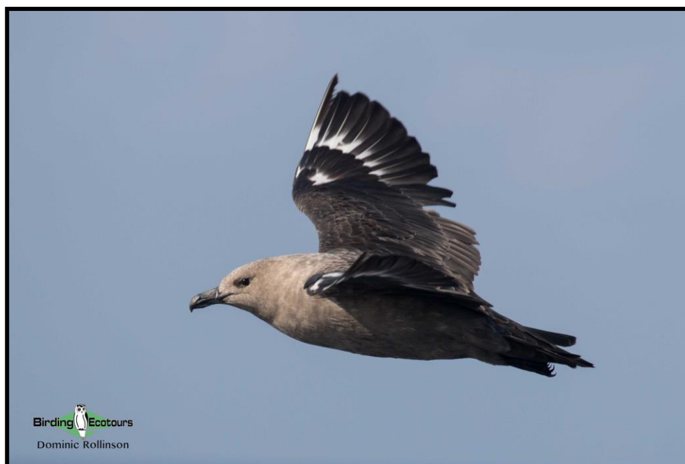
South Polar Skua may be seen on the pelagic trip.