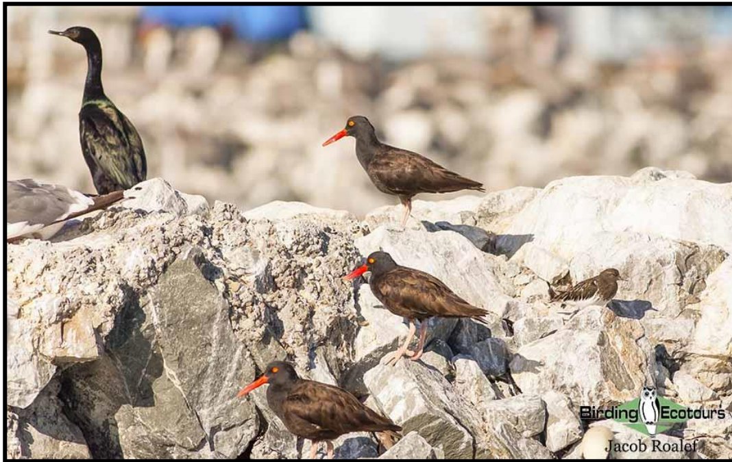
A typical coastal mix of Pelagic Cormorant , Black Oystercatchers , and Black Turnstone .