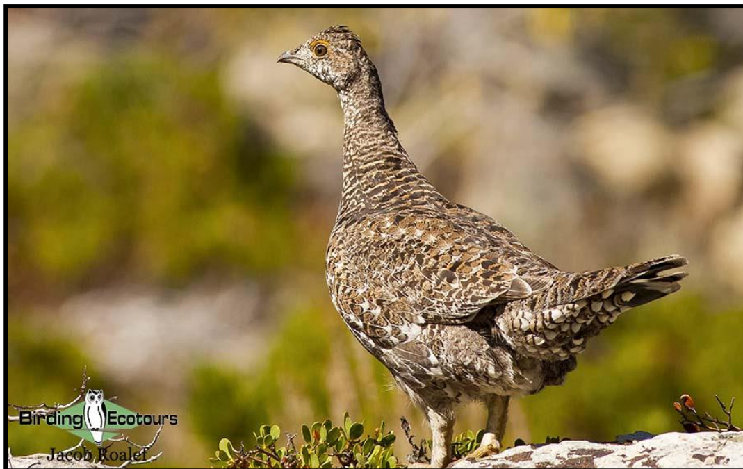
Sooty Grouse will be targeted in the Sierra Nevada region.