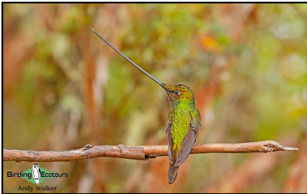
Sword-billed Hummingbird will be targeted on this trip.

This expansive tour of the magnificent north of Peru will lead us through all of the most rewarding birding hotspots of this astounding area brimming with avian riches. Major highlights will be the Owllet Lodge in the Abra Patricia Mountains and the Marvelous Spatuletail , perhaps the most beautiful hummingbird in the world. Other targets will include several range-restricted species, such as the endemics Peruvian Plantcutter and White-winged Guan in the deciduous habitat of the Northwest, the endemic and shy Little Inca Finch and Maranon Crescentchest in the dry Marañón Valley, and a high diversity of species such as White-capped Tanager , Golden-headed Quetzal , Masked Trogon , Sword-billed Hummingbird , and the endemic Yellow-scarfed Tanager in the Abra Patricia humid montane forest.