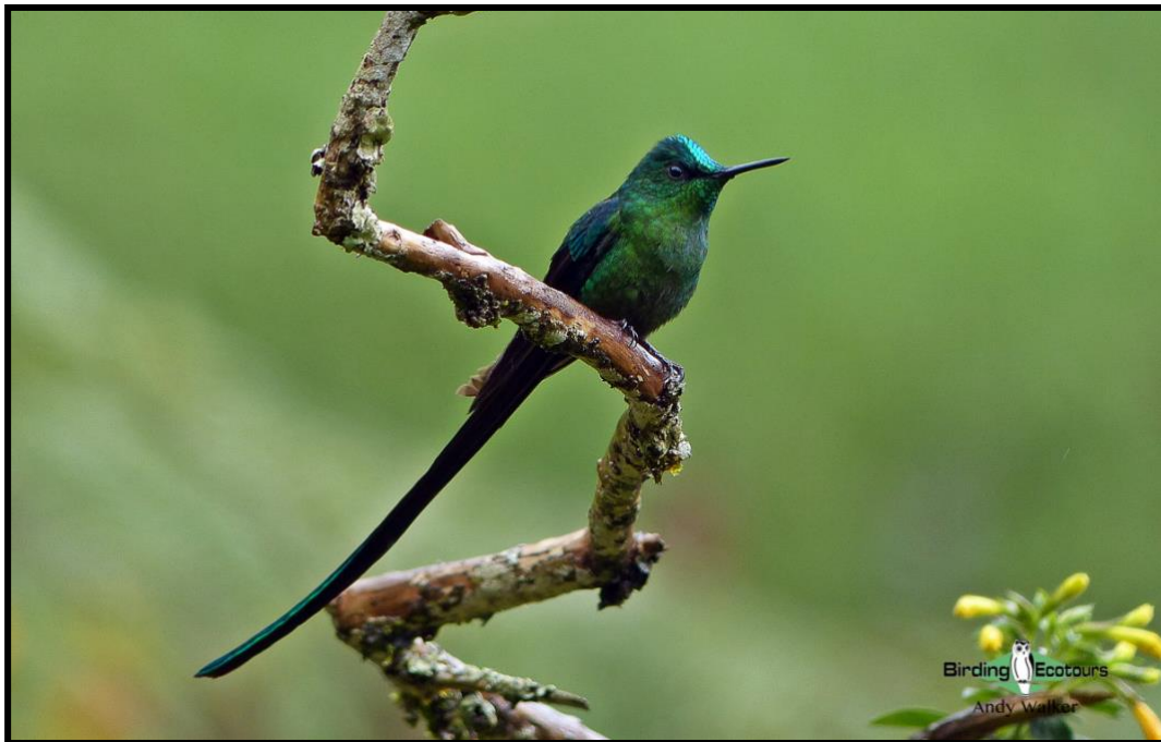
Long-tailed Sylph regularly visits the feeders at Owlet Lodge.