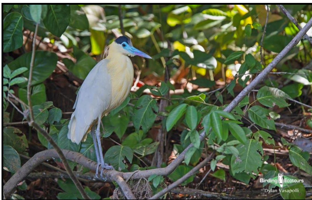
The attractive Capped Heron .