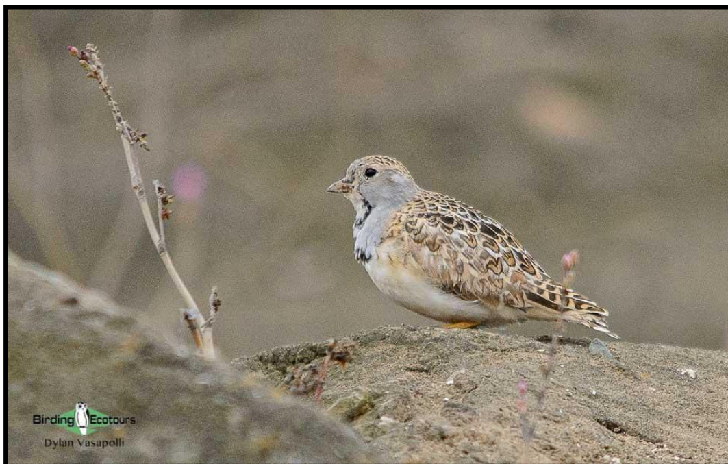
Least Seedsnipe can be seen at lower elevations along the coast.

Overnight: Casa Andina Select Chiclayo , Chiclayo