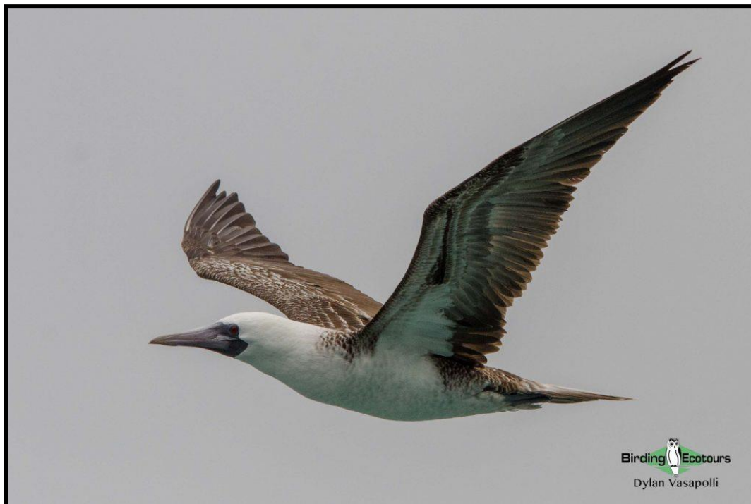
Peruvian Booby can be seen at the fishing village of Pucusana.