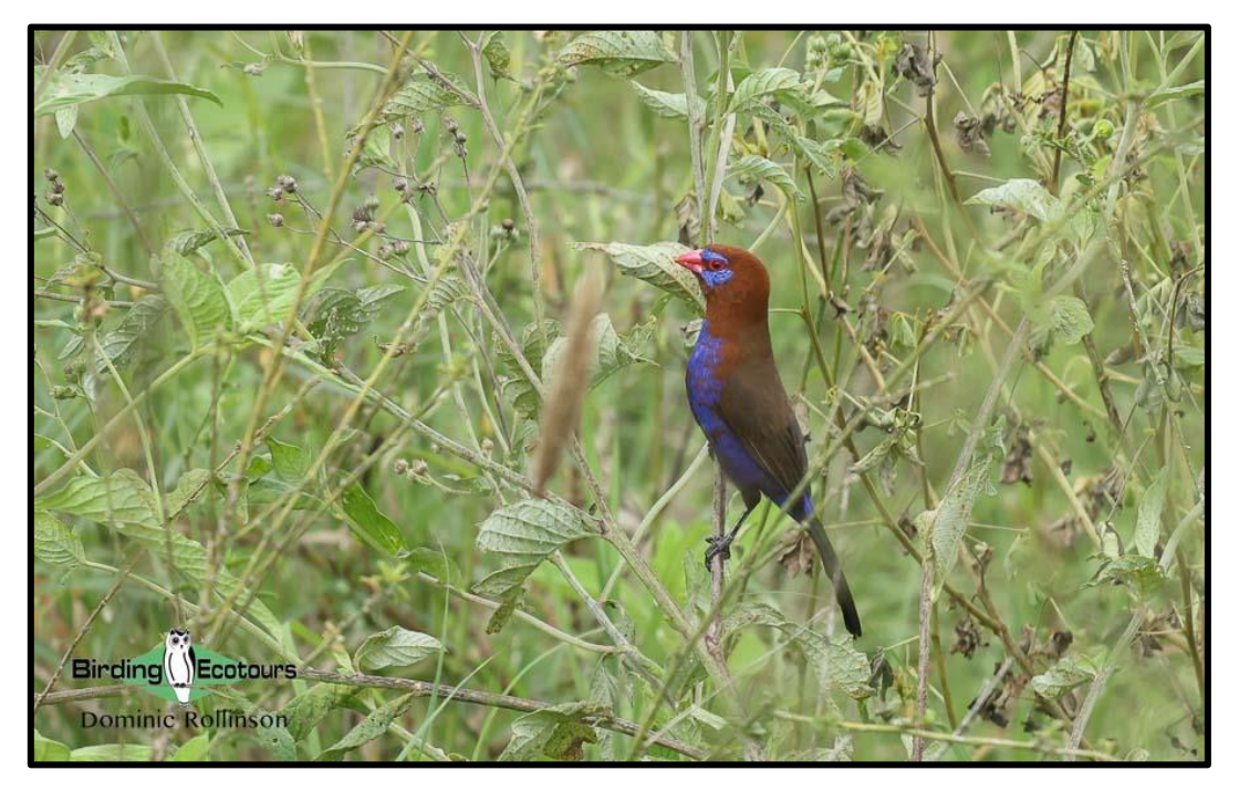
The gorgeous Purple Grenadier is readily encountered in northern Tanzania.

After breakfast we will make our way out of Arusha and arrive at Lake Manyara National Park in the late morning. Here we usually add quite a number of birds to our list and will enjoy a picnic lunch while being distracted by many exciting bird species. In the forested areas we'll be on the lookout for Narina Trogon, Grey Cuckooshrike, Mountain Wagtail, Crowned Hornbill, and the huge Silvery-cheeked Hornbill, among others. In the more open woodland, we should hopefully find Spotted Palm Thrush, Red-and-yellow Barbet, White-bellied Tit, Banded Parisoma, Rufous Chatterer, Rufous-tailed Weaver, Steel-blue and Straw-tailed Whydahs, and Purple Grenadier. The reserve is particularly good for raptors and some of our targets today include Lappet-faced and White-backed Vultures, Bateleur, Crowned Eagle, African Hawk-Eagle, African Goshawk, Verreaux's Eagle-Owl and the diminutive Pearl-spotted Owlet.