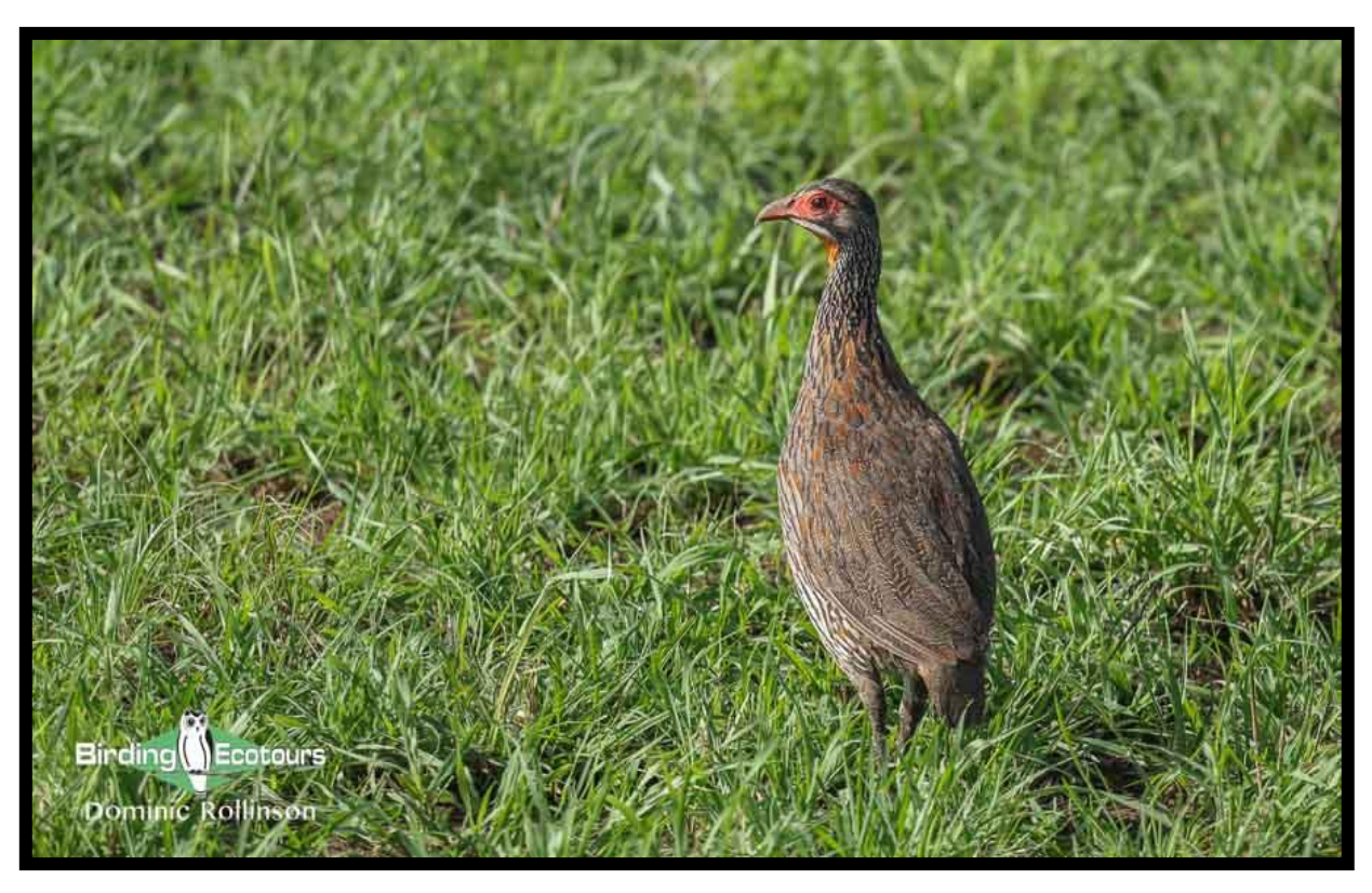
Grey-breasted Spurfowl, a highly localized Tanzanian endemic.

28 APRIL - 07 MAY 2025 28 APRIL - 07 MAY 2026