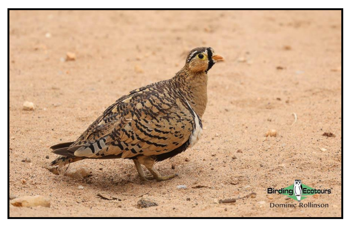
We often find Black-faced Sandgrouse in Tarangire National Park.