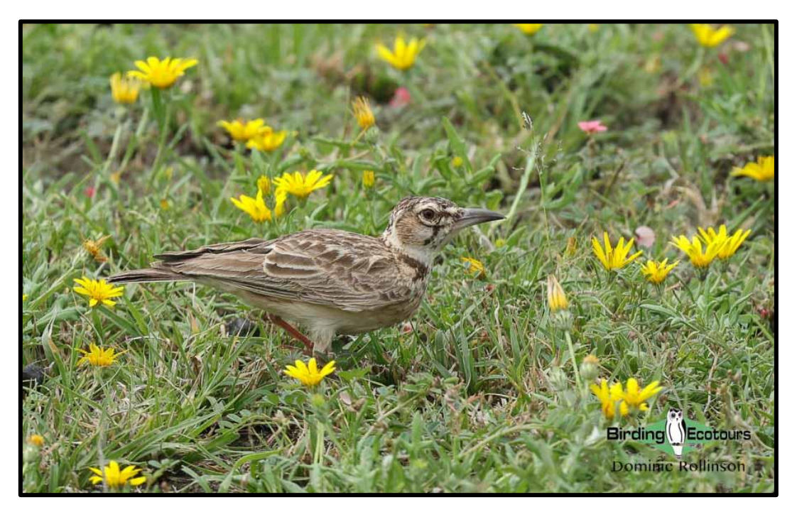
The distinctive Short-tailed Lark will be searched for alongside the rare Beesley's Lark.

We will spend time birding the (aptly named) Lark Plains for the rare and localized Beesley's Lark (less than 200 remaining) along with a host of other lark species, including Fawn-colored, Short-tailed, Athi Short-toed, and Rufous-naped Larks and Fischer's Sparrow-Lark. Other species for which we keep an eye out for on the plains include Kori Bustard, Eastern Chanting Goshawk, Greater Kestrel, Temminck's and Double-banded Coursers, Yellow-throated and Chestnut-bellied Sandgrouse, Abyssinian and Capped Wheatears, Taita Fiscal, and numerous others.