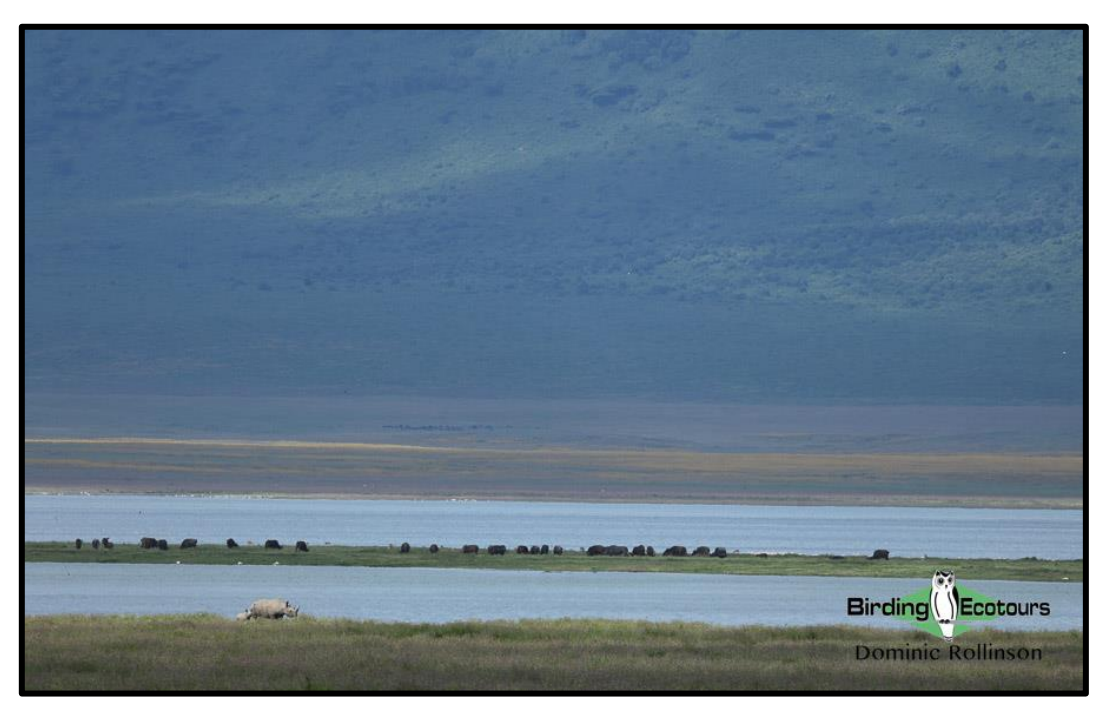
Black Rhinoceros in the picturesque Ngorongoro Crater.

very high density of Lion and large herbivores, some of them seemingly trapped by the natural enclosure formed by this huge, nicely intact caldera. About 25,000 large mammals, which also include Black Rhinoceros and a pool with Hippopotamus , inhabit the crater floor. With luck we might also see some of the smaller predators, like Serval , Bat-eared Fox , and African Golden Wolf , which was formerly classified as an African variant of the Eurasian Golden Jackal but now is thought to be more closely related to the Grey Wolf. As always, however, our main focus is on birds, although we stop for the other wildlife too, and we expect many additions to our growing bird list – Lesser Flamingo, Grey Crowned Crane, Abdim's Stork, Black-bellied and Kori Bustards, Pectoral-patch Cisticola, Rufous-tailed Weaver, Rosy-throated Longclaw, and many others are expected.