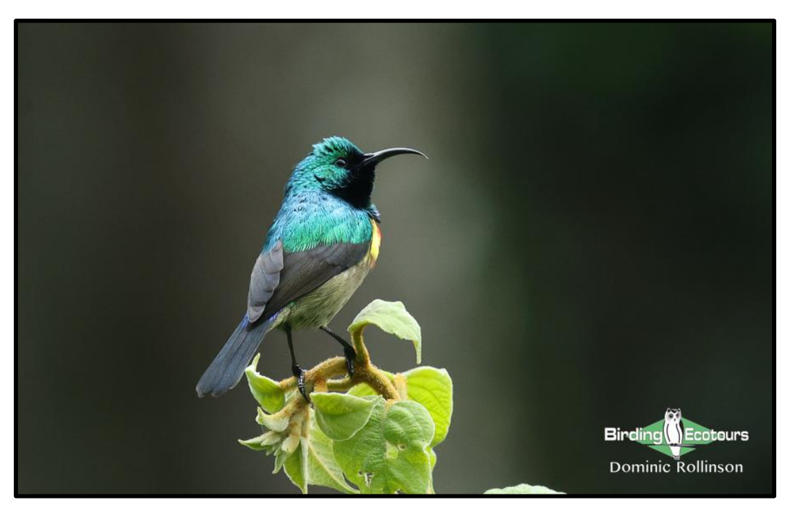
The attractive Eastern Double-collared Sunbird.

Today we will visit the Endoro section of Ngorongoro Conservation Area as well as the splendid Gibb's Farm, which is a great place for lunch and to add new birds to the growing list. This morning's birding will be quite different from the rest of the trip as we enjoy some fine forest birding while walking the Elephant Caves Trail. Highlights of this morning will hopefully include, Narina Trogon, Moustached Tinkerbird, Pallid and Scaly-throated Honeyguides, African Broadbill, Purple-throated Cuckooshrike, Black-fronted Bushshrike, Blue-mantled Crested Flycatcher, Brown-headed Apalis, Grey-capped Warbler, Black-headed Mountain Greenbul, Brown Woodland Warbler, African Hill Babbler, Mbulu White-eye, Grey-headed Nigrita and Red-throated Twinspot. We will keep an eye out overhead for the likes of Ayres's Hawk-Eagle, Black Sparrowhawk, Augur Buzzard and Nyanza Swift. The prehistoric-looking Schalow's Turaco adds a spectacular flash of crimson and green, and, if one gets a good view, its spectacular crest leaves even a hardened birder gob smacked.