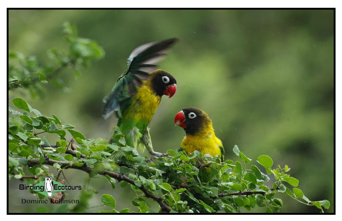
The endemic Yellow-collared Lovebird is one of our many colorful targets on this trip.

This northern <u>Tanzania</u> birding tour is designed to give you the opportunity to experience the real <u>Africa</u>, given just 10 days. Where else can you see Leopard , Cheetah , Lion , and a hundred spectacular bird species in a single day? Where else can you see Africa's highest mountain (<u>Kilimanjaro</u>) and two of the world's most famous game parks (the Serengeti and the spectacular <u>Ngorongoro Crater</u>)? This northern Tanzania birding tour not only offers an impressive diversity of localized bird species but also incredible wildlife sightings, most importantly the mind-blowing wildebeest migration through the Serengeti, which simply must be seen to be believed!