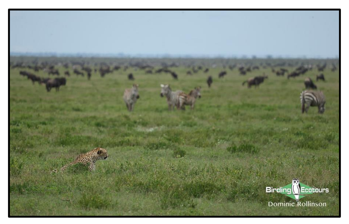
Tanzania must rank as one of the best countries on Earth for Cheetah , which take advantage of the massive herds of migrating wildebeest!

2) a short extension to <u>Pemba Island</u>. Pemba Island is wilder than <u>Zanzibar</u> and has some endemic birds.