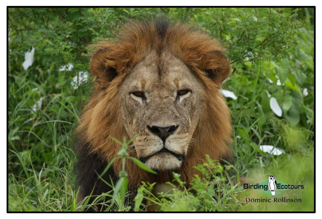
The Serengeti supports large numbers of Lions.

This morning we embark on a spectacular journey that few people will ever forget. If you've never been to Africa before, you're likely to be amazed by African Elephant, African Buffalo, and the sheer number of bird species. After an exciting drive we'll reach the Serengeti, where we enjoy the huge and impressive wildebeest migration, not to mention the large numbers of Plains Zebras and Thomson's Gazelles. Other megafauna that we'll search for include Topi, Common Eland, Grant's Gazelle, Bohor Reedbuck, and Masai Giraffe. This is one of the best places on the planet to see big cats – we've sometimes seen Lion, Leopard, and Cheetah in a single day, as well as some of the smaller cats such as Serval and Caracal. Finding a kill should allow us to see a good number of vulture species, such as Rüppell's, White-backed, Lappet-faced, White-headed, and Hooded Vultures.