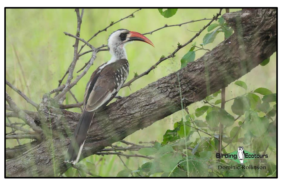
Tanzanian Red-billed Hornbill – a Tanzanian endemic.