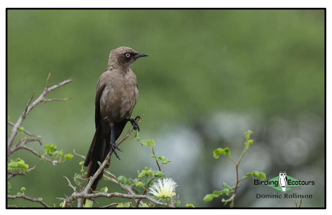
Ashy Starlings are numerous in Tarangire National Park.