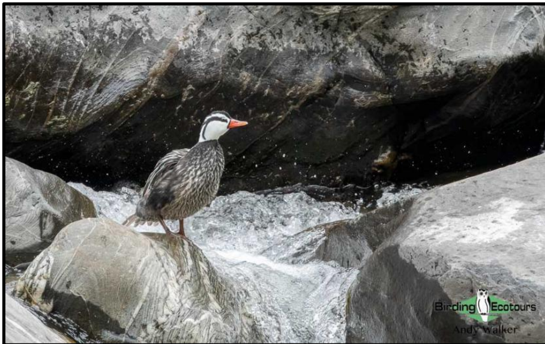
The charismatic Torrent Duck occurs in fast-flowing streams in the foothills of the Andes.

Our northwest Argentina trip can be considered one of the best birding trips in southern South America as it provides a unique set of birds found only in this part of the world. This trip appeals both to seasoned birders and those visiting South America for the first time. During this spectacular 17-day birding trip you may feast your eyes on some of the region's most-wanted species such as Rufous-throated Dipper , Diademed Sandpiper-Plover , Sandy Gallito , Red-faced Guan , Tucuman Mountain Finch , Moreno's Ground Dove , Red-tailed Comet , Wedge-tailed Hillstar , the attractive Burrowing Parrot , White-throated Antpitta , Tucuman Amazon , Lyre-tailed Nightjar , Giant Antshrike , Black-legged Seriema and Black-bodied Woodpecker . Other more widespread yet classic Neotropical species will include Andean Condor , Andean Goose , Torrent Duck and Southern Screamer , all highly prized species for those visiting South America for the first time.