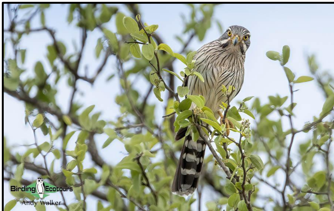
The most-wanted Spot-winged Falconet is one of the main targets in the Chaco.