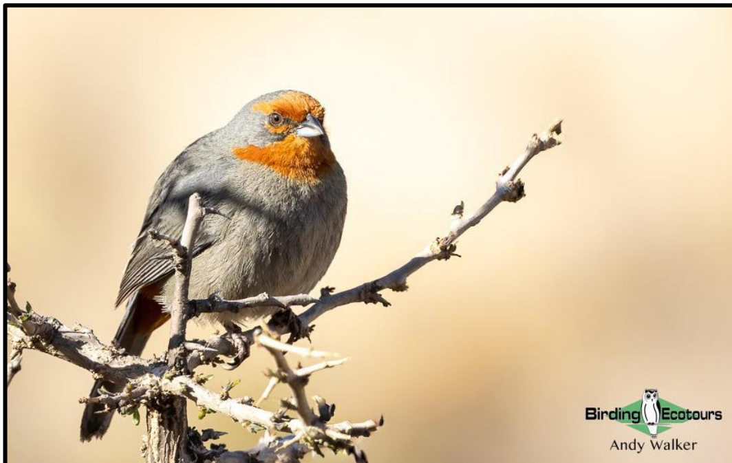
The range-restricted Tucuman Mountain Finch may be seen at high elevation in the Andes Mountains.

Overnight: Hostería Lunahuana, Tafi del Valle