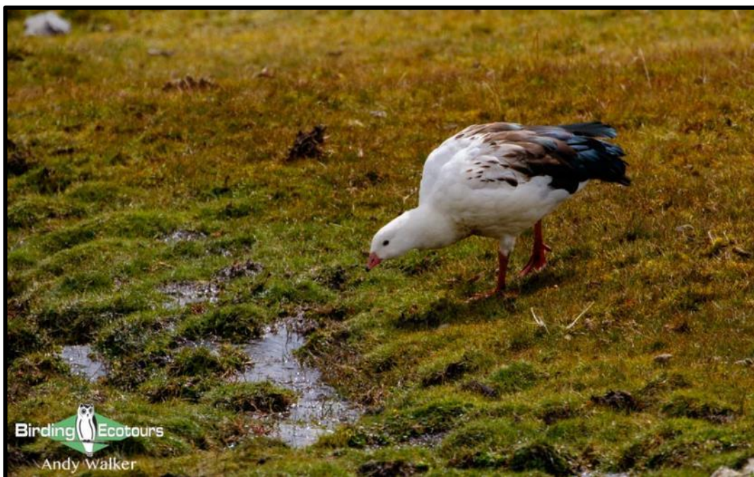
Andean Goose can be seen in high-altitude wetlands.

All in all, this is a spectacular tour through Argentina's famous wine-growing area taking in some of South America's classic bird species as we traverse varied and breathtaking landscapes.