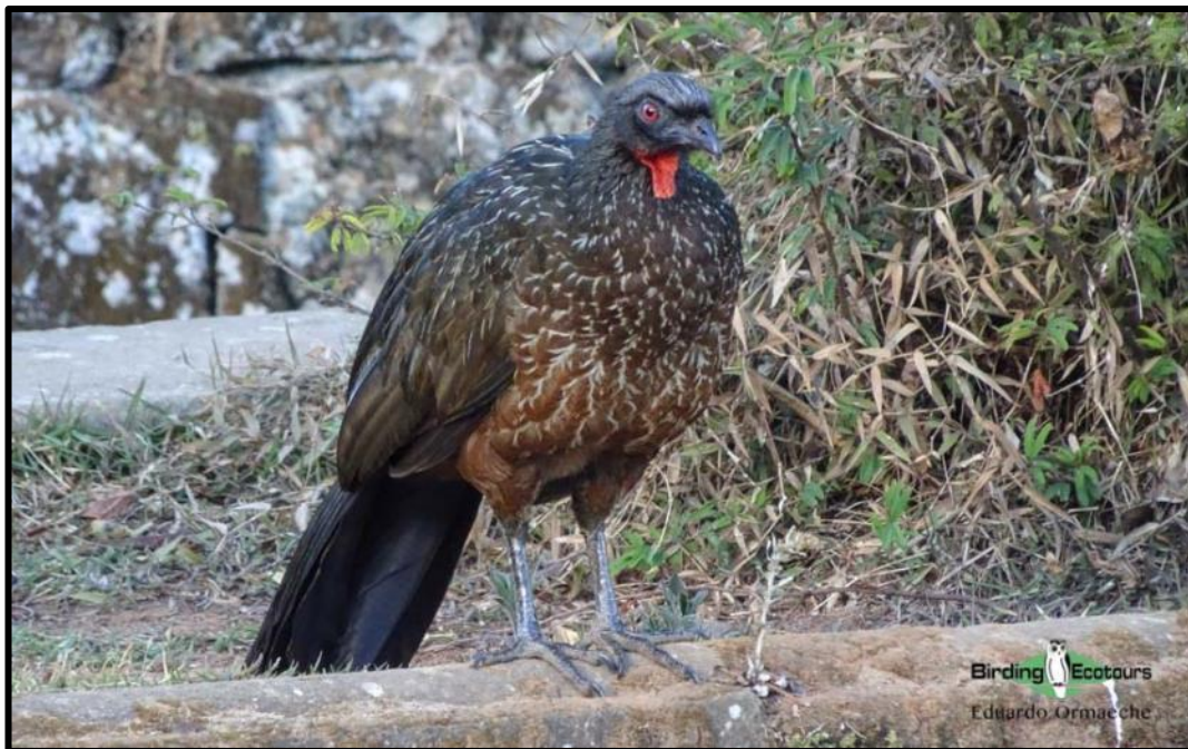
Yungas Guan can be seen in the forests of Calilegua National Park.