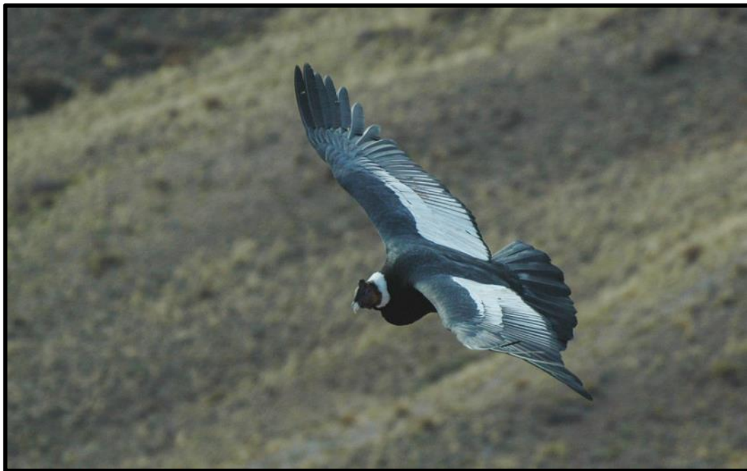
Andean Condor is an iconic bird of the high Andes.

Overnight: Hostería Lunahuana, Tafi del Valle