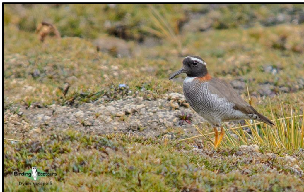
The Diademed Sandpiper-Plover is another trip target in the high Andes of Argentina.