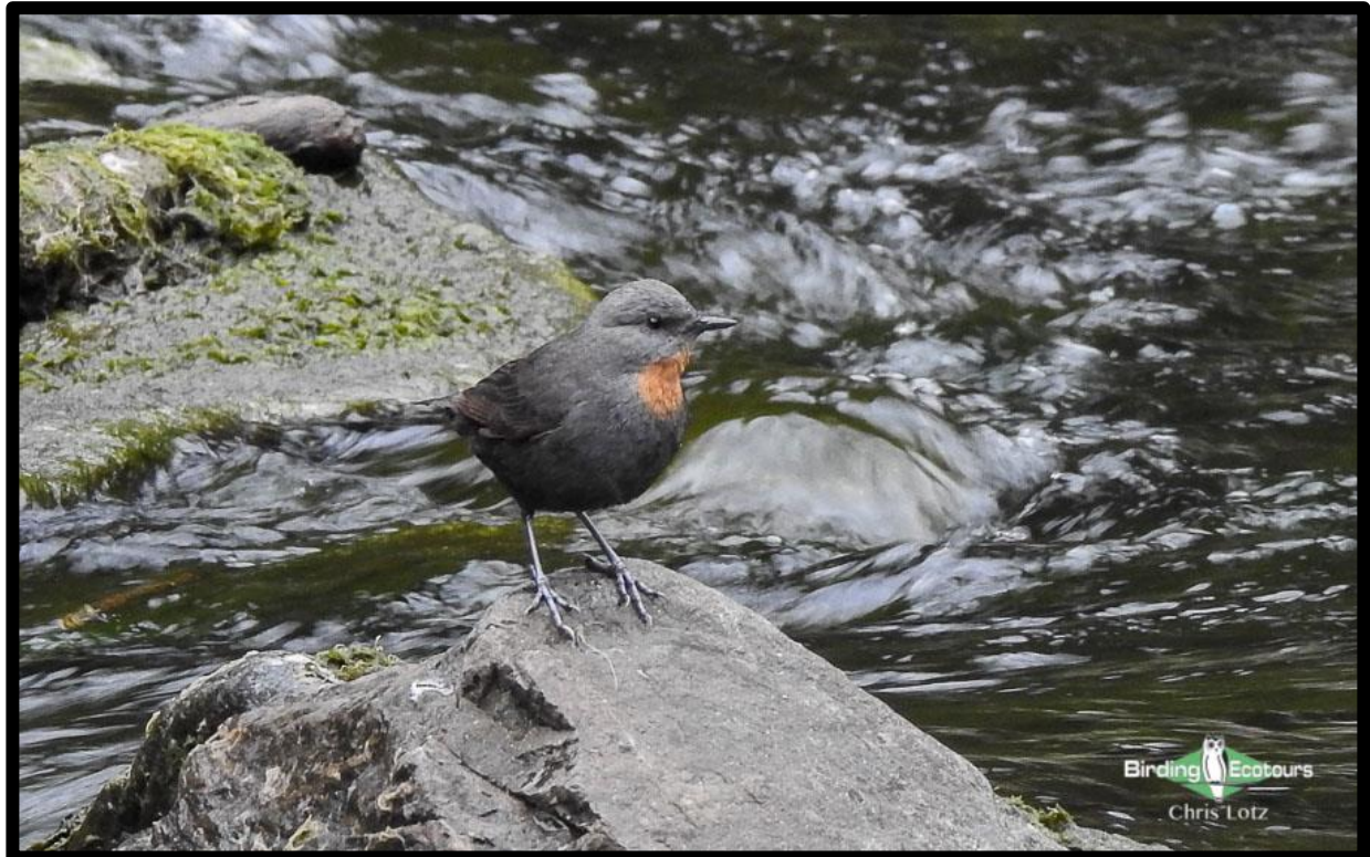
Rufous-throated Dipper is one of the most-wanted targets of the trip.