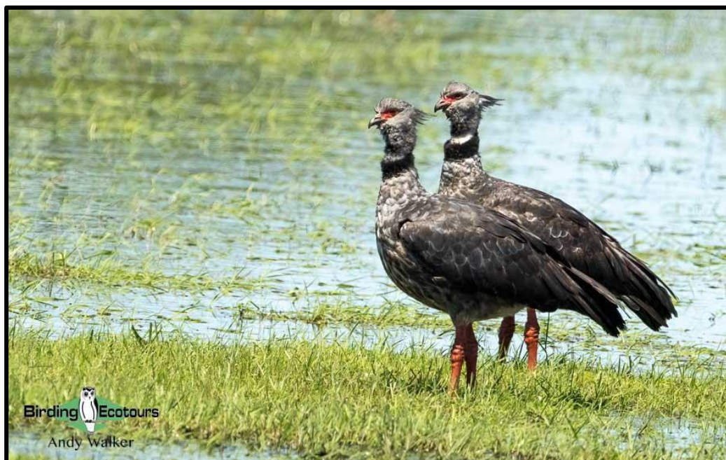
The unusual Southern Screamer is often seen in wetlands near Buenos Aires.