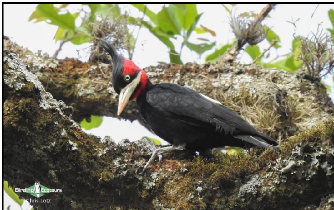
The handsome Cream-backed Woodpecker is possible around Salta.

The scenery today arguably gets even better (if that is possible) as we drive through Los Cardones National Park and other remarkable areas. We might see our first of some unusual and spectacular hummingbirds such as Red-tailed Comet and White-sided Hillstar while Rufous-bellied Mountain Tanager is also one of our key targets. We should add further parrots to our list which might include Scaly-headed Parrot and Grey-hooded Parakeet . Zimmer's Tapaculo is another high-altitude species that we really hope will cooperate with us. Thankfully, Rock Earthcreeper and Rufous-banded Miner are usually easy enough to find.