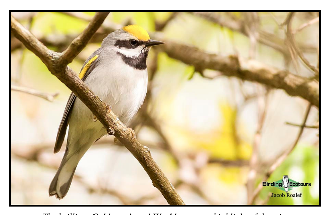
The brilliant Golden-winged Warbler, a true highlight of the trip.

Northern Ohio is bordered by the great Lake Erie, creating expansive freshwater marshes. The birding in this area has been made famous by the Biggest Week in American Birding Festival hosted by our friends at the Black Swamp Bird Observatory. The lake is like a freshwater ocean, creating a similar obstacle for migrating birds, as they migrate along its shores before making the risky water crossing at its narrowest point. Luckily, the shorelines are full of fantastic nature preserves, parks and refuges, with great birding trails, including the worldfamous Magee Marsh Wildlife Area. As birds migrate north and encounter the huge body of water, they put down into the trees along the shore to rest and feed before attempting to cross the unknown. This creates a massive build-up of birds with one mission: to fuel up before crossing the lake. Many of them take the shortest water crossing to Point Pelee, where they arrive tired and hungry; you can enjoy these incoming migrants on our custom tours here.