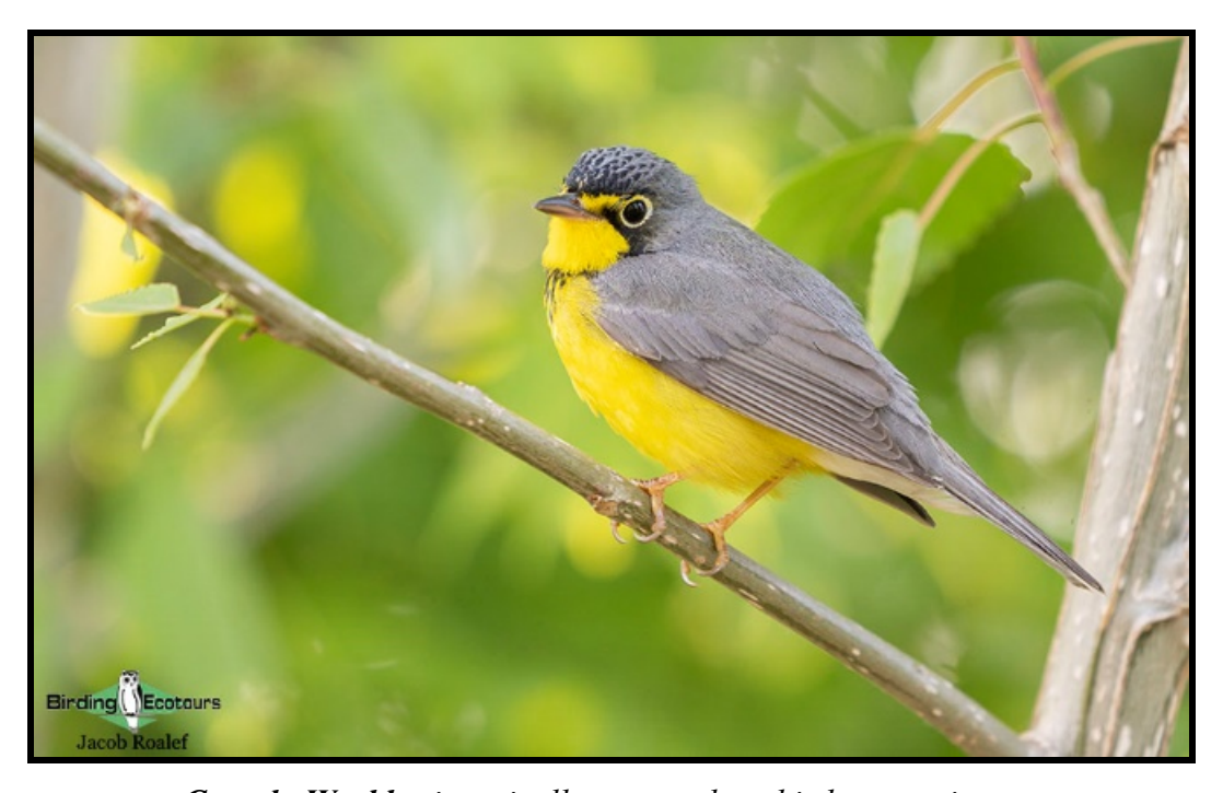
Canada Warbler is typically a second or third wave migrant.