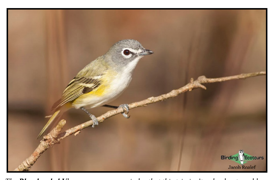
The Blue-headed Vireo serves as a reminder that this trip isn't only about warblers.