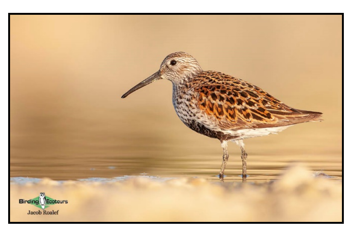
Dunlin will be in their striking breeding plumage this time of year.

We are partnering with the Golden Gate Bird Alliance for our 2024 tour and are excited to share this trip with their members as well.