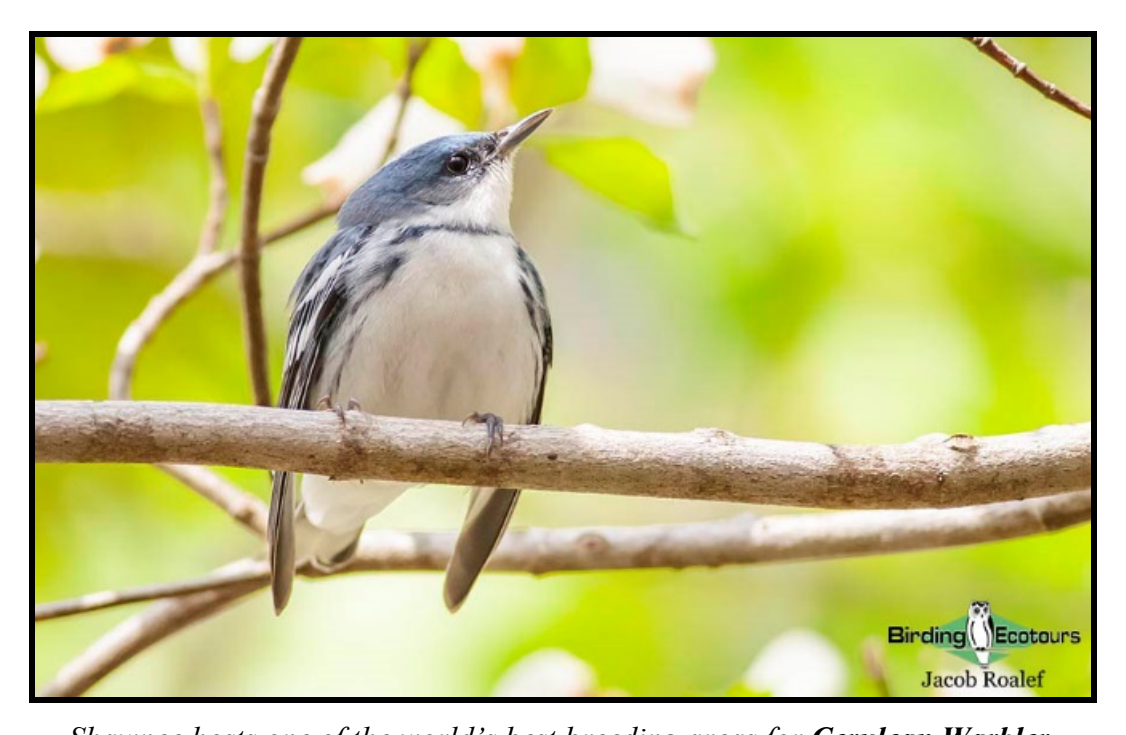
Shawnee hosts one of the world's best breeding areas for Cerulean Warbler.