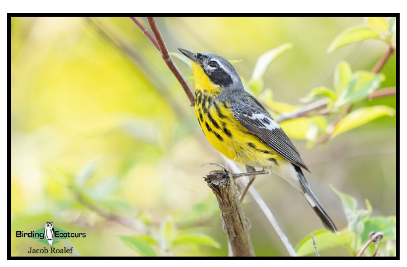
The stunning Magnolia Warbler is always a favorite warbler.