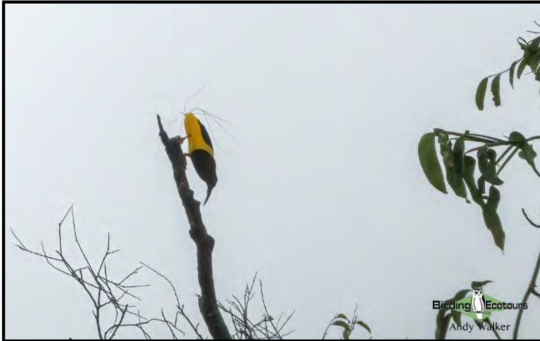
The remarkable sight of a displaying Twelve-wired Bird-of-paradise from near Kwatu Camp.

There are plenty of other great birds here too, and we will be keeping our eyes peeled for the likes of Doria's Goshawk , Grey-headed Goshawk , Variable Goshawk , Orange-bellied Fruit Dove , Pink-spotted Fruit Dove , Palm Cockatoo , Red-cheeked Parrot , Papuan Eclectus , Dusky-cheeked Fig Parrot , Ivory-billed Coucal , Blyth's Hornbill , Eastern Hooded Pitta , Moustached Treeswift , Southern Variable Pitohui , Emperor Fairywren , Shining Flycatcher , Black-sided Robin , Frilled Monarch , Hooded Butcherbird , Boyer's Cuckooshrike , Golden Cuckooshrike , White-bellied Thicket Fantail , Lowland Peltops , and Black Sunbird .