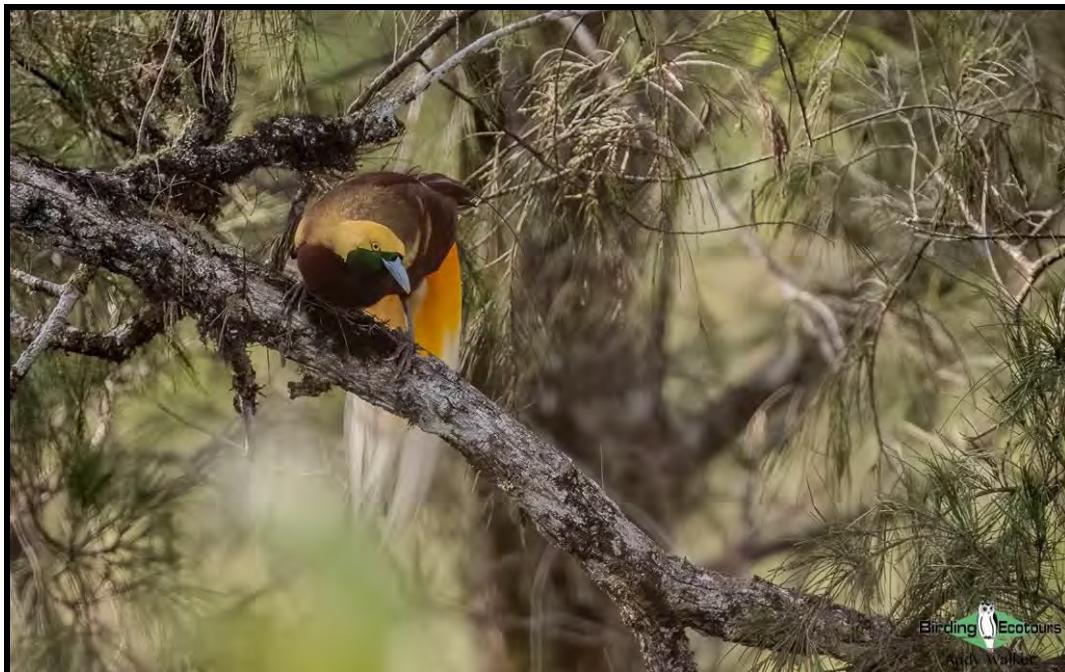
Lesser Bird-of-paradise can be found at some of the highland locations we visit on the tour.