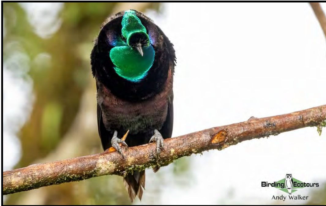
Ribbon-tailed Astrapia looking straight at you is an impressive sight!

Sittella, Ornate Melidectes, Grey-streaked Honeyeater, Fan-tailed Berrypecker, Eastern Crested Berrypecker, Tit Berrypecker, Mountain Firetail, Yellow-breasted Bowerbird, Torrent Flyrobin, and Torrent-lark.