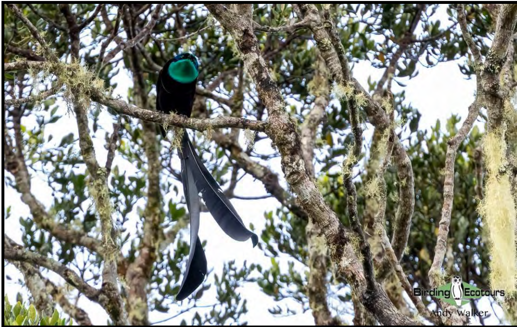
A gorgeous male Princess Stephanie's Astrapia is another huge and spectacular bird-of-paradise.

Of course, we will also be looking out for more views or improved views of birds-of-paradise, including King of Saxony Bird-of-paradise , Magnificent Bird-of-paradise , Princess Stephanie's Astrapia , Ribbon-tailed Astrapia , Brown Sicklebill , Lawes's Parotia , and Greater Lophorina .