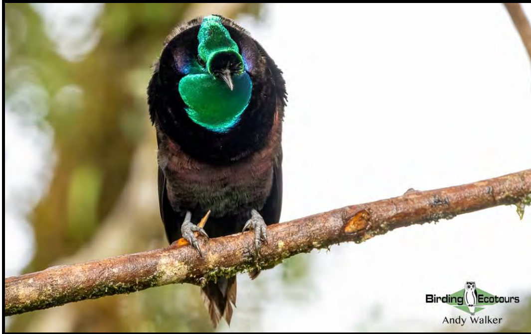
Ribbon-tailed Astrapia looking straight at you is an impressive sight!

Sittella, Ornate Melidectes, Grey-streaked Honeyeater, Fan-tailed Berrypecker, Eastern Crested Berrypecker, Tit Berrypecker, Mountain Firetail, Yellow-breasted Bowerbird, Torrent Flyrobin, and Torrent-lark.