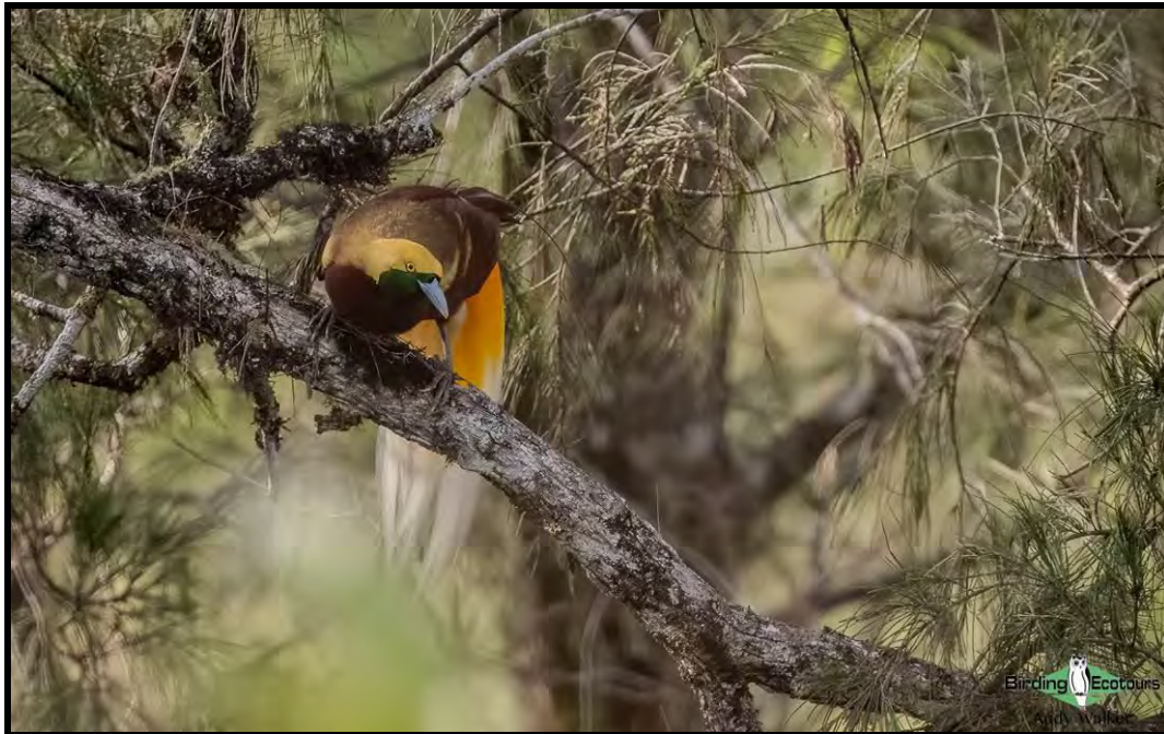
Lesser Bird-of-paradise can be found at some of the highland locations we visit on the tour.