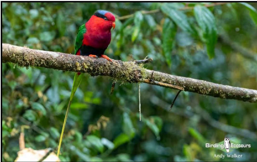
The rather colorful Stella's Lorikeet occasionally visits the Kumul Lodge bird feeders.