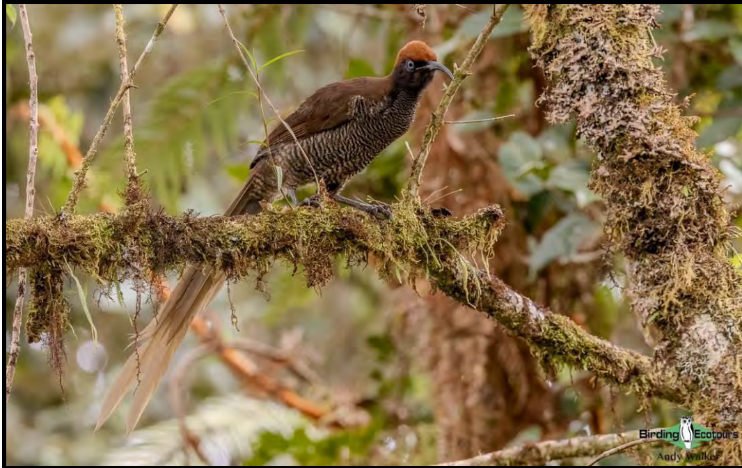
Close views of Brown Sickbill can be enjoyed at the bird feeders at Kumul Lodge.

Overnight (two nights): Kumul Lodge , Mount Hagen