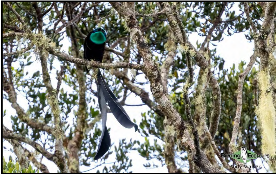
A gorgeous male Princess Stephanie's Astrapia is another huge and spectacular bird-of-paradise.

Of course, we will also be looking out for more views or improved views of birds-of-paradise, including King of Saxony Bird-of-paradise , Magnificent Bird-of-paradise , Princess Stephanie's Astrapia , Ribbon-tailed Astrapia , Brown Sicklebill , Lawes's Parotia , and Greater Lophorina .