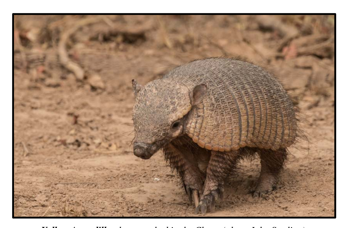
Yellow Armadillo photographed in the Chaco.

Overnight: Hotel Aeropuerto, Mariscal Estigarribia