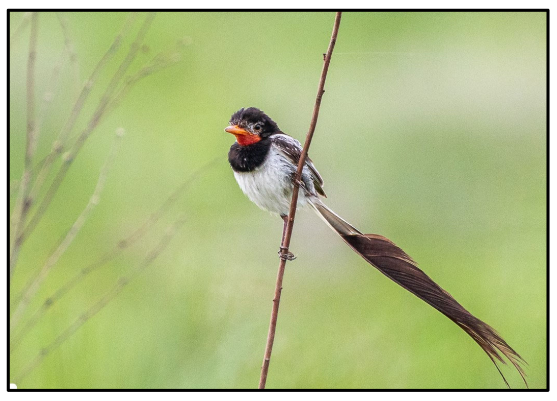
Strange-tailed Tyrant, one of the five incredible-looking, long-tailed 'New World' flycatchers which are all possible on this tour.

During this birding tour of Paraguay, we spend quite a lot of time exploring the vast Chaco habitat; Paraguay holds the largest intact tracts of this unique and threatened, uniquely South American, habitat. Not only is the Chaco habitat particularly large in Paraguay, but it is also really diverse here and contains Chaco ecotones such as the Dry and Humid Chaco, as well as the transition zone between the two. This diversity equates to a large number of Chaco-adapted bird species, making Paraguay the perfect destination to target all of the Chaco specials. These Chaco specials include some fascinating species such as Black-legged Seriema, Crested Gallito, Spot-winged Falconet, Quebracho Crested Tinamou, Black-bodied Woodpecker, Chaco Owl, and Chaco Eagle.