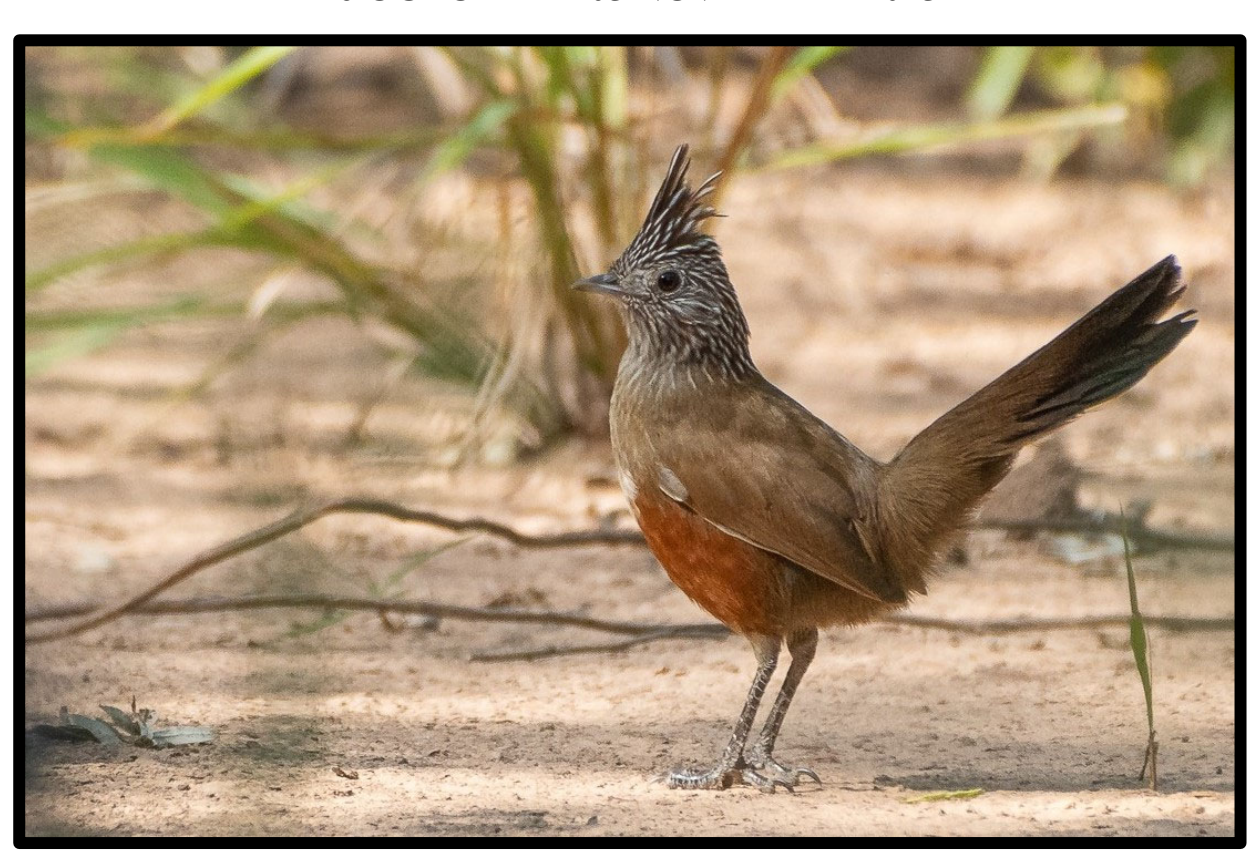
Crested Gallito is one of the targets of this Paraguay birding and wildlife adventure.

26 OCTOBER – 05 NOVEMBER 2024 26 OCTOBER – 05 NOVEMBER 2025