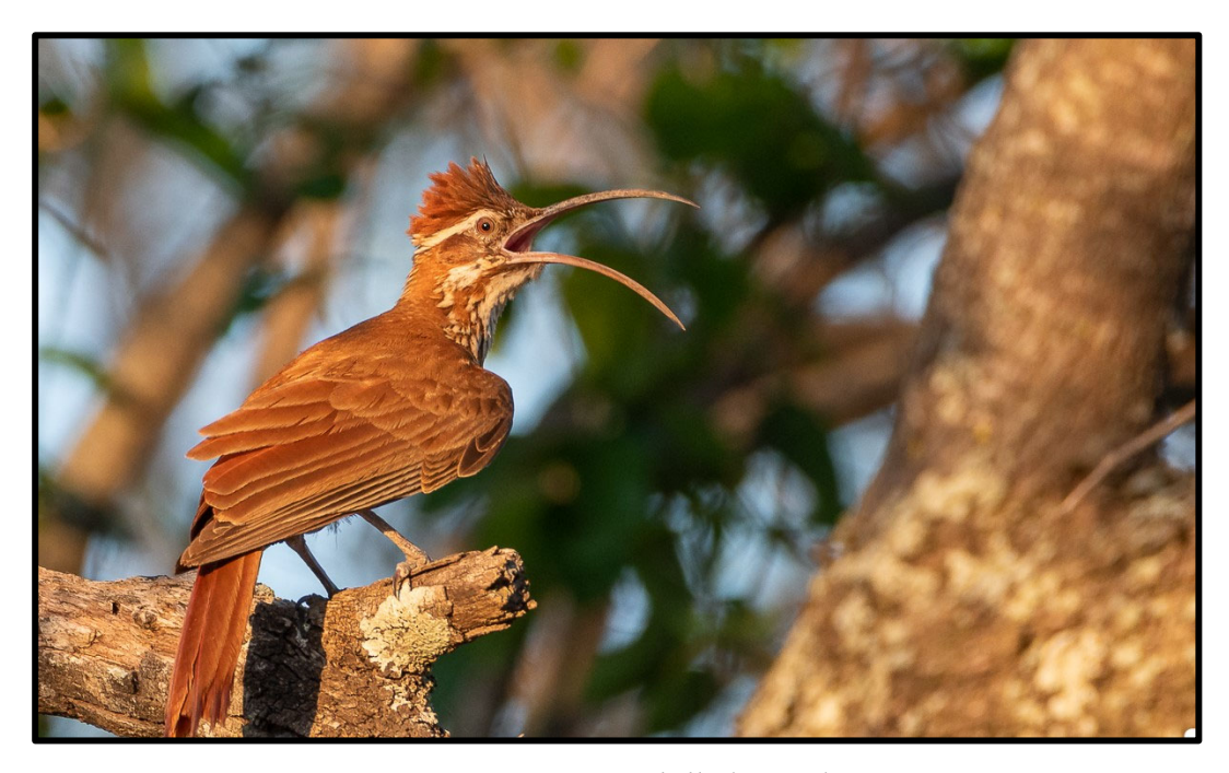
The impressive and appropriately named Scimitar-billed Woodcreeper.