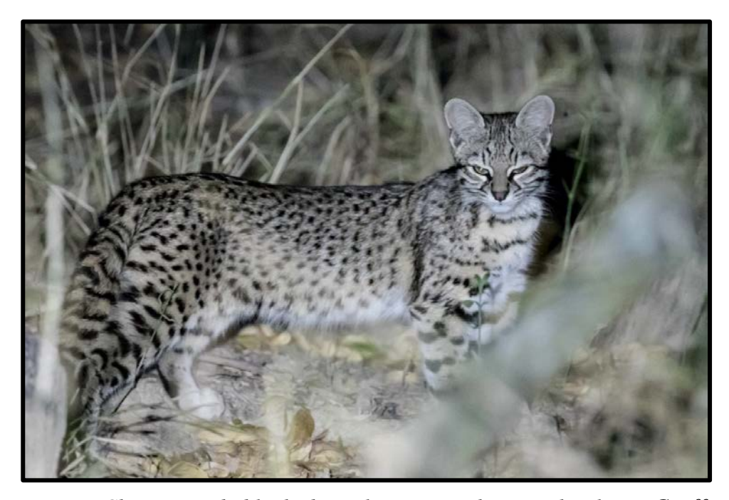
The Paraguayan Chaco is probably the best place on Earth to see the elusive Geoffroy's Cat.

Paraguay is not only about the birding though, and it is one of the best places to view a number of rarely seen and elusive South American mammals. In fact, as a wildlife viewing destination, it is probably only surpassed by the <u>Brazilian Pantanal!</u> While out in the field, we will be on the lookout for unusual animals and will also partake in a few nocturnal drives where we have better chances of finding certain elusive species. Some of the more exciting mammals we stand a chance of finding on this trip include <u>Chacoan Peccary</u>, <u>Lowland Tapir</u>, <u>Crab-eating Fox</u>, <u>Pampas Fox</u>, <u>Capybara</u>, <u>Chacoan Mara</u>, <u>Coypu</u>, the elusive <u>Giant Anteater</u>, and rare felines such as <u>Puma</u>, <u>Jaguar</u>, <u>Jaguarundi</u> and <u>Geoffroy's Cat</u>.