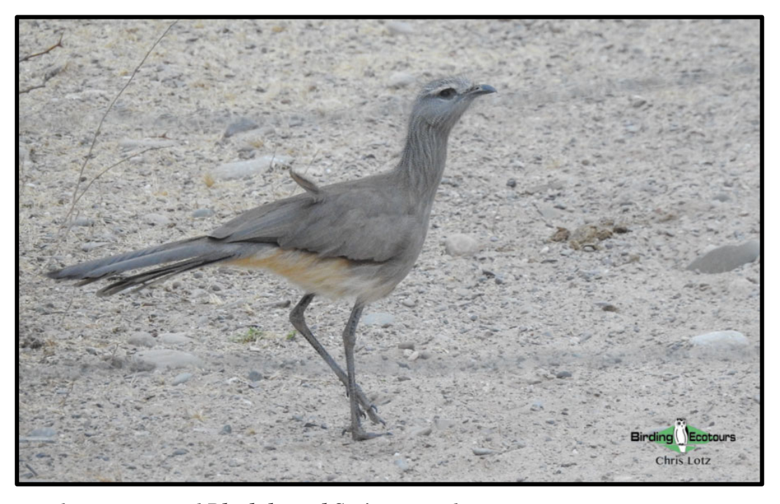
The most-wanted Black-legged Seriema can be seen on our Paraguay tours.