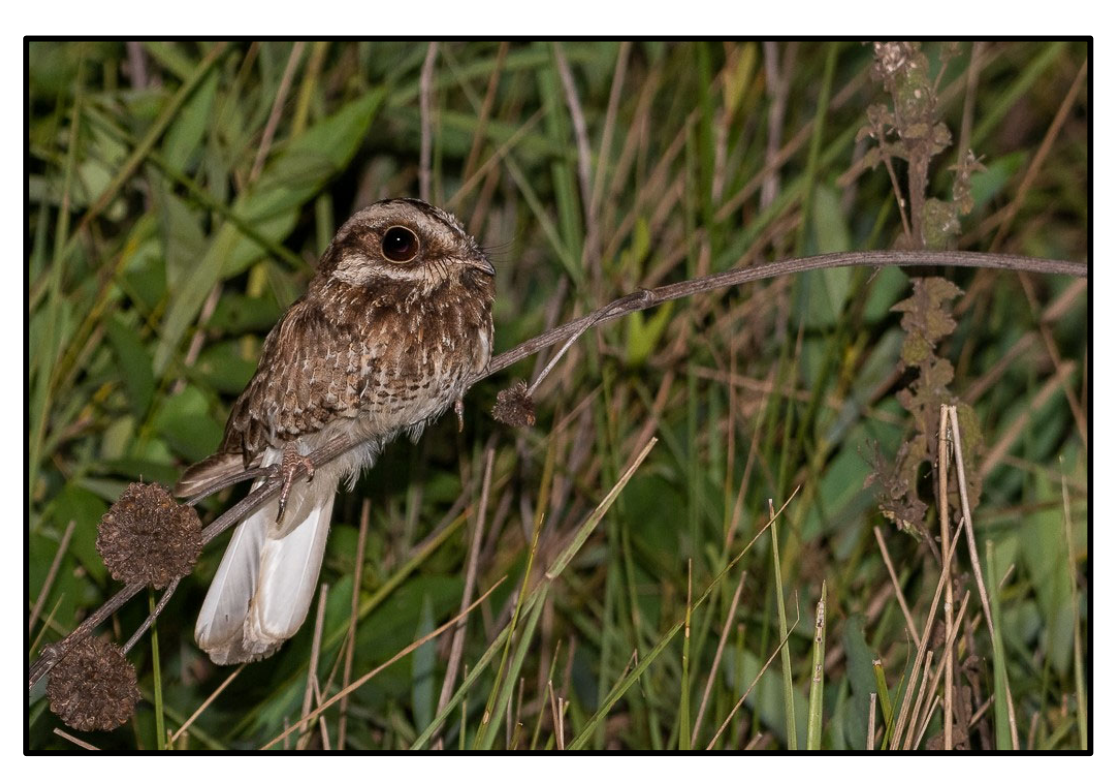
Paraguay is perhaps the best place to see White-winged Nightjar, one of the rarest birds in South America.

Another highlight of this Paraguay birding and wildlife tour will be searching for the rare and Vulnerable (IUCN) White-winged Nightjar, one of the world's rarest members of the Caprimulgidae (nightiar) family.