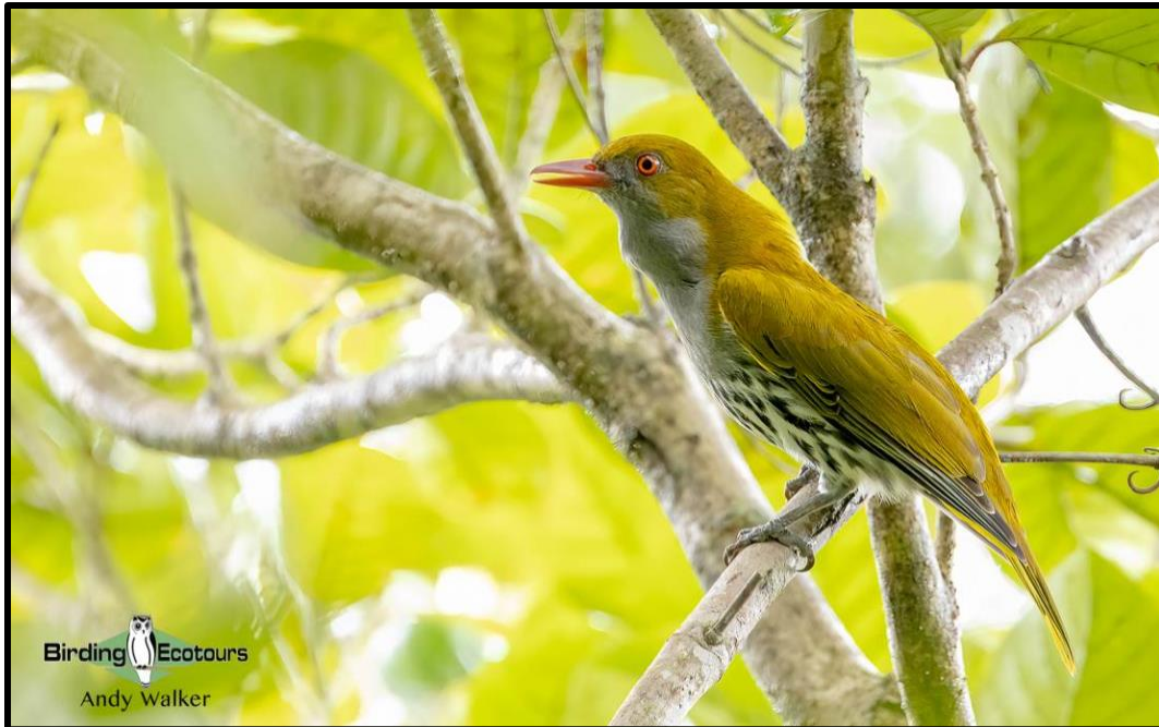
Philippine Oriole can be seen while birding at PICOP on the island of Mindanao.