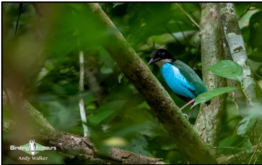
Azure-breasted Pitta is one of several major targets at the world famous PICOP birding area.

In addition to the monarch and broadbill, other top targets will include Philippine Spinetail , Azure-breasted Pitta , Philippine Pitta , Southern Silvery Kingfisher , (Southern) Rufous Hornbill , Writhed Hornbill , Striated Wren-Babbler , and with Mindanao Boobook and Chocolate Boobook both possible after dark, it is sure to be an exciting few days' birding.