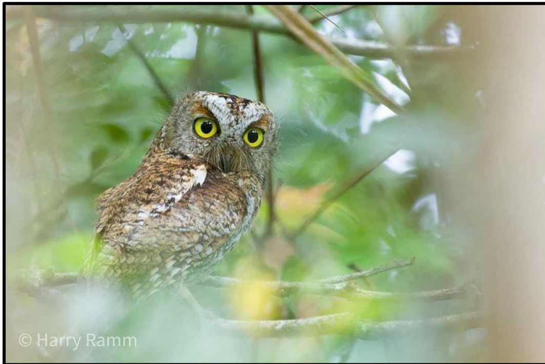
A tough but beautiful bird, we will hope for views of Mindanao Scops Owl during the tour.