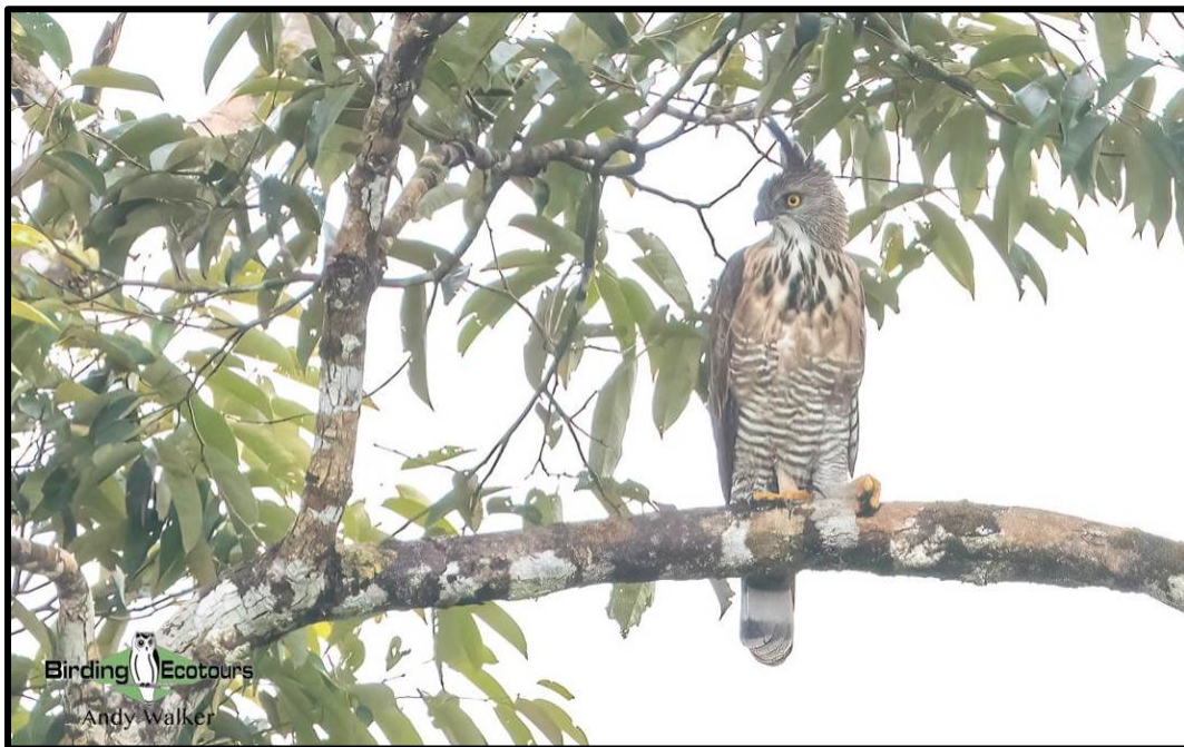
The attractive Pinsker's Hawk-Eagle can be found while birding at PICOP.