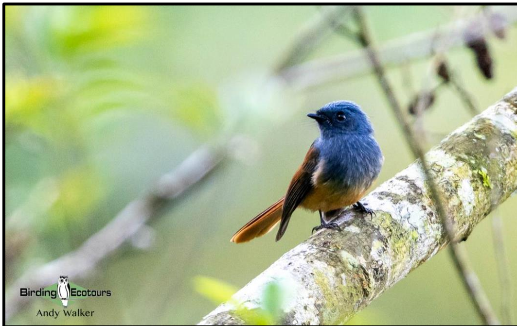
Blue-headed Fantail is a pretty member of mixed species flocks at Infanta Road.