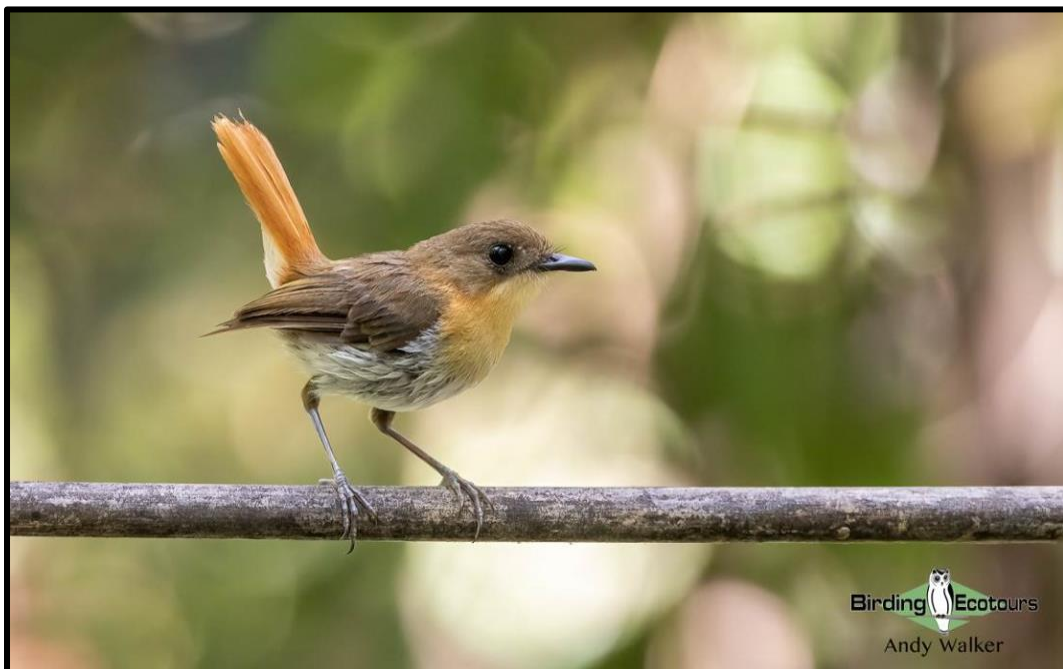
The rare endemic Palawan Flycatcher can be found lurking in the dark undergrowth here.