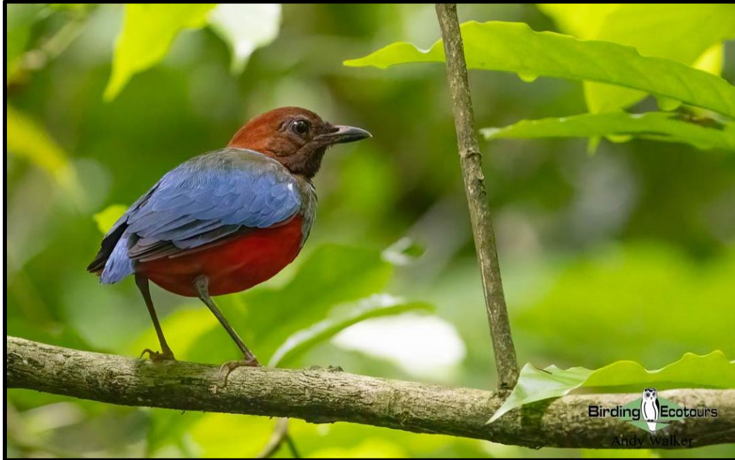
An endemic subspecies of Philippine Pitta can be found while birding on Palawan Island.

Overnight (two further nights): Puerto Princesa, Palawan