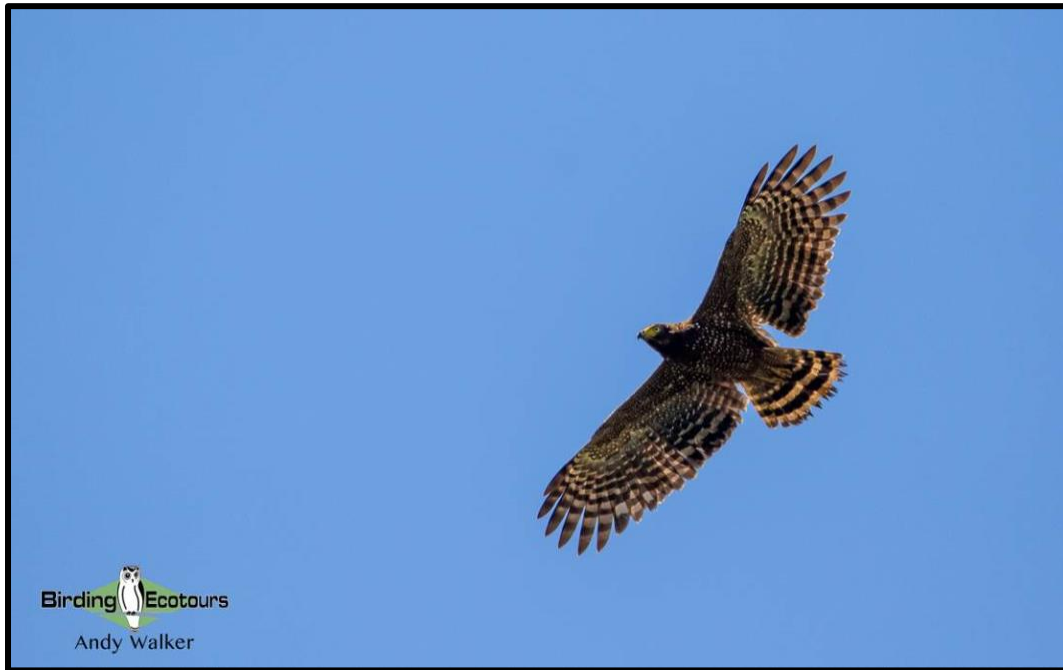
Philippine Serpent Eagle can be found at several locations on the tour.

Fruiting trees in the area may hold a range of trogons, parrots, pigeons, fruit doves, and hornbills, with Philippine Trogon, Pink-bellied Imperial Pigeon, Philippine Green Pigeon, Black-chinned Fruit Dove, Guaiabero (a tiny parrot endemic to the Philippines, belonging to a unique genus), Blue-crowned Racket-tail, Writhed Hornbill, Mindanao (Tarictic) Hornbill, and (Southern) Rufous Hornbill all possible, though with human pressures on the forest, these species are getting more difficult year-on-year.