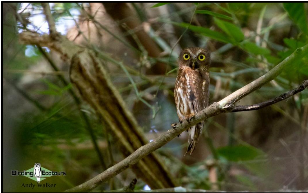
Luzon Boobook is one of many interesting owl targets while birding in the Philippines.

Major tour targets on our Philippine bird tour will include Philippine Eagle (one of the aforementioned Critically Endangered species), Palawan Peacock-Pheasant , Yellow-breasted Fruit Dove , Purple Needletail , Palawan Frogmouth , Philippine Frogmouth , Bukidnon Woodcock , Philippine Eagle-Owl , Giant Scops Owl , Mindanao Scops Owl , Green Racket-tail , Mindanao Hornbill , Luzon Hornbill , Rufous Hornbill , Philippine Trogon , Southern Silvery Kingfisher , Spotted Wood Kingfisher , Blue-capped Kingfisher , (Mindanao) Wattled Broadbill , Azure-breasted Pitta , Philippine Pitta , Celestial Monarch , Mountain Shrike , Apo Myna , Coletto , Ashy Thrush , Lina's Sunbird , Cinnamon Ibon , and many more! We will utilize specialist local guides to make the most of our birding on each island and look forward to a great trip list packed with amazing endemic birds of the Philippines.