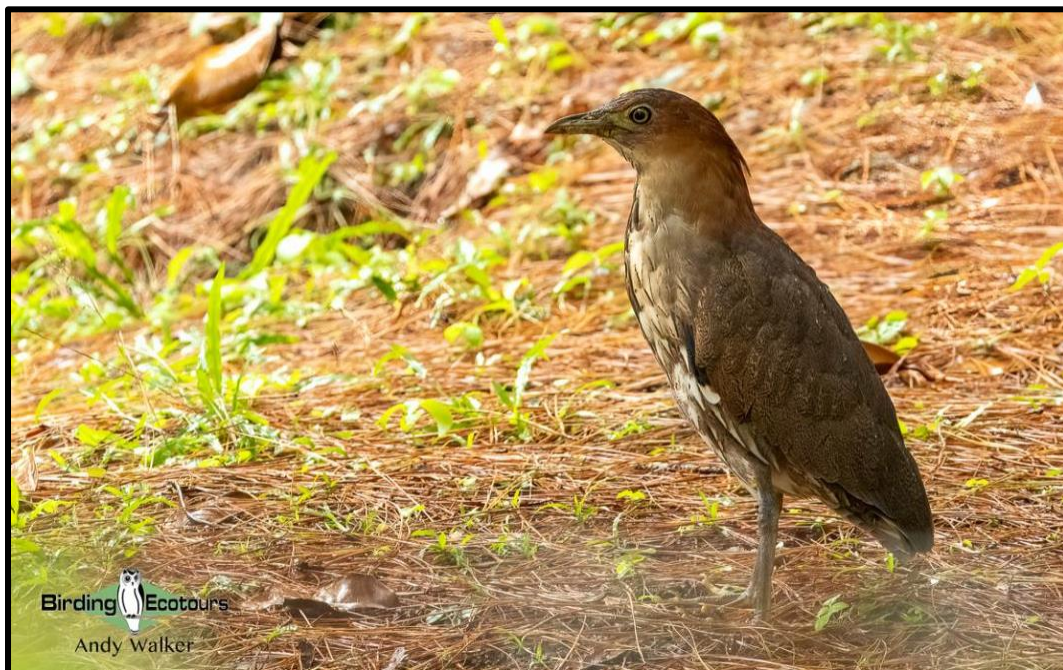
Japanese Night Heron would prove a very big non-endemic highlight on this Philippines birding tour.

Deforestation is a huge issue in the Philippines, and it is a major threat to the survival of many birds, ninety seven species are considered globally threatened by BirdLife International/IUCN . Time is fast running out for many of these unique and wonderful birds and so a visit to the Philippines is recommended sooner rather than later.