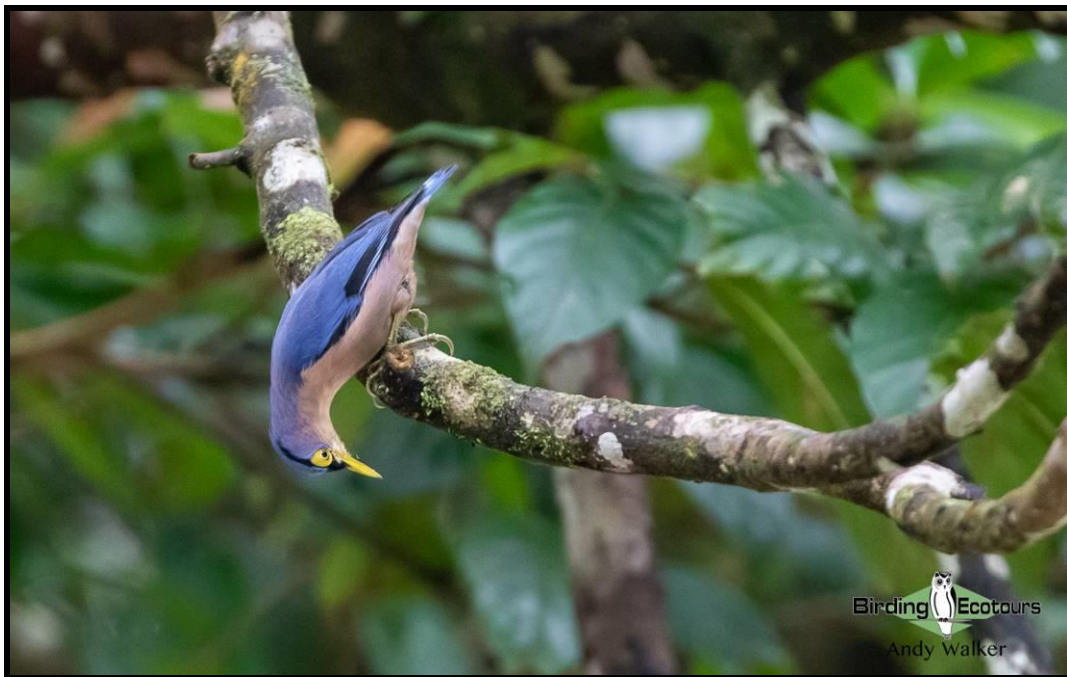
The attractive Sulphur-billed Nuthatch is a common species.

The remnant forest patches in the area can be good for mixed-species feeding flocks which may contain Yellow-bellied Whistler , Black-and-cinnamon Fantail , Negros Leaf Warbler , Sulphur-billed Nuthatch , Turquoise Flycatcher , and the rather odd Cinnamon Ibon – an aberrant sparrow found in Mindanao’s montane forests, previously thought to be a white-eye!