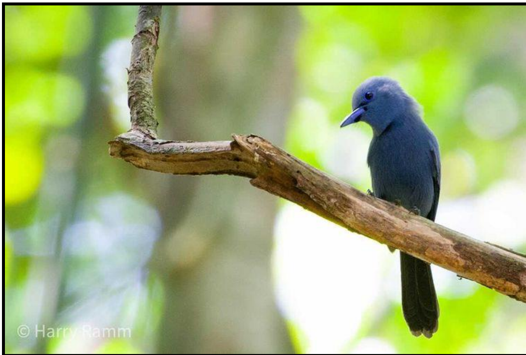
Blue Paradise Flycatcher is a beautiful endemic found on Palawan.

There are numerous great birding sites on Palawan and we will enjoy the majority of these today, as well as over the next three full days, seeking out as many birds as we can. After a morning flight from Manila to Puerto Princesa (the capital of Palawan), we will commence our birding. We will likely visit Iwahig Prison and Penal Farm and a watershed reserve near Puerto Princesa, for our first Palawan endemics, including Palawan Flycatcher , White-vented Shama , and Blue Paradise Flycatcher .