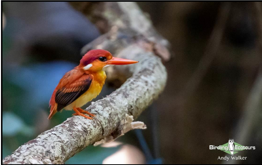
The tiny Rufous-backed Dwarf Kingfisher can be found on Palawan Island.