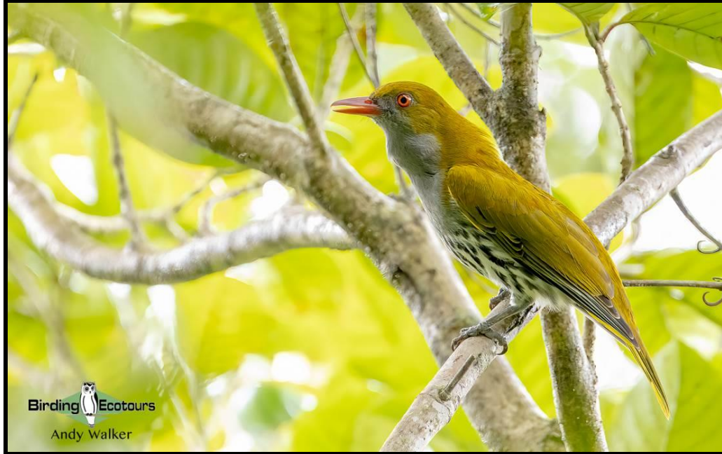
Philippine Oriole can be seen while birding at PICOP.

Overnight (three nights): Bislig, Mindanao