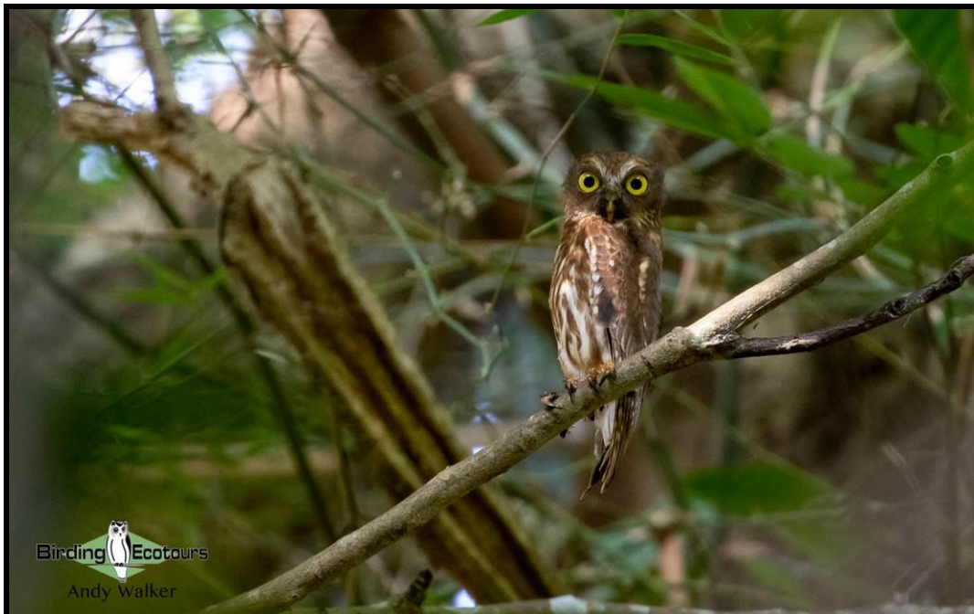
Luzon Boobook is an interesting owl target on the tour.

With the above in mind, our small-group Philippines birding tour focusses on the endemics (and overwintering specials) of the three bird-rich islands of Luzon, Palawan, and Mindanao, with a long list of potential highlights including some of the most highly sought-after birds in the world. Major tour targets will include Philippine Eagle (one of the aforementioned Critically Endangered species), (Mindanao) Wattled Broadbill , Azure-breasted Pitta , Philippine Pitta , Philippine Trogon , Southern Silvery Kingfisher , Spotted Wood Kingfisher , Hombroon's Kingfisher , Celestial Monarch , Philippine Eagle-Owl , Giant Scops Owl , Mindanao Scops Owl , Palawan Frogmouth , Philippine Frogmouth , Green Racket-tail , Yellow-breasted Fruit Dove , Mindanao (Tarictic) Hornbill , Luzon (Tarictic) Hornbill , Rufous Hornbill , Purple Needletail , Bukidnon Woodcock , Coletto , Lina's Sunbird , and many more! We will utilize specialist local guides to make the most of our birding on each island and look forward to a great trip list and showing you the many amazing birds of the Philippines.