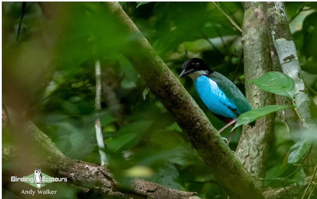
Azure-breasted Pitta is one of several big targets at PICOP

In addition to the monarch and broadbill, other top targets will include Philippine Spinetail , Azure-breasted Pitta , Philippine Pitta , Southern Silvery Kingfisher , Rufous Hornbill , Writhed Hornbill , Striated Wren-Babbler , and with Mindanao Hawk-Owl and Chocolate Boobook after dark, it is sure to be an exciting few days' birding.