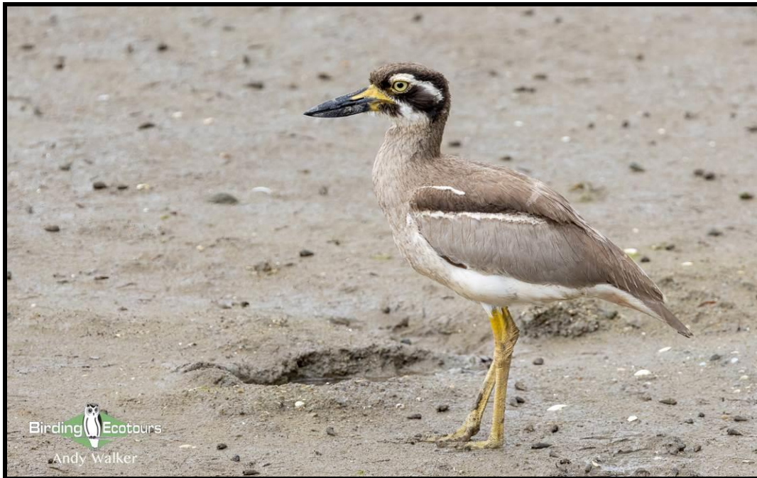
Beach Stone-curlew is always popular, it's an incredible bird.