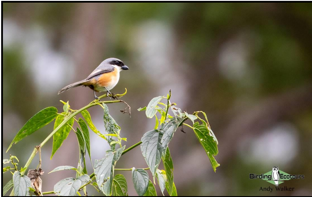
We will look for Mountain Shrike while on Mount Kitanglad.

Overnight (three nights): Mount Kitanglad, Mindanao