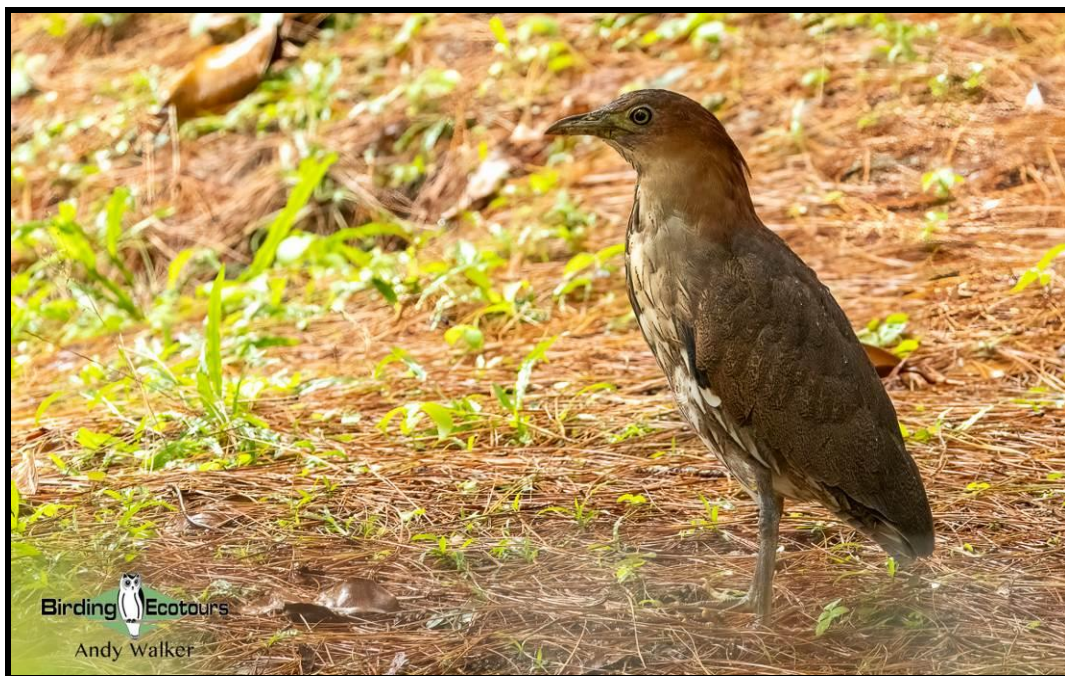
Japanese Night Heron would prove a very big bonus bird on the tour.

Deforestation is a huge issue in the Philippines, and it is a major threat to the survival of many birds, ninety-nine species are considered globally threatened by BirdLife International. Time is fast running out for many of these unique and wonderful birds and so a visit to the country is recommended sooner rather than later.