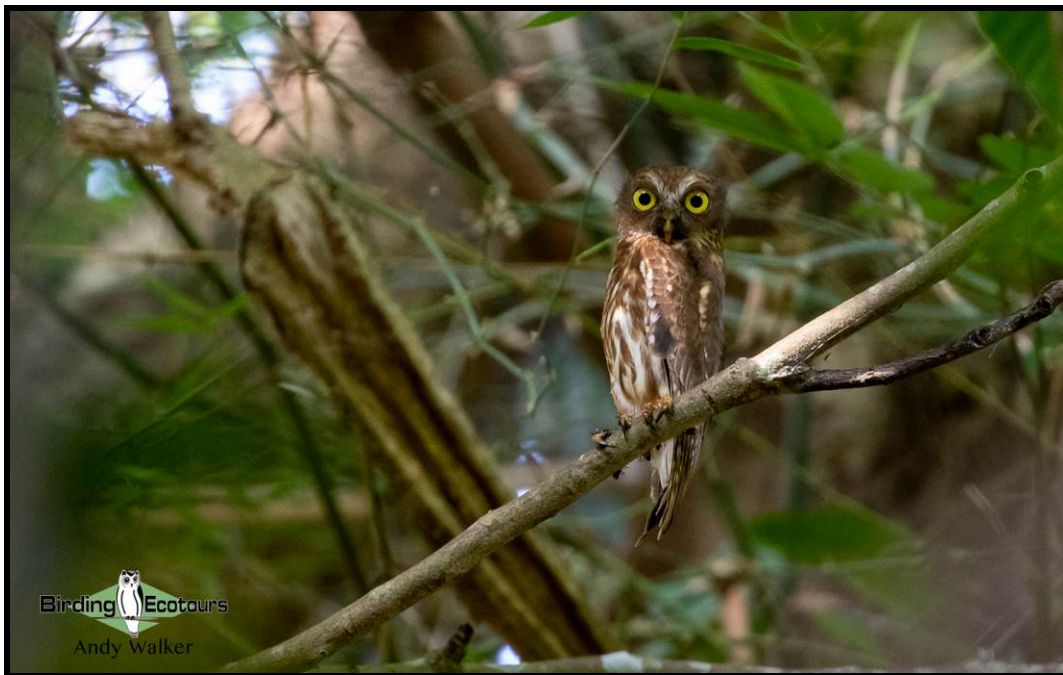
Luzon Boobook is an interesting owl target on the tour.

With the above in mind, our small-group tour focusses on the endemics (and overwintering specials) of the three bird-rich islands of Luzon, Palawan, and Mindanao, with a long list of potential highlights including some of the most highly sought-after birds in the world. Major tour targets will include Philippine Eagle (one of the aforementioned Critically Endangered species), (Mindanao) Wattled Broadbill , Azure-breasted Pitta , Philippine Pitta , Philippine Trogon , Southern Silvery Kingfisher , Spotted Wood Kingfisher , Hombron's Kingfisher , Celestial Monarch , Philippine Eagle-Owl , Giant Scops Owl , Mindanao Scops Owl , Palawan Frogmouth , Philippine Frogmouth , Green Racket-tail , Yellow-breasted Fruit Dove , Mindanao (Tarictic) Hornbill , Luzon (Tarictic) Hornbill , Rufous Hornbill , Purple Needletail , Bukidnon Woodcock , Coletto , Lina's Sunbird , and many more! We will utilize specialist local guides to make the most of our birding on each island and look forward to a great trip list and showing you the many amazing birds of the Philippines.