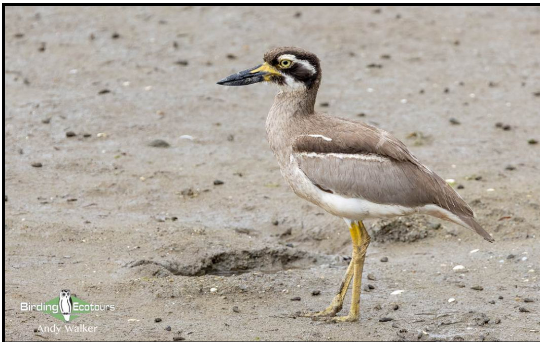
Beach Stone-curlew is always popular, it's an incredible bird.