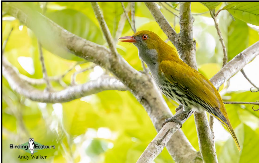
Philippine Oriole can be seen while birding at PICOP.