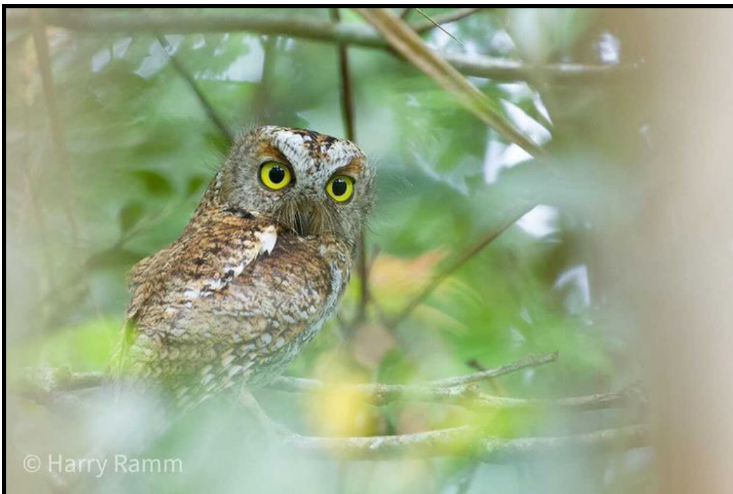
A tough but beautiful bird, we will hope for good views of Mindanao Scops Owl during the tour.