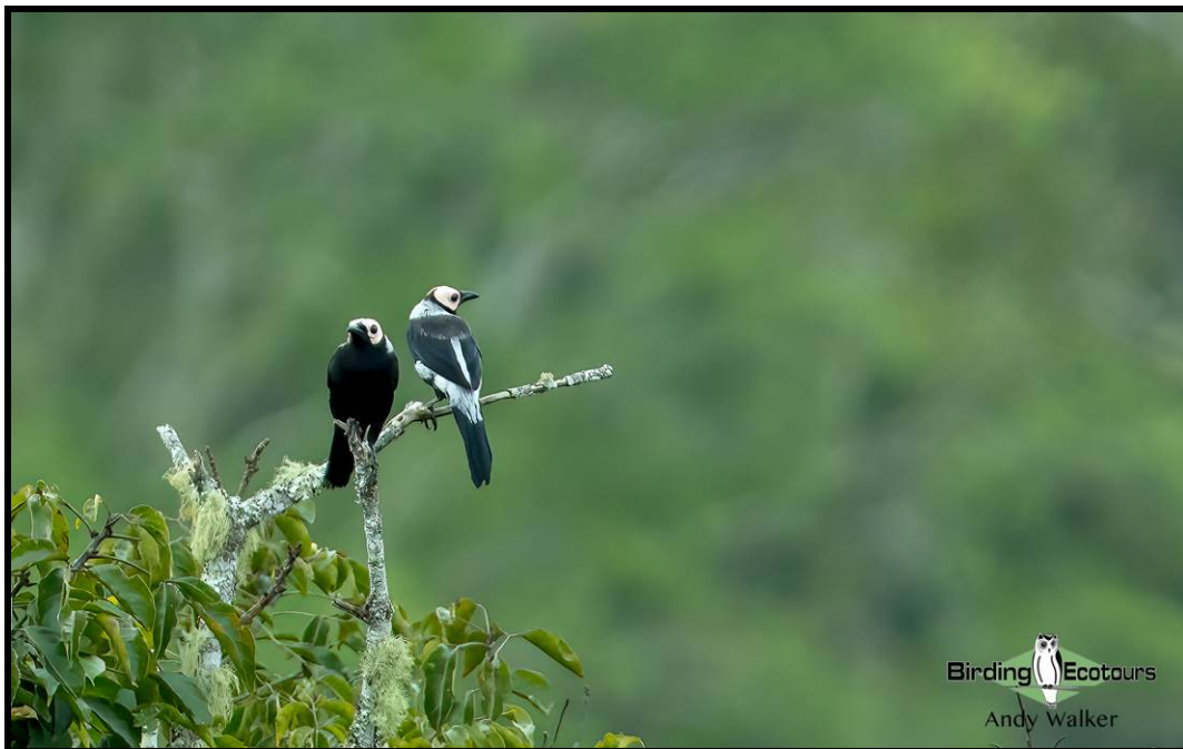
Coletos are part of the Starling family and are endemic to the Philippines.

We will have some time for early morning birding (and hopefully some afternoon birding the previous day) at the resort in search of Cryptic Flycatcher (a localized mid-altitude Mindanao endemic), Whiskered Flowerpecker , and some of the more common endemics like Red-keeled Flowerpecker and Mindanao (Tarictic) Hornbill . Careful study of the mixed-species feeding flocks should give us Brown Tit-Babbler and Orange-tufted Spiderhunter . Here we may also find Southern Silvery Kingfisher , Philippine Coucal , White-eared Brown Dove , Coletos , Philippine Bulbul , Philippine Pied Fantail , Elegant Tit , and Ridgetop Swiftlet . This area is known for overwintering Japanese Night Heron during some recent years, a tough bird to connect with globally, so we will be keeping a keen eye out, should any have been reported.