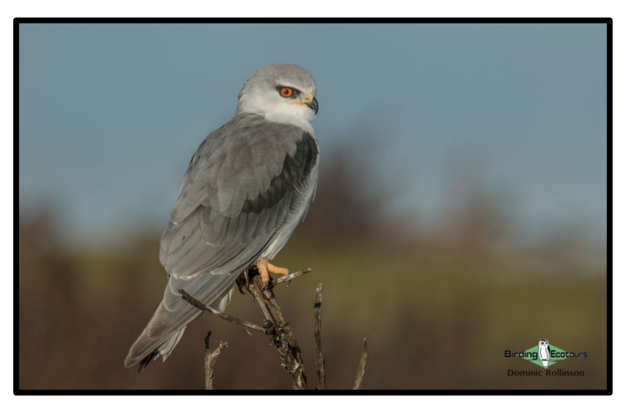
The handsome Black-winged Kite is likely on this Portugal birding tour.

11 – 21 NOVEMBER 2024 10 – 20 NOVEMBER 2025 09 – 19 NOVEMBER 2026