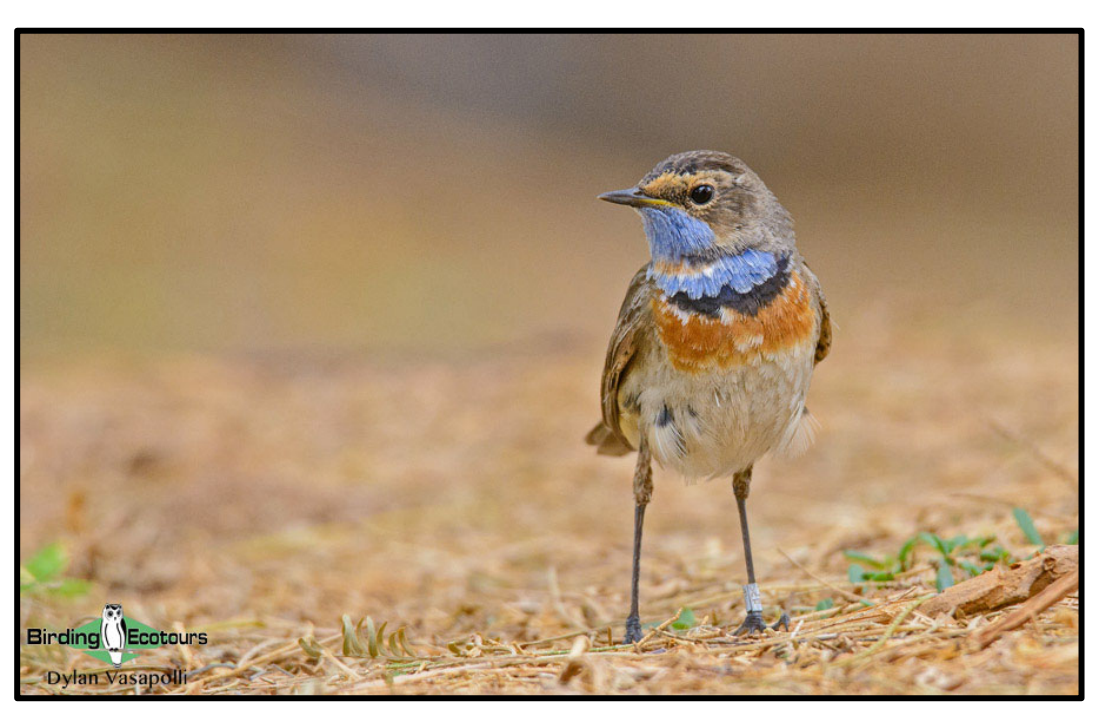
Bluethroat is possible in the central Algarve.

Today we will be birding in the central Algarve, at the bird rich <u>Lagoa dos Salgados</u>. This is another excellent area for relaxed birdwatching and should hold many migrants during our visit, as well as numerous interesting resident species. Species of interest here include Ferruginous Duck, Eurasian Spoonbill, Little Bittern, Black-winged Kite, Mediterranean Gull, Audouin's Gull, Slender-billed Gull, Iberian Magpie, Bluethroat, Eurasian Penduline Tit, and many others.