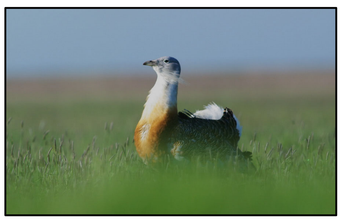
Great Bustard may be seen in the grasslands near the town of Mourão.