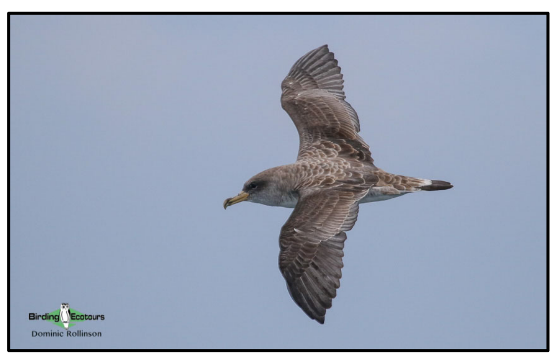
Cory's Shearwater may be seen during this Portugal bird tour.

We will then make the short journey to <u>Cape St Vincent</u>, a beautiful location and excellent for seabirds. Top species like Cory's Shearwater and Great Shearwater can be close to shore and if conditions are favorable, we may even be able to see the Critically Endangered (<u>BirdLife International</u>) Balearic Shearwater . Many migrants can also be found in the scrubby habitat here during the fall, such as Ring Ouzel , Common Blackbird , European Robin , Willow Warbler , Common Chiffchaff , and Eurasian Siskin .