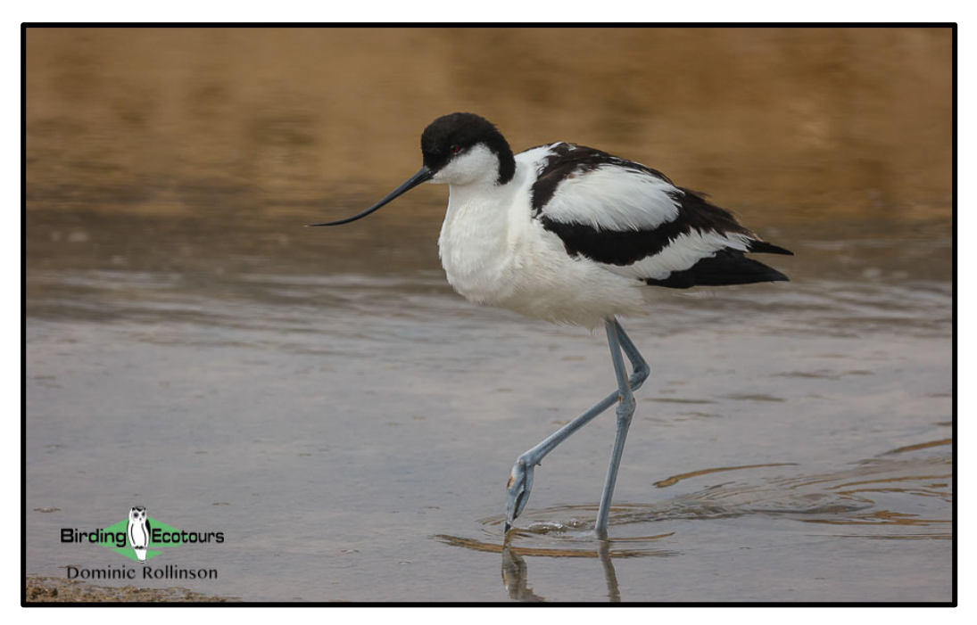
Pied Avocet is one of the shorebirds we might see in the Tagus Estuary.

Marsh Sandpiper, Curlew Sandpiper, Black-winged Kite, Montagu's Harrier, Bonelli's Eagle, Long-eared Owl, White-winged Tern, Savi's Warbler, Dartford Warbler, Iberian Magpie, Calandra Lark, European Stonechat, Eurasian Penduline Tit, Short-toed Treecreeper, Spotless Starling, Common Waxbill, and so much more.