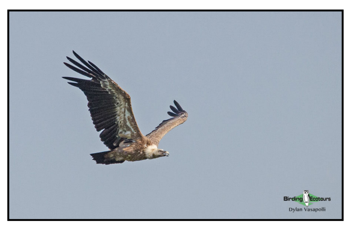
Sagres in Portugal is one of several places on our Portugal birding tour where we can get great views of the giant Griffon Vulture .

We begin our Portugal birding tour in the beautiful city of Porto, from here we will head straight into the picturesque Douro River Valley, east of the city, for our first look at rural Portugal and its wonderful vineyards. While in the area we will enjoy not only vineyards but also beautiful scenery from several viewpoints, and we will also get to grips with mountain birding with species such as Griffon Vulture, Blue Rock Thrush, Iberian Grey Shrike, White-throated Dipper , and Black Wheatear all among some of our first targets.