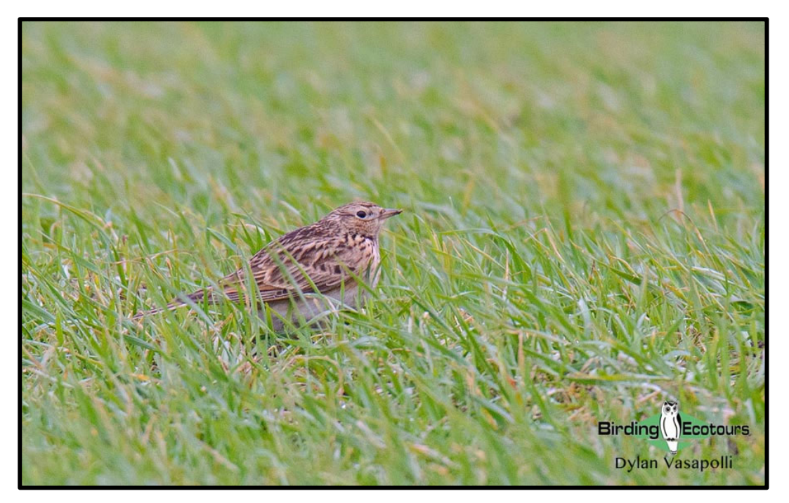
Calandra Lark has a restricted range within Europe however is widespread in southern Portugal and is a target bird during our Portugal birdwatching tour.

Finally, we will head north to the beautiful city of Lisbon. Here we visit the superb Tagus Estuary, a vitally important area for birds in Western Europe. Highlights here include Little Bustard, Savi's Warbler, Calandra Lark, Black-winged Kite, and Bonelli's Eagle, plus tens of thousands of shorebirds (waders) and wildfowl which spend the winter in the estuary. We will also have time to enjoy some of Lisbon's cultural aspects before our tour concludes.