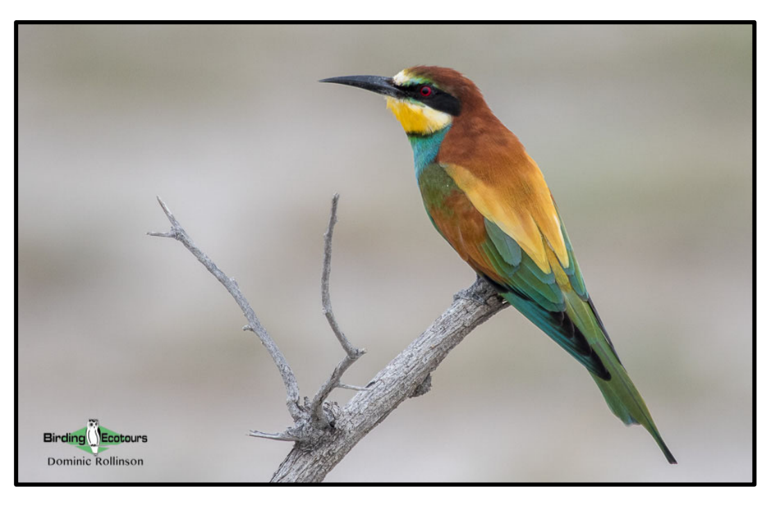
European Bee-eater is always such an uplifting species.

Today we will also take a boat trip around a section of the park to get us closer to the wonderful wetland birds found here, which include Red-crested Pochard , Ferruginous Duck , Eurasian Spoonbill , Little Bittern , Purple Heron , Squacco Heron , Western Swamphen , Audouin's Gull , Slender-billed Gull , Yellow-legged Gull , and many others.