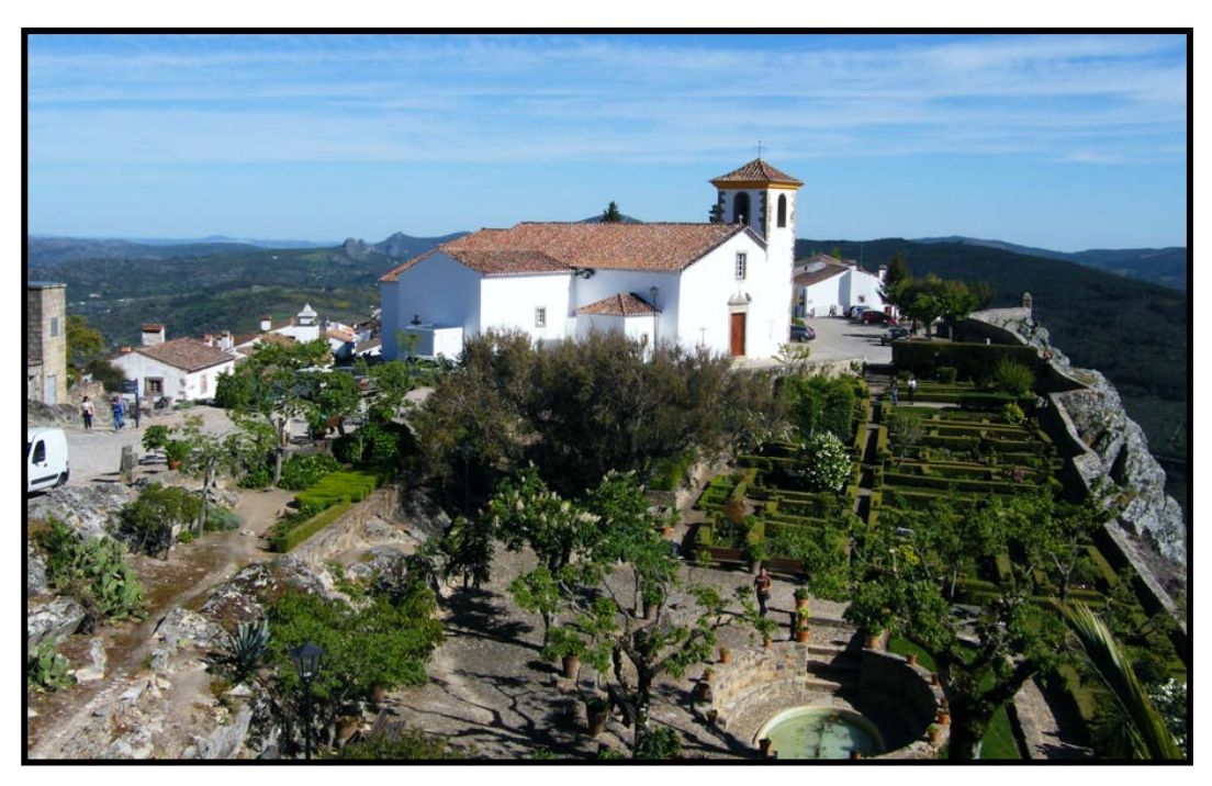
Seeing the ancient town of Marvão will be a cultural highlight of our tour.