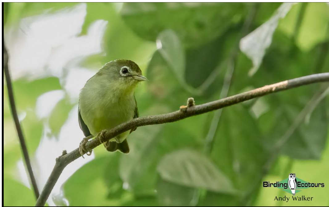
Príncipe White-eye appears to be decreasing for unknown reasons.

We will have two days of birding on Príncipe, these days will be planned based on what we are still trying to see, if required we can have further sessions to look for Príncipe Scops Owl . On one morning we will take a very early boat trip to the south of the island to look for the rare Príncipe Thrush . Whereas on São Tomé the thrush is very easy, this one is the opposite! The area we usually find the thrush can also be good for the increasingly tough Príncipe White-eye , along with Príncipe Starling . We can often find Príncipe (Príncipe) Seed eater , (Príncipe) Blue-breasted Kingfisher , and other species in this area. The sea crossing will likely take us past a small rocky outcrop where we may find White-tailed Tropicbird , Brown Booby , and Western Reef Heron .