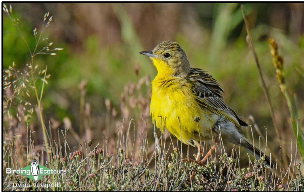
The highly sought-after endemic Yellow-breasted Pipit can be seen around Wakkerstroom!

Overnight: Wetlands Country House & Sheds, Wakkerstroom