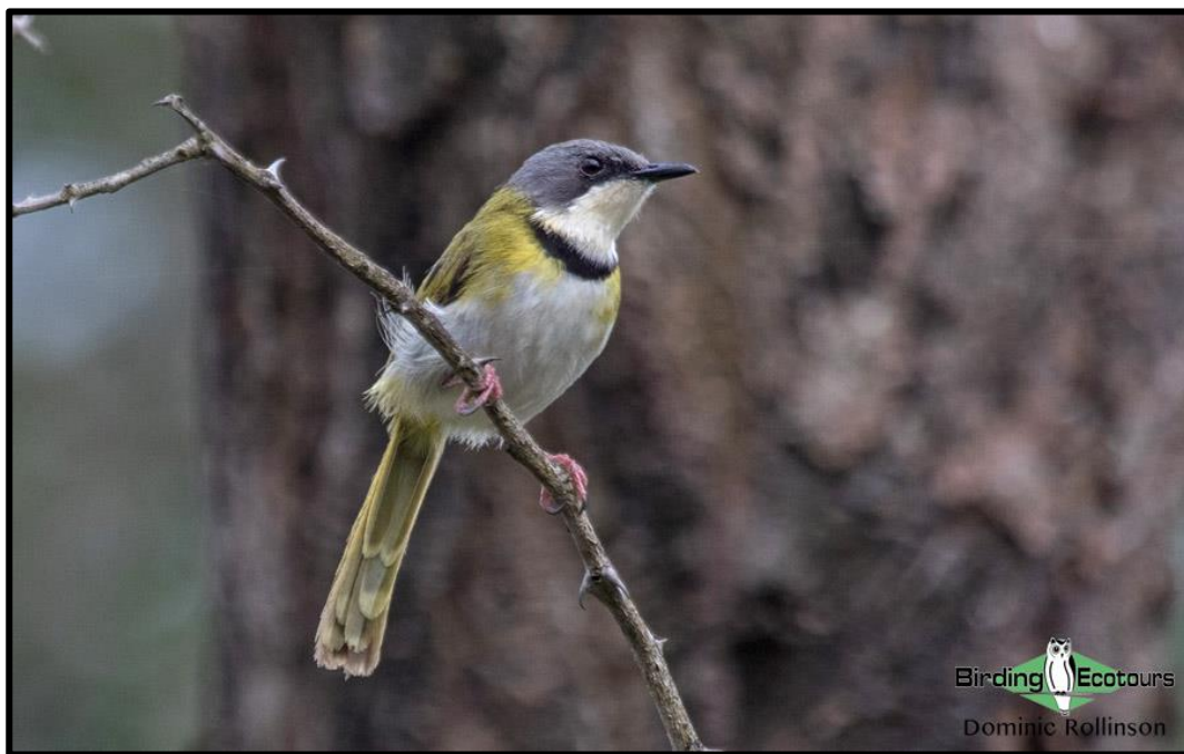
Rudd's Apalis is another Zululand specialty we should get whilst traversing the region!

Overnight: St Lucia Wetlands Guest House, St Lucia