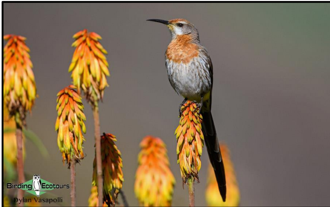
Gurney's Sugarbird is one of many highly sought-after birds occurring in the Drakensberg!