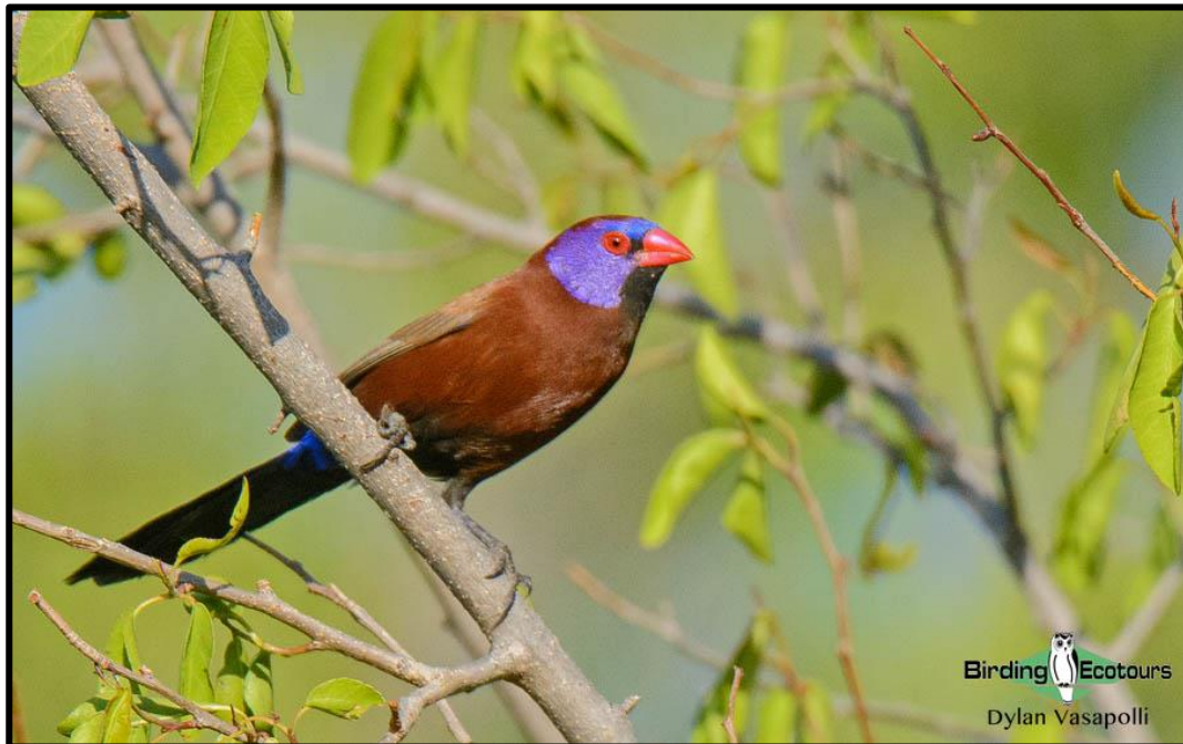
The stunning Violet-eared Waxbill is one of the specials of the Zaagkuilsdrift area!

We will spend the last full day of the tour birding the rich “acacia”-dominated savannas and other habitats of the area. We usually focus our efforts on the superb Zaagkuilsdrift Road, which offers a great transect through this habitat, and puts us in an excellent position to find some of the many more typical Kalahari edge type species that occur here. The road continues on for a while through bird-rich savannah before arriving at a floodplain, which also hosts some excellent species, but birding here is very much dependent on the conditions (usually dry on our October tours). This is another of the country’s premier birding sites, with a huge diversity of birds, and we’re sure to build up an extensive list of species. Some of the Kalahari-type birds we’ll try for include Northern Black Korhaan, Crimson-breasted Shrike, Southern Pied Babbler, Kalahari Scrub Robin, Barred Wren-Warbler, Chestnut-vented Warbler (Tit-babbler), Cape Penduline Tit, Burnt-necked Eremomela, Marico Flycatcher, Violet-eared and Black-faced Waxbills, Great Sparrow, Cut-throat Finch, Scaly-feathered Weaver (Finch), White-browed Sparrow-Weaver, Shaft-tailed Whydah and Yellow Canary. These are just a few of the many birds occurring in the thornveld, and the usually dry (at this time of the year) and open lands around the floodplain can support interesting birds such as Temminck’s Courser and Caspian Plover .