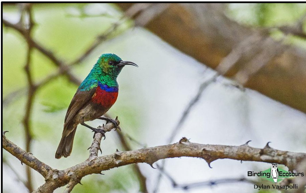
The rare Neergaard's Sunbird is one of the top targets of Mkhuze, and indeed the tour!

excellent birding, supporting a wide array of waterbirds, and depending on the water levels at the time, the pan supports one of the only breeding colonies of Pink-backed Pelicans in South Africa. Other species to be found here include the likes of the sought-after African Pygmy Goose and African Openbill while more regular birds include White-faced Whistling Duck , Black Crake , Water Thick-knee , African Jacana , Whiskered Tern , African Spoonbill , Squacco and Black Herons and Pied Kingfisher . The trees on the edge of the pan support the dazzling Broad-billed Roller , along with an array of woodpeckers, kingfishers, barbets, honeyguides, bushshrikes, flycatchers, robins, sunbirds and weavers. Pel's Fishing Owl do occur in the area, but are nomadic and very rarely seen, and are more reliable on our tour to the Okavango Delta in Botswana/northern Namibia .