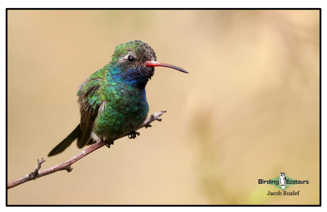
Broad-billed Hummingbird is only one of the many hummingbirds on display.

We begin this tour in the city of Tucson, where we explore the Sonoran Desert via <u>Saguaro</u> <u>National Park</u>, as well as travel up the impressive peak of <u>Mt. Lemmon</u>. In the southeast corner of the state, the Santa Ritas will provide us with our first true taste of birding the <u>Madrean sky islands</u>,