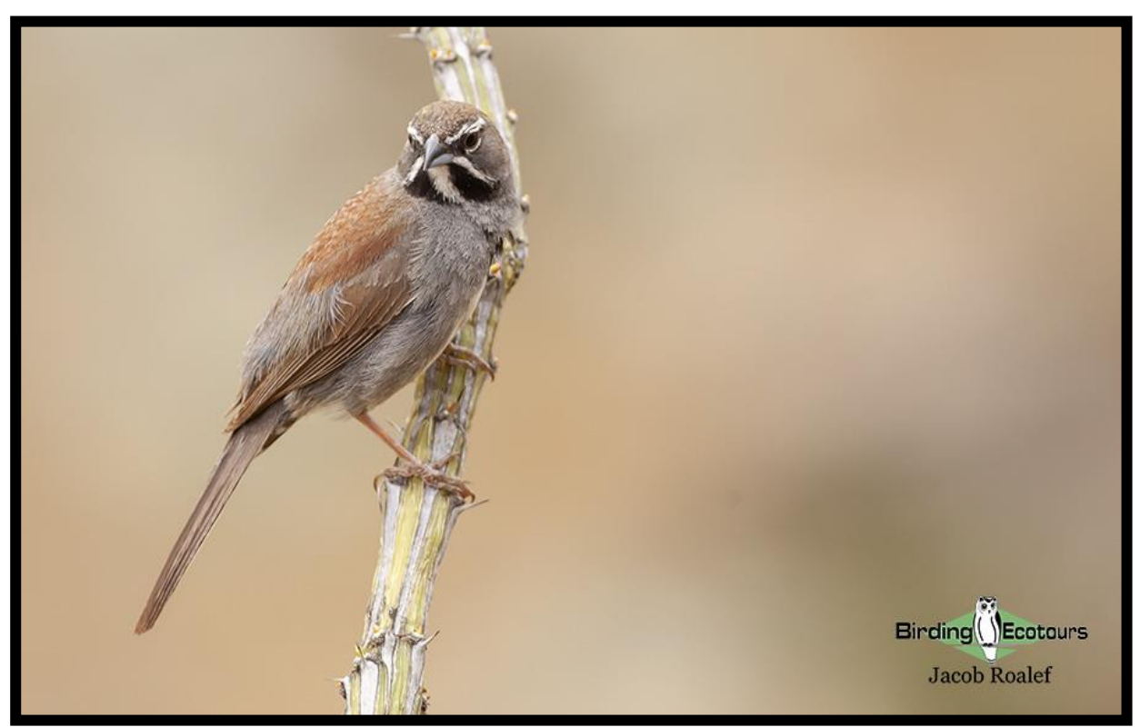
The striking Five-striped Sparrow is one of many specialties of southeast Arizona.