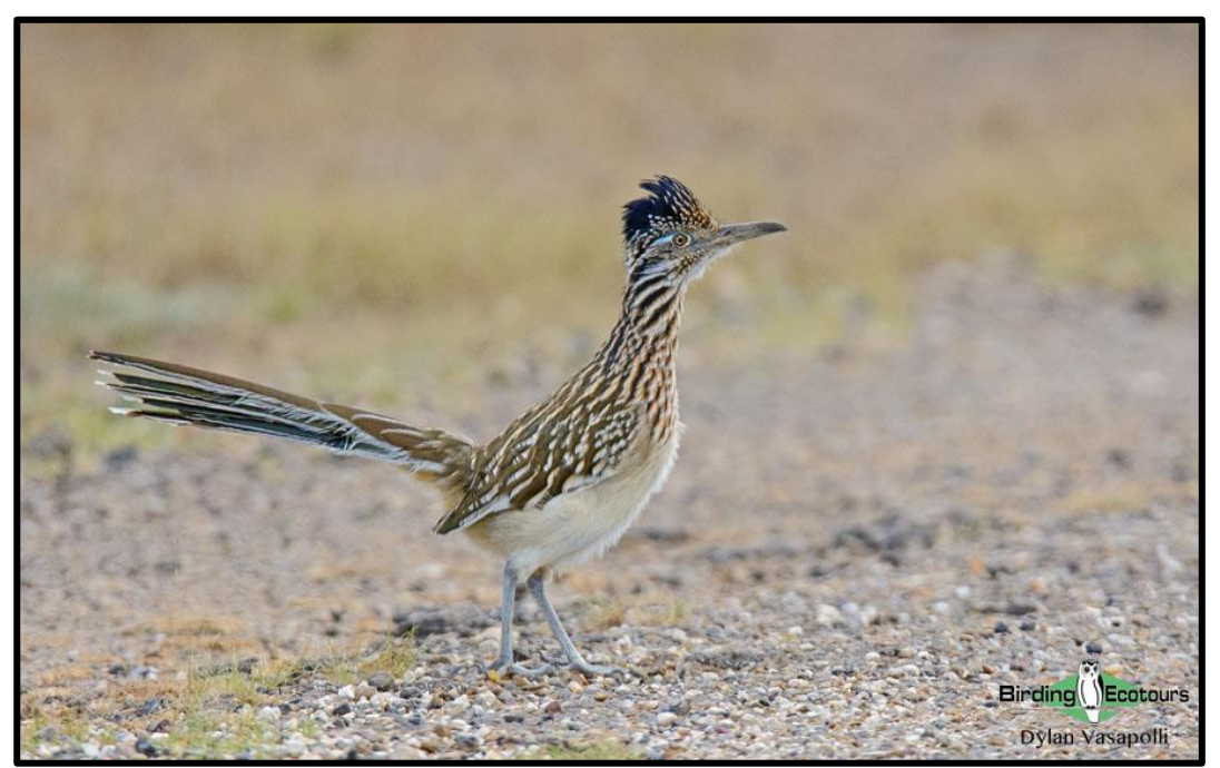
The charismatic Greater Roadrunner!