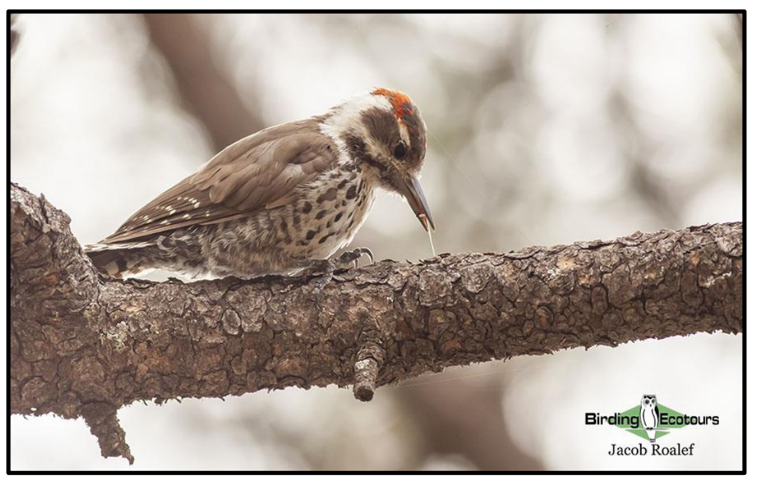
The Arizona Woodpecker is one of the many specialty birds of the region.