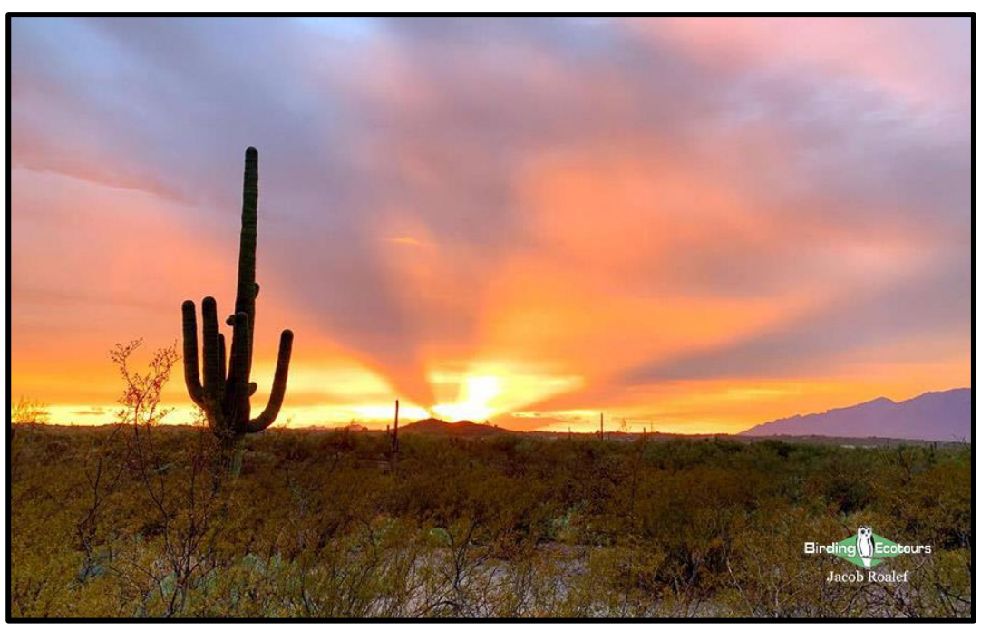
A classic Sonoran Desert sunset, a seemingly every-night occurance.