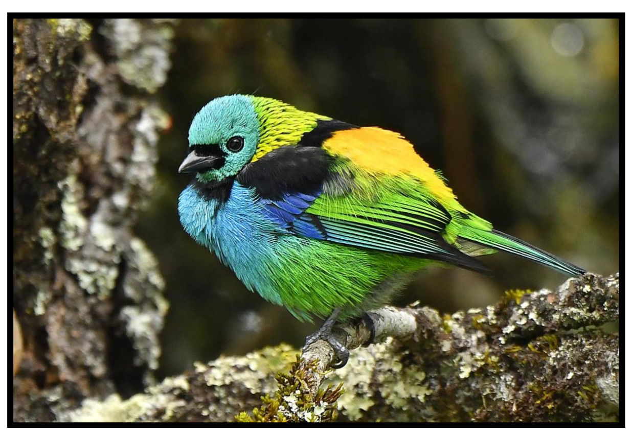
Green-headed Tanager is one of the many tanagers we will target on this tour.

20 SEPTEMBER – 04 OCTOBER 2026 20 SEPTEMBER – 04 OCTOBER 2027