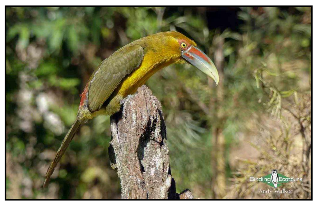
Several toucans and toucanets can be seen on this tour, including Saffron Toucanet.