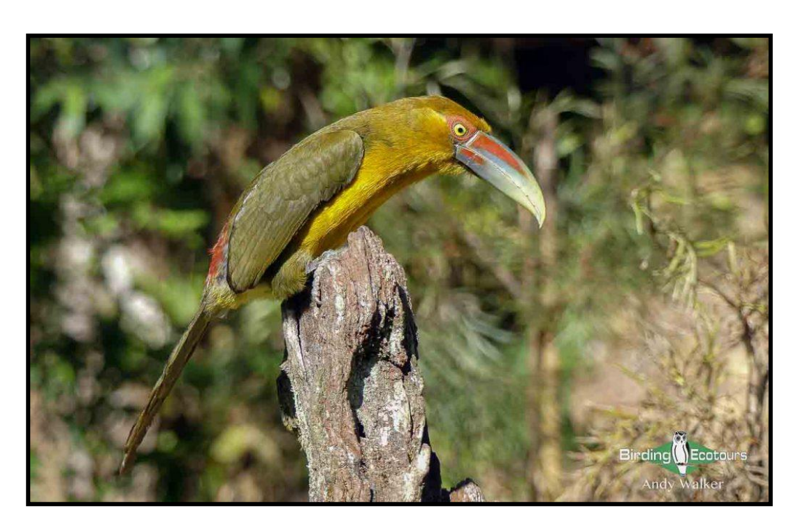
Several toucans and toucanets can be seen on this tour, including Saffron Toucanet.