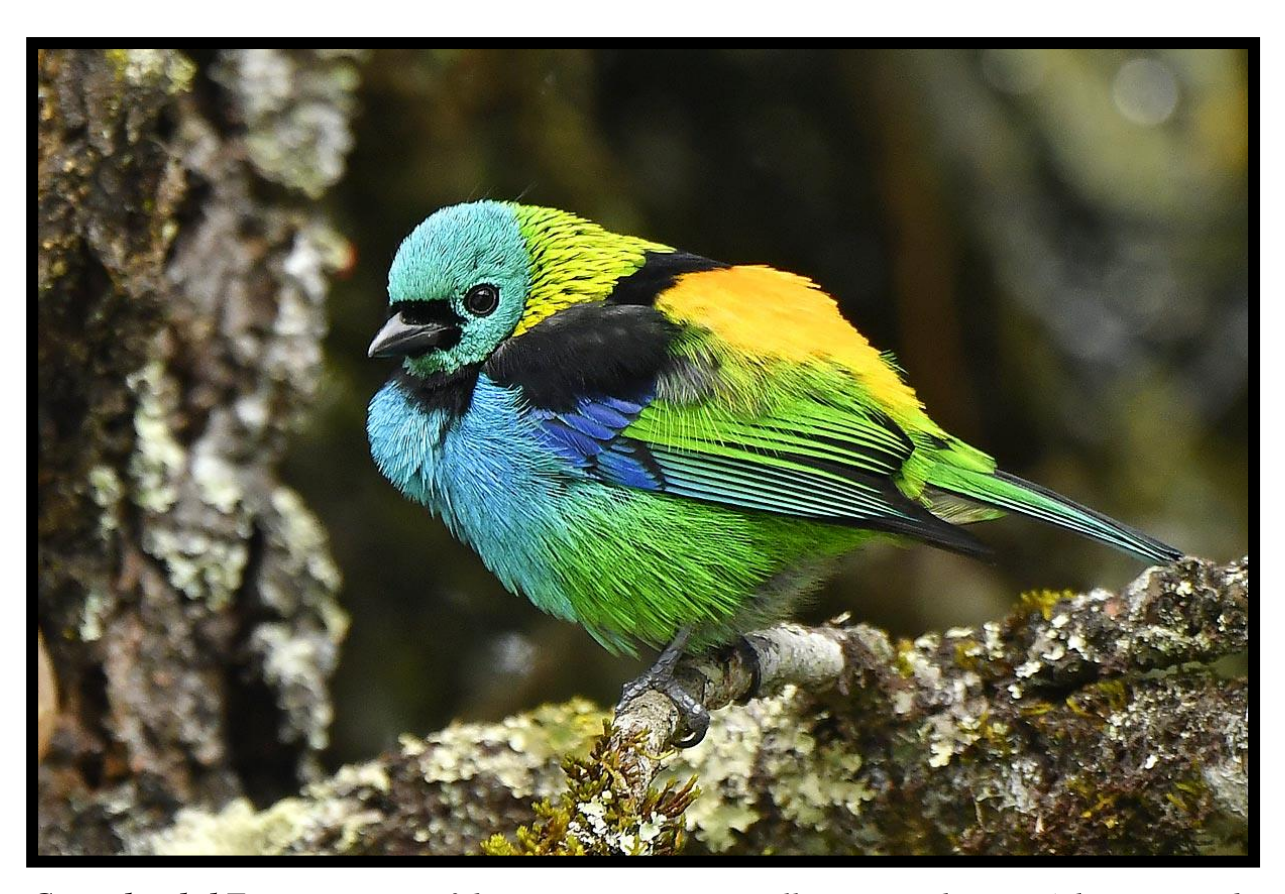
Green-headed Tanager is one of the many tanagers we will target on this tour.