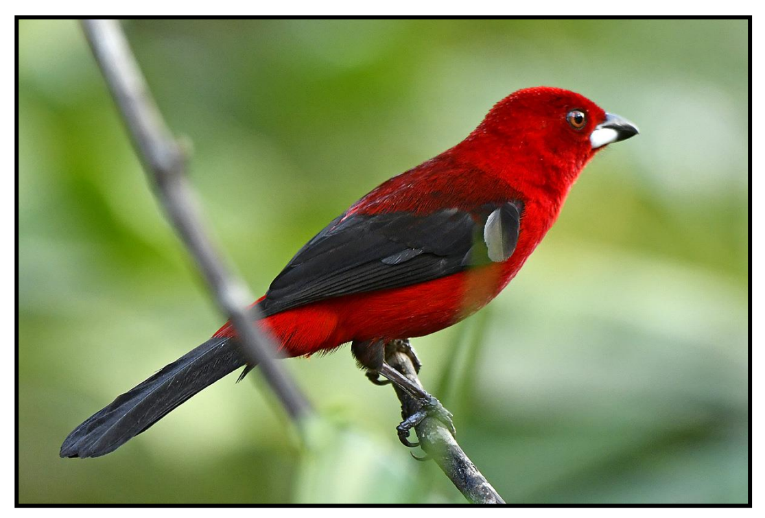
Brazilian Tanager, another outrageously colored tanager that we'll target on this tour.