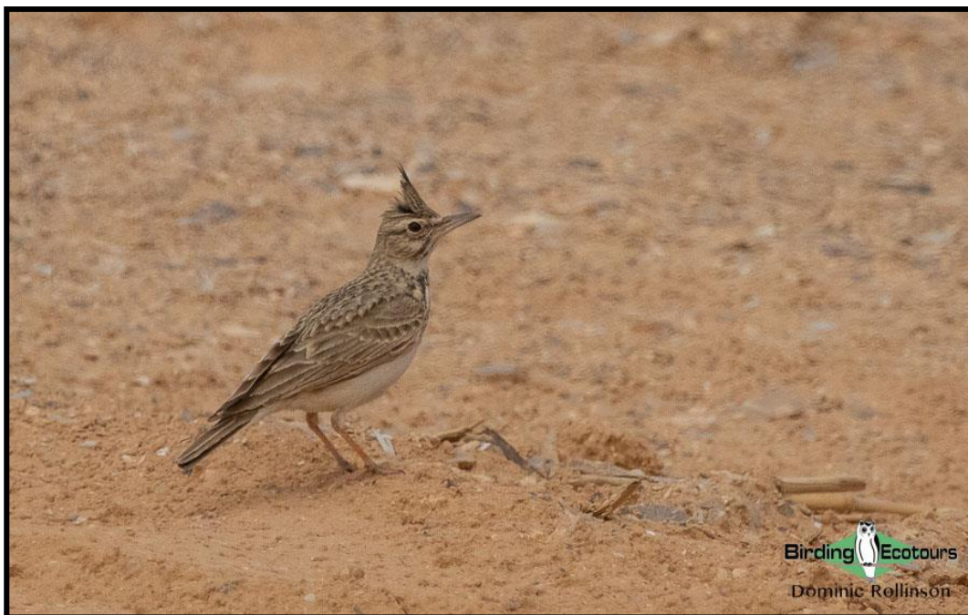
The grazing pastures around Tarifa are an excellent area for Crested Lark .