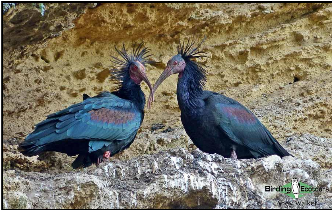
The Northern Bald Ibis is one of the world's rarest birds and a real bonus species for visits to Andalusia. In fall they are found away from their breeding cliffs at the Barbate Marshes.