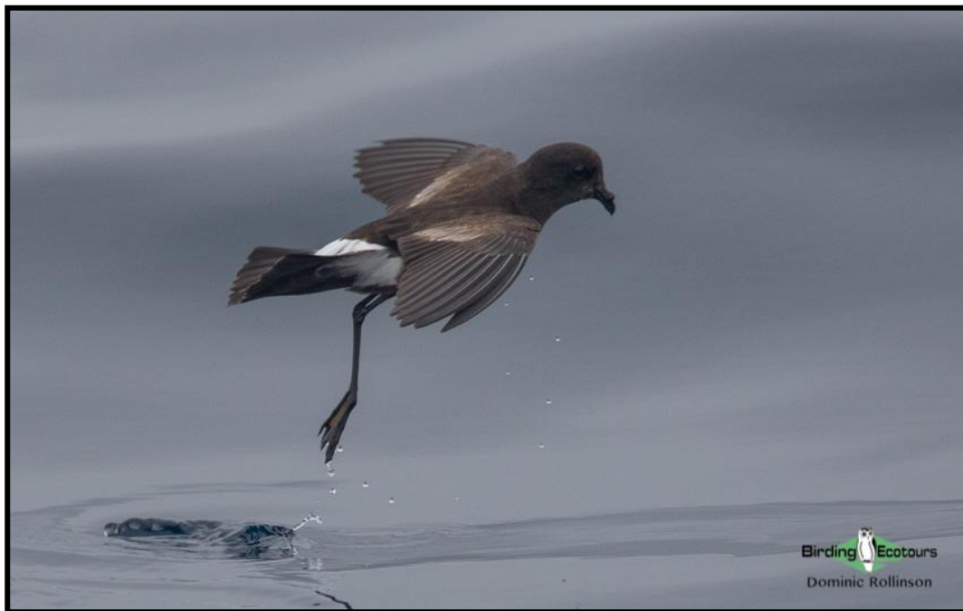
The Bay of Cadiz is an excellent place to look for the rare Wilson's Storm Petrel .