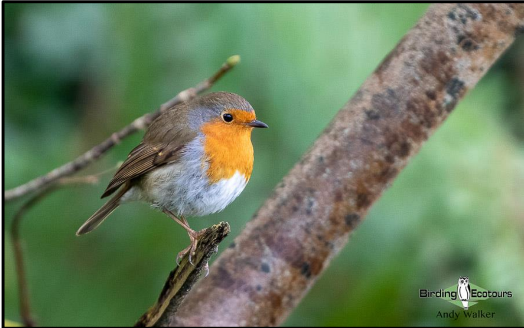
The attractive European Robin is likely to be seen on this tour.