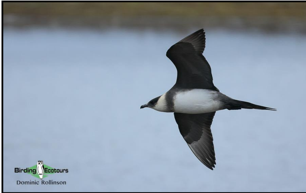
While seawatching we may find the impressive-looking Parasitic Jaeger .

Access to the island is highly restricted, making a visit here an exclusive event. The island is home to a spectacular Yellow-legged Gull colony and seawatching from here will also give us the chance of Scopoli's Shearwater , Balearic Shearwater , Great Skua , Parasitic Jaeger (Arctic Skua), and Northern Gannet . Depending on how the raptor migration is looking we will remain flexible and may head to the migration watchpoints at any point during the morning.