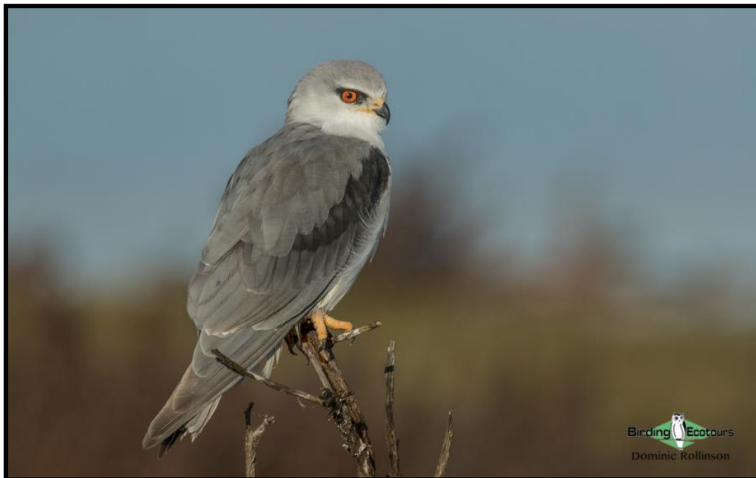
We may see Black-winged Kite while watching migration at the Straits of Gibraltar.

From the beach we will head up into the Straits of Gibraltar proper to witness the spectacle of raptor migration at its best. By keeping in touch with our local raptor counter contacts we will be able to time our visits with the peak movements of raptors as they move through the area. This ploy should allow for excellent views of European Honey Buzzard , Short-toed Snake Eagle , Booted Eagle , Black Kite , Western Marsh Harrier , Montagu's Harrier , Egyptian Vulture , and Eurasian Sparrowhawk . There is also the chance of bonus species such as Black-winged Kite , Lesser Kestrel , Rüppell's Vulture , Cinereous Vulture , Bonelli's Eagle , Spanish Imperial Eagle , Eurasian Hobby , and Eleonora's Falcon , an impressive range of species.