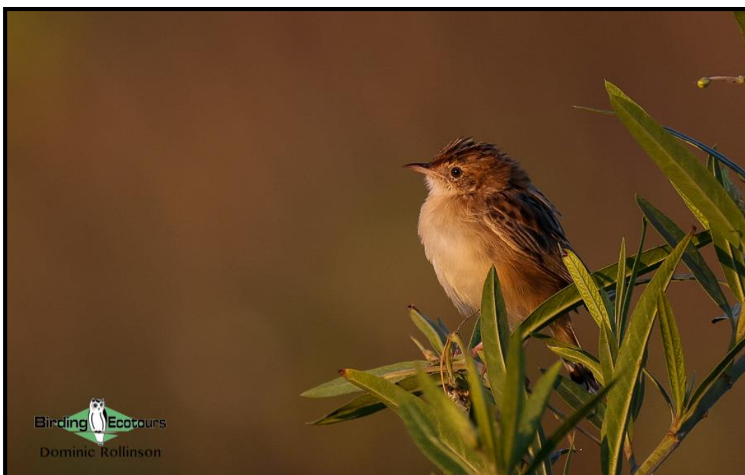
The tiny Zitting Cisticola (sometimes known as Fan-tailed Warbler), is often heard before it is seen, its “zit” call filling the air as the bird takes flight.