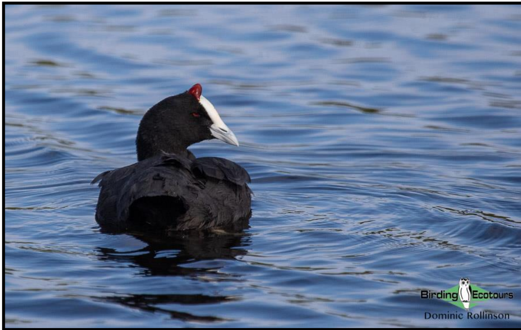
The Guadalquivir area is a stronghold for the Critically Endangered (in Spain), Red-knobbed Coot .