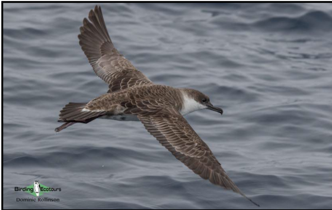
Great Shearwater may be seen on our pelagic trip.

We will begin our tour in the vast wetlands and salt pans on the east bank of the Guadalquivir River. This area is part of the wider Guadalquivir Marshes IBA (an Important Bird Area recognized by BirdLife International) and an enormously productive area. Here we will find a multitude of species, including passerines, egrets, herons, gulls, terns, and around 20 species of shorebirds (waders). While in the area we will look for the colonies of introduced species such as Yellow-crowned Bishop and Black-headed Weaver , and head to Europe's only breeding colony of Little Swift . After exploring this area we will take a pelagic trip from Chipiona town, where we will explore the productive coastline for migrating seabirds including Wilson's Storm Petrel , Great Shearwater , and the Critically Endangered ( BirdLife International ) Balearic Shearwater .