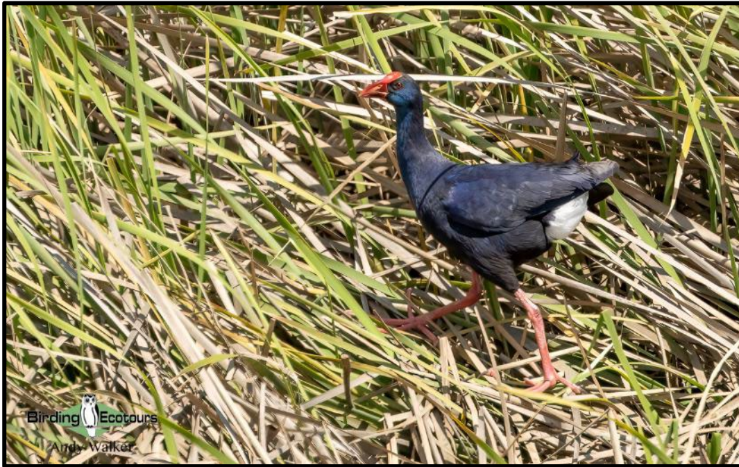
Western Swamphehen is a brute of a bird and is found in the marshland here!

that have established themselves in the area, such as Black-headed Weaver , Yellow-crowned Bishop , Common Waxbill , and Red Avadavat .