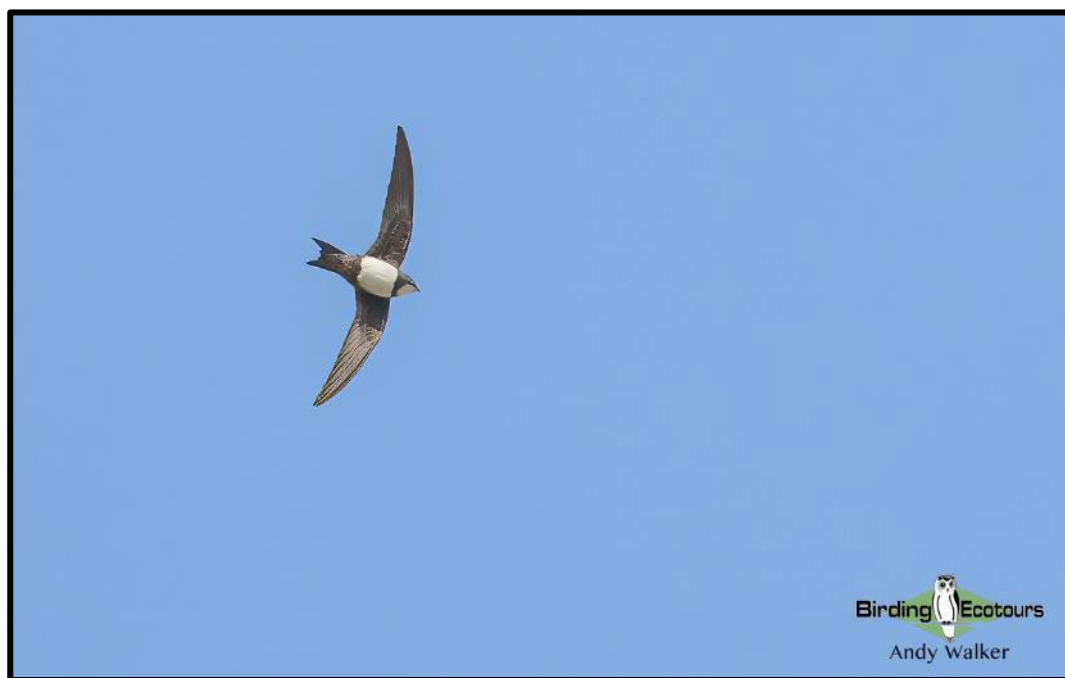
A large and well-marked Alpine Swift cuts a distinctive shape over the skies in Spain.