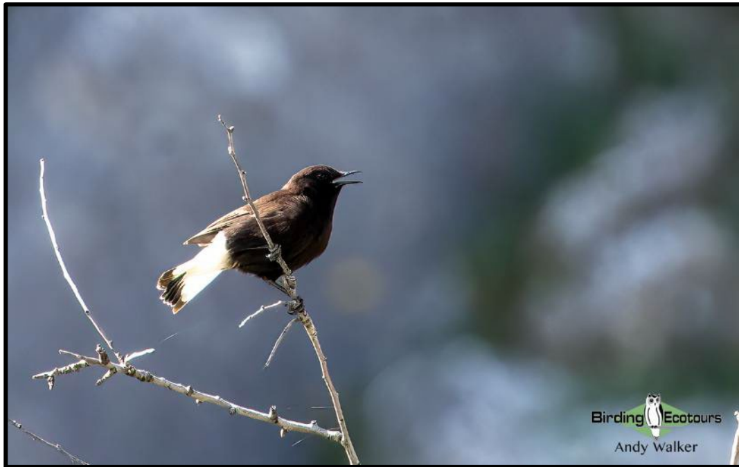
Black Wheatear will be a target as we bird the stunning Llanos de Libar.

Our first stop is the stunning mountain valley of Llanos de Libar . This valley is excellent all year round, with resident species like Griffon Vulture , Bonelli's Eagle , Golden Eagle , Little Owl , Iberian Grey Shrike , Red-billed Cough , Black Wheatear , Black Redstart , Rock Sparrow , and Rock Bunting . There will also be signs of migration here, as passerines move through the valley on their way to the coast and raptors like Black Kite , European Honey Buzzard , and Short-toed Snake Eagle migrate overhead.