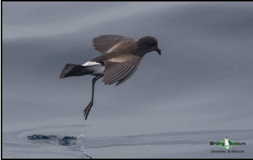
The Bay of Cadiz is an excellent place to look for the rare Wilson's Storm Petrel .