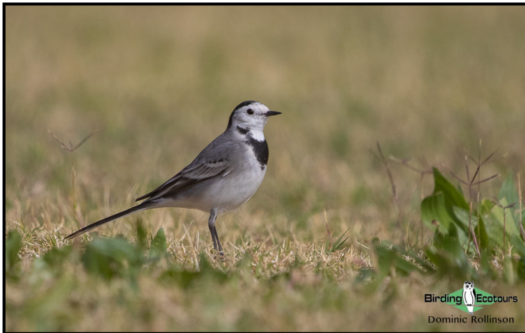
White Wagtail is one of the many migrants will are likely to encounter on this birding tour.

Our first stop is the stunning mountain valley of Llanos de Libar . This valley is excellent all year round, with resident species like Black Wheatear , Rock Bunting , Rock Sparrow , Black Redstart , Iberian Grey Shrike , Little Owl , Red-billed Chough , Griffon Vulture , Bonelli's Eagle , and Golden Eagle . There will also be signs of migration here as passerines move through the valley on their way to the coast and raptors like Black Kite , European Honey Buzzard , and Short-toed Snake Eagle migrate overhead.