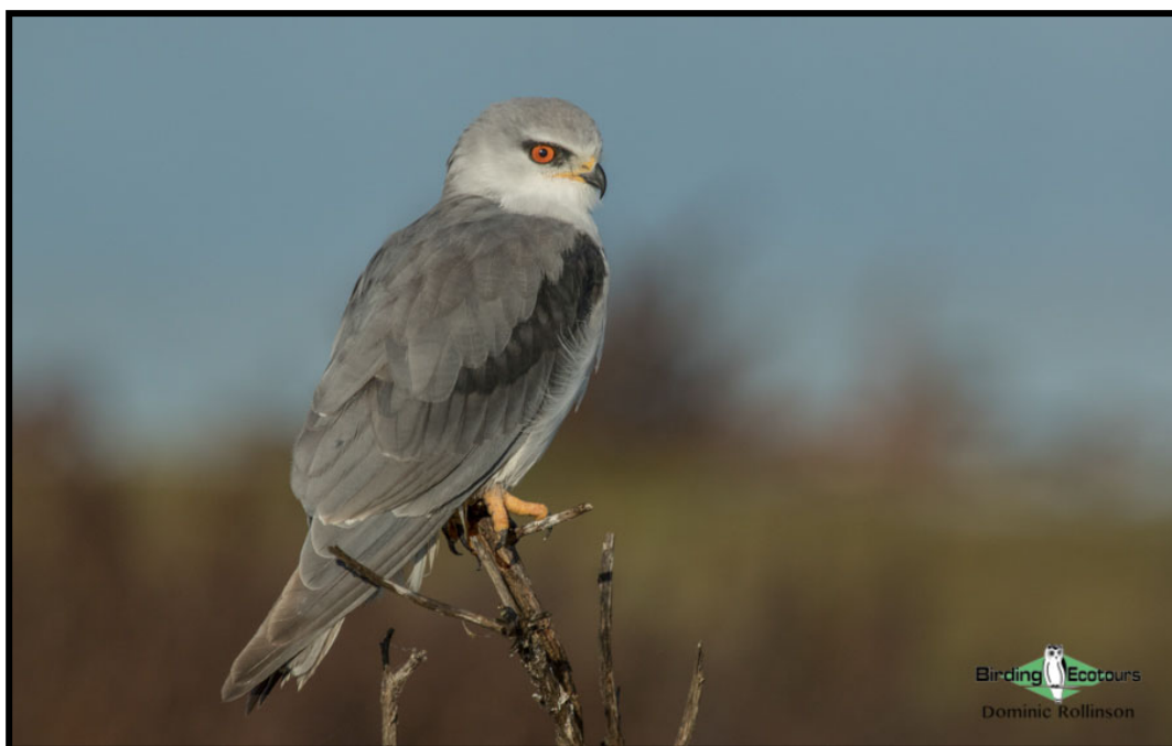
We may see Black-winged Kite while watching migration at the Straits of Gibraltar.

From the beach we will head up into the Straits of Gibraltar proper to witness the spectacle of raptor migration at its best. By keeping in touch with our local raptor counter contacts we will be able to time our visits with the peak movements of raptors as they move through the area. This ploy should allow for excellent views of European Honey Buzzard , Short-toed Snake Eagle , Booted Eagle , Black Kite , Western Marsh Harrier , Montagu's Harrier , Egyptian Vulture , and Eurasian Sparrowhawk . There is also the chance of bonus species such as Black-winged Kite , Lesser Kestrel , Rüppell's Vulture , Cinereous Vulture , Bonelli's Eagle , Spanish Imperial Eagle , Eurasian Hobby , and Eleonora's Falcon , an impressive range of species.