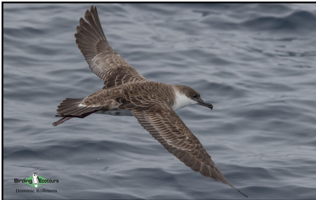
Great Shearwater may be seen on our pelagic trip.

We will begin our tour in the vast wetlands and salt pans on the east bank of the Guadalquivir River. This area is part of the wider Guadalquivir Marshes IBA (an Important Bird Area recognized by BirdLife International) and an enormously productive area. Here we will find a multitude of species, including multiple passerines, egrets, herons, gulls, terns, and around 20 species of shorebirds (waders). While in the area we will look for the colonies of introduced species such as Yellow-crowned Bishop and Black-headed Weaver , and head to Europe's only breeding colony of Little Swift . After exploring this area, we will take a pelagic trip from Chipiona town where we will explore the productive coastline for migrating seabirds including Wilson's Storm Petrel , Great Shearwater , and the Critically Endangered ( BirdLife International ) Balearic Shearwater .