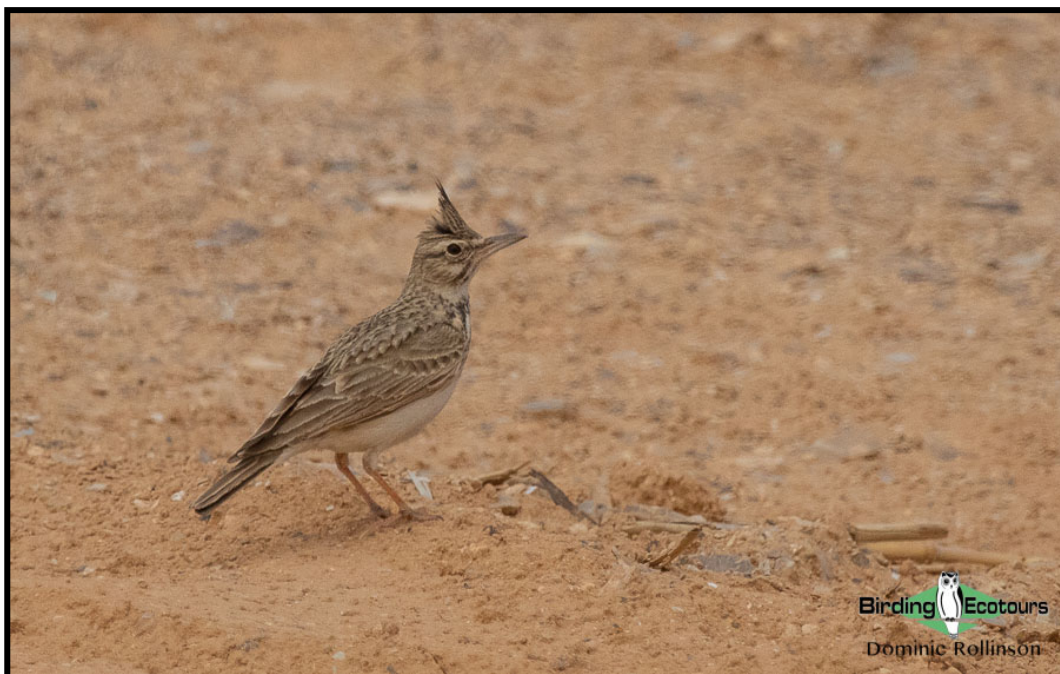
The grazing pastures around Tarifa are an excellent area for Crested Lark .