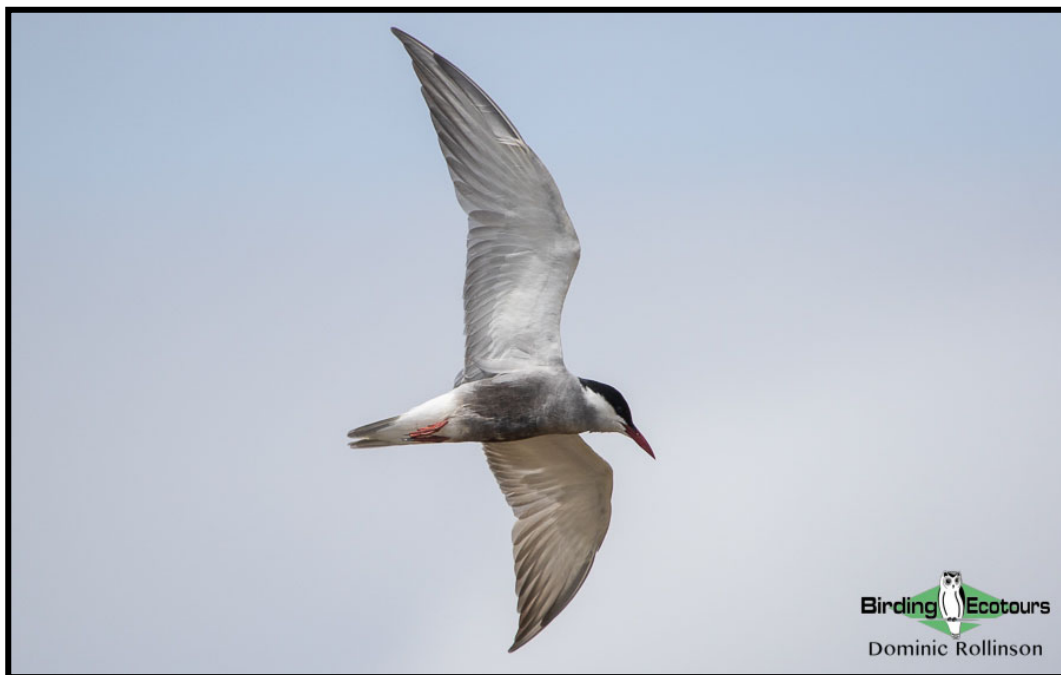
The wetlands here are home to Whiskered Terns .

The protected area of Brazo del Este , near the city of Seville, is a superb habitat for shorebirds and waterbirds, with large numbers of Northern Lapwing , Pied Avocet , Mallard and Northern Shoveler gathering here in fall. The area is also superb for passerines such as Eurasian Penduline Tit , Savi's Warbler , and Great Reed Warbler . We also stand a chance of adding some elusive crakes to our list with Spotted Crake , Little Crake , and Baillon's Crake all present here.