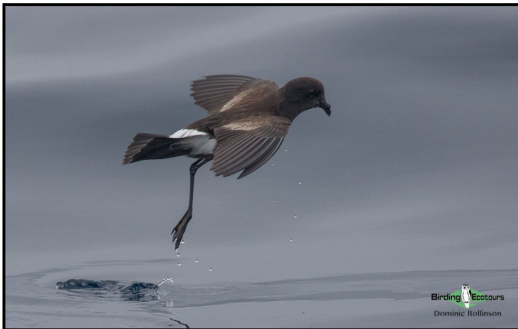
The Bay of Cadiz is an excellent place to look for the rare Wilson's Storm Petrel .