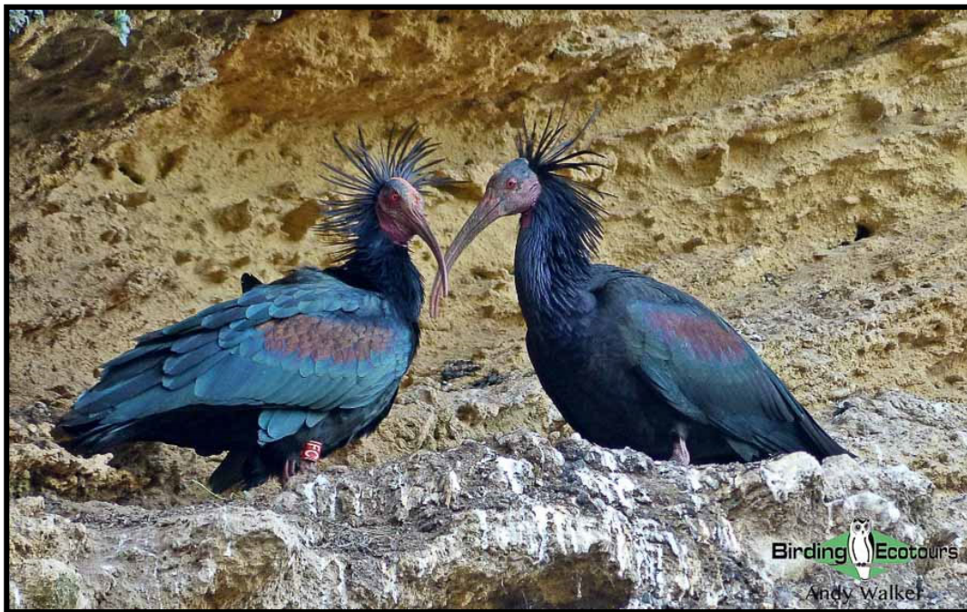
The Northern Bald Ibis is one of the world's rarest birds and a real bonus species for visits to Andalusia. In fall they are found away from their breeding cliffs at the Barbate Marshes.