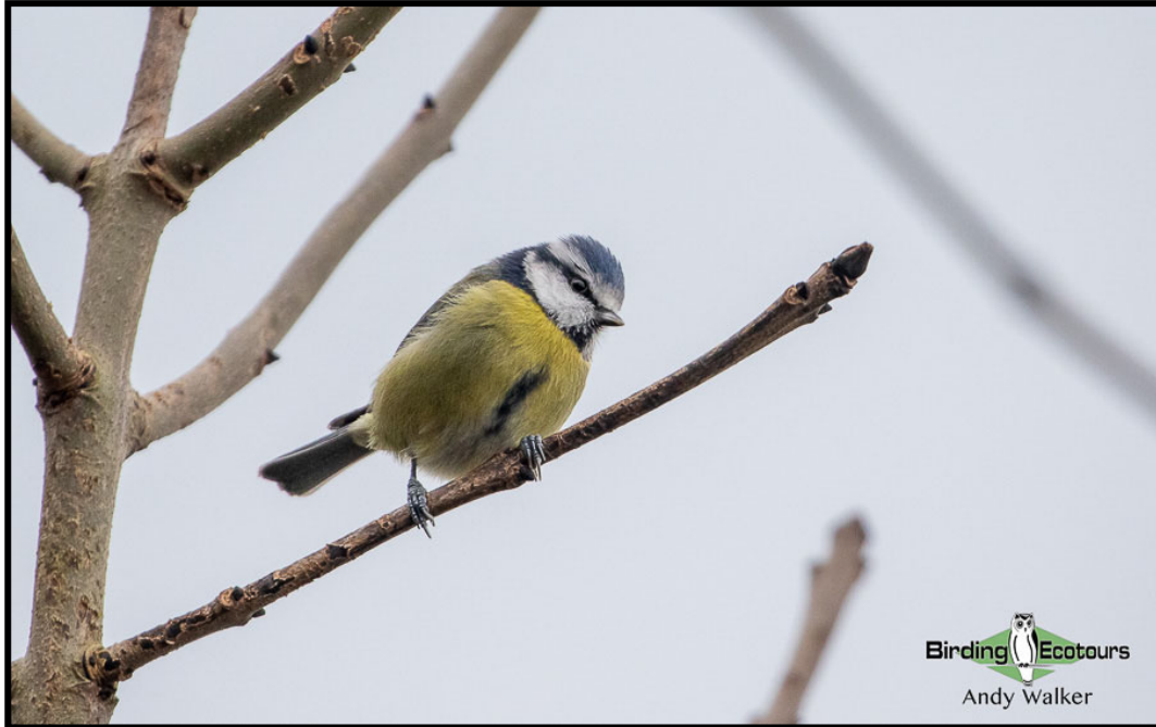
The really cute and tiny Eurasian Blue Tit can be seen around Tarifa.

The forest is also popular with migrant passerines and our visit here is well timed to find Spotted Flycatcher , European Pied Flycatcher , Tawny Pipit , Common Redstart , Eurasian Blackcap , Woodchat Shrike , and Western Black-eared Wheatear . We will also visit the Barbate reservoir which has become a stronghold for White-rumped Swift . This African species is a recent colonist in Europe and still incredibly scarce. After lunch we will head to the Straits of Gibraltar for one last look at the raptor migration.