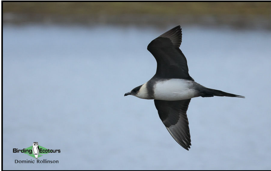
While seawatching we may find the impressive-looking Parasitic Jaeger .

Access to the island is highly restricted, making a visit here an exclusive event. The island is home to a spectacular Yellow-legged Gull colony and seawatching from here will also give us the chance of Scopoli's Shearwater , Balearic Shearwater , Great Skua , Parasitic Jaeger (Arctic Skua), and Northern Gannet . Depending on how the raptor migration is looking we will remain flexible and may head to the migration watchpoints at any point during the morning.