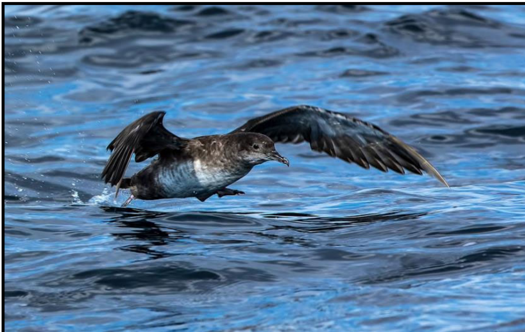
Our pelagic trip will give us excellent views of seabirds like Balearic Shearwater.