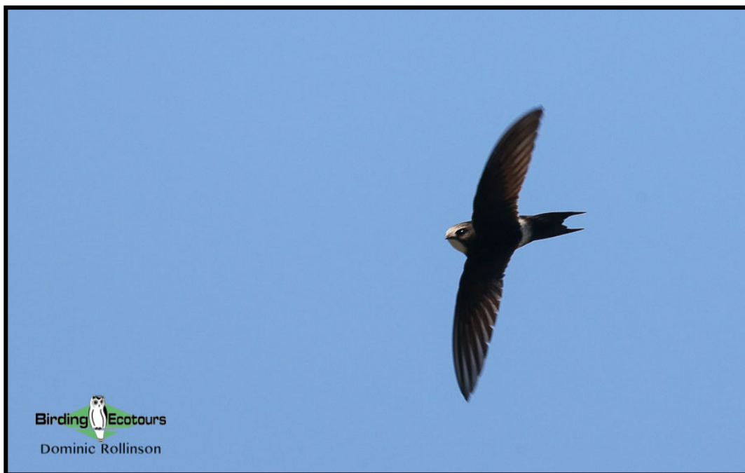
White-rumped Swift is a recent colonist from Africa.

We then leave the straits behind and head inland to the vast forests and mountains of the interior. Here we will look for some fascinating specials of the area including White-rumped Swift , a rare and recent colonist from Africa . We then head towards the beautiful, picturesque, and very birdy mountain town of Ronda where we can also find herds of Iberian Wild Goat (Spanish Ibex). We will also enjoy the spectacular scenery of the Sierra Grazalema National Park and spend time here searching the area for its exciting birds.