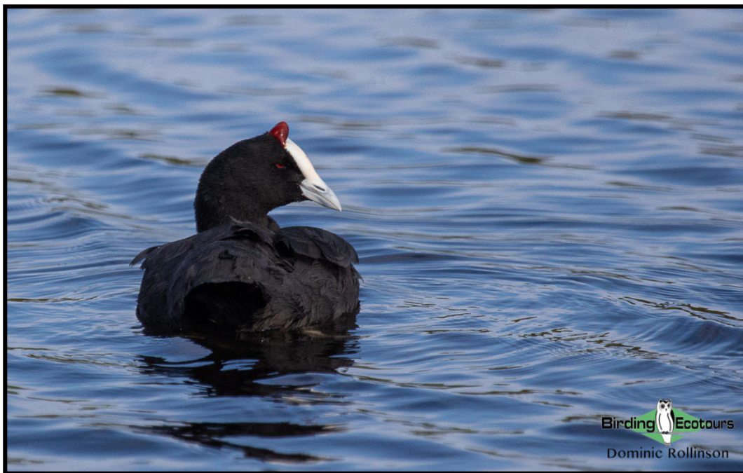
The Guadalquivir area is a stronghold for the Critically Endangered (in Spain), Red-knobbed Coot .