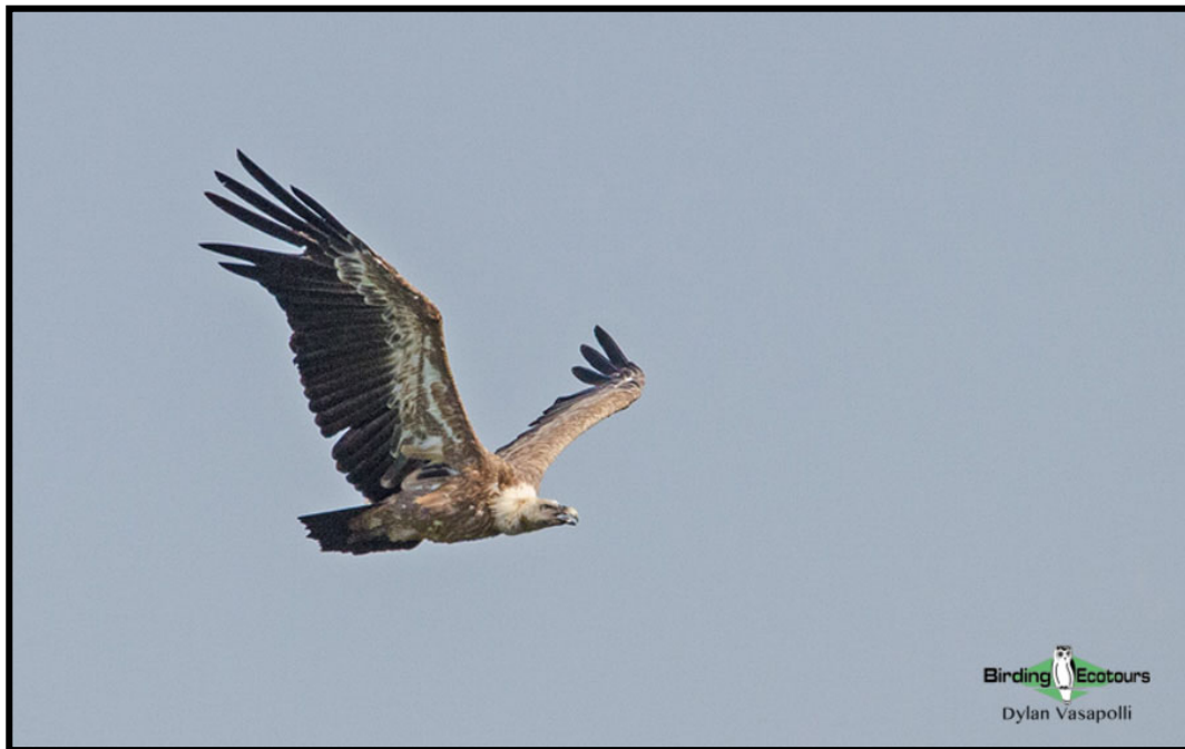
Griffon Vulture can be seen in the mountain areas in Andalusia.

Spain's bird list currently stands at 672 species (following International Ornithological Congress (IOC) v13.1 taxonomy as of July 2023), one of the highest single country lists in the Western Palearctic. The region of Andalusia actually accounts for an impressive 490 of these species . With such a range of birds on offer, we will maximize our chances of seeing as many as possible with a combination of expert guides, a comprehensive itinerary visiting the best places to go birding in Andalusia, and visiting at the best time of year. These all combine to make for a wonderful birdwatching holiday.