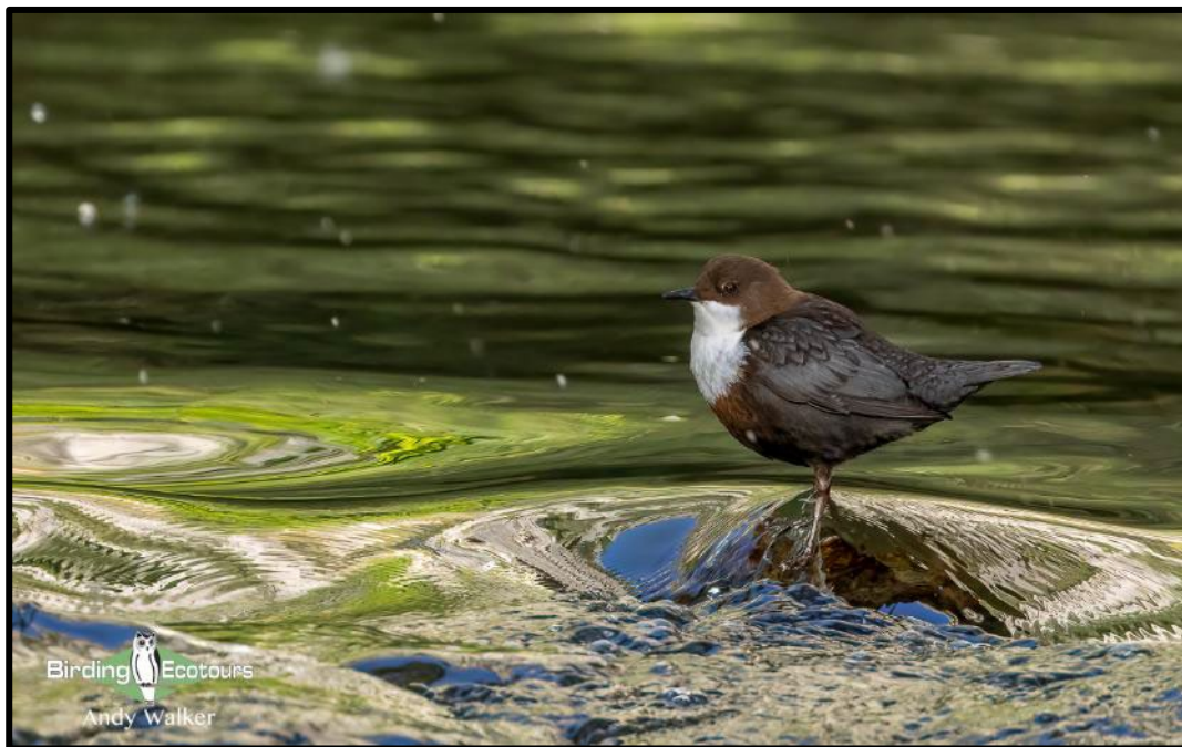
White-throated Dipper can be found in the mountain rivers.

In the afternoon we head northeast towards the Hoces del Rio Duratón National Park . If time allows, we will make our first attempt at the incredibly elusive Dupont's Lark . BirdLife International lists this bird as being of globally Near Threatened status and it has declined rapidly