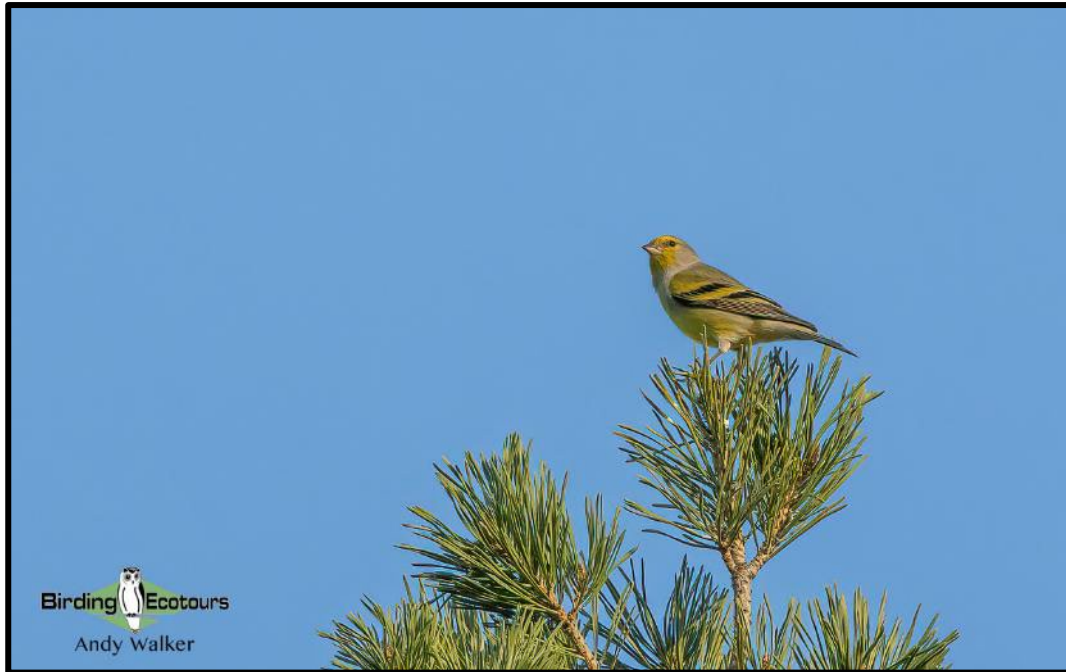
Citril Finch will be a target while we bird Gredos.