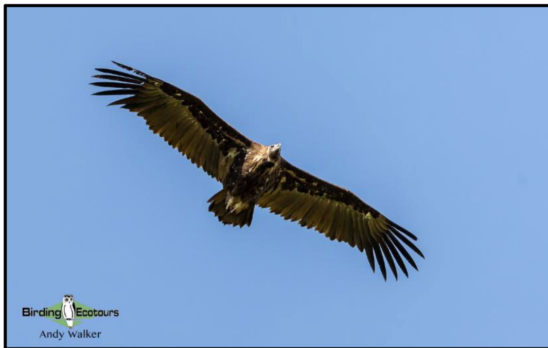
The humongous Cinereous Vulture can be seen well at Monfragüe National Park.

Our second day in Monfragüe will take us to Monfragüe National Park itself, before we continue our journey north to Gredos. The majestic scenery and fabulous wildlife here make this a real highlight of the tour. The national park is a mecca for birds of prey, with Egyptian Vulture , Cinereous Vulture , Griffon Vulture , Short-toed Snake Eagle , Booted Eagle , Bonelli's Eagle , Spanish Imperial Eagle , Golden Eagle , Red Kite , Black Kite , Common Buzzard , Osprey , Eurasian Sparrowhawk , Eurasian Goshawk , Black-winged Kite , Montagu's Harrier , Lesser Kestrel , Common Kestrel , Eurasian Hobby , and Peregrine Falcon all recorded in the area during spring. While some of these species are more common than others, we will have a fantastic day in the national park, taking in its many birds of prey.