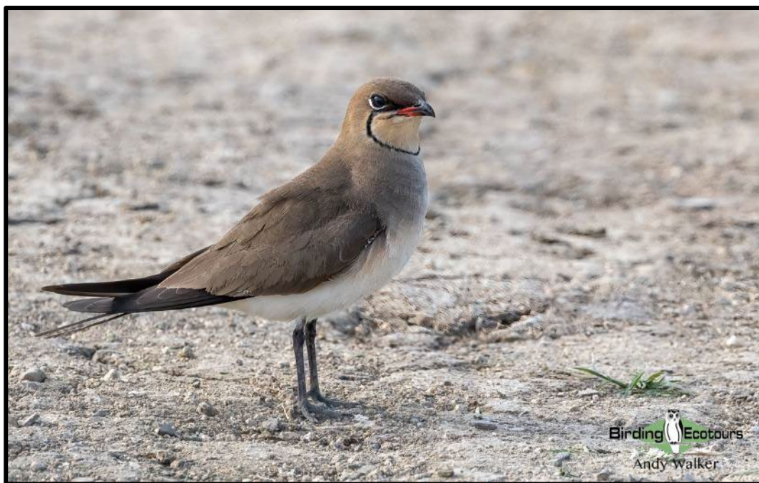
Collared Pratincoles can be found in large numbers around Sanlúcar de Barrameda.

Overnight: Ardea Purpurea , Villamanrique de la Condesa