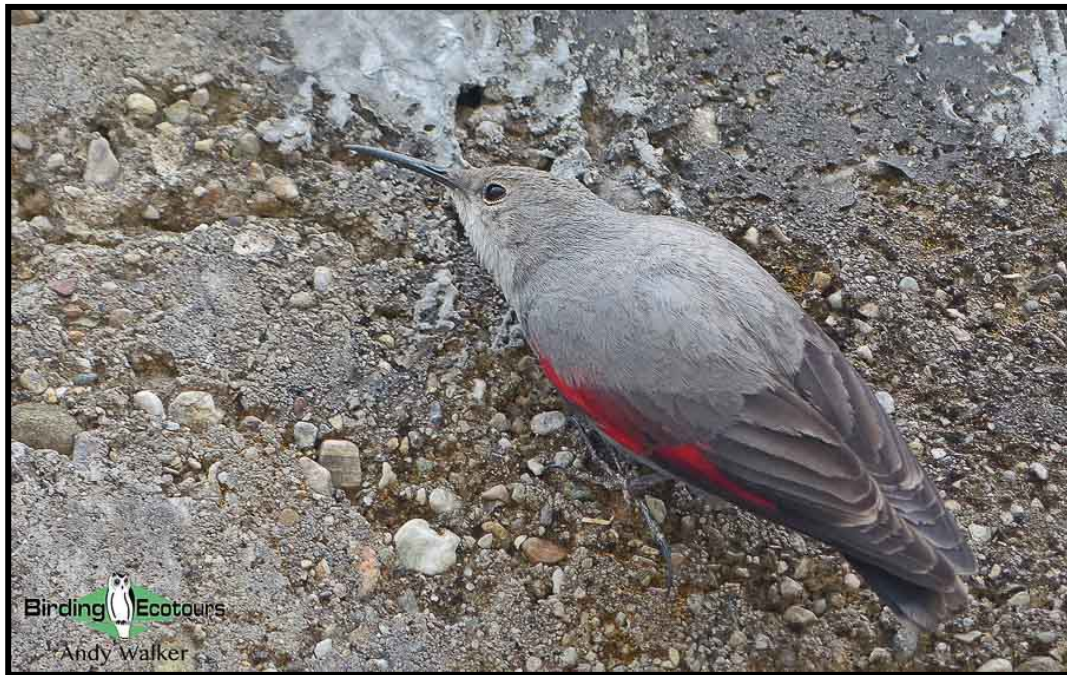
Wallcreeper is highly prized as this species is also a monotypic family.

Along with Bearded Vulture we will spend time in search of the beautiful Wallcreeper (a monotypic family). The area that supports this species is also a great place to yet again search for Red-backed Shrike plus other key species for the region such as Eurasian Wryneck , Black Woodpecker , Alpine Chough , Marsh Tit , Eurasian Treecreeper , Garden Warbler , Ring Ouzel , Alpine Accentor , Rock Sparrow , and Yellowhammer . With luck we may also spot Southern Chamois , a species of goat-antelope, and the very adorable Alpine Marmot , a species of ground dwelling squirrel. We finish our Pyrenean adventure with a visit to the high plateaus and dramatic glacial valleys of the Ordesa y Monte Perdido National Park . Here we will target some of the previously mentioned montane species plus the striking White-winged Snowfinch .