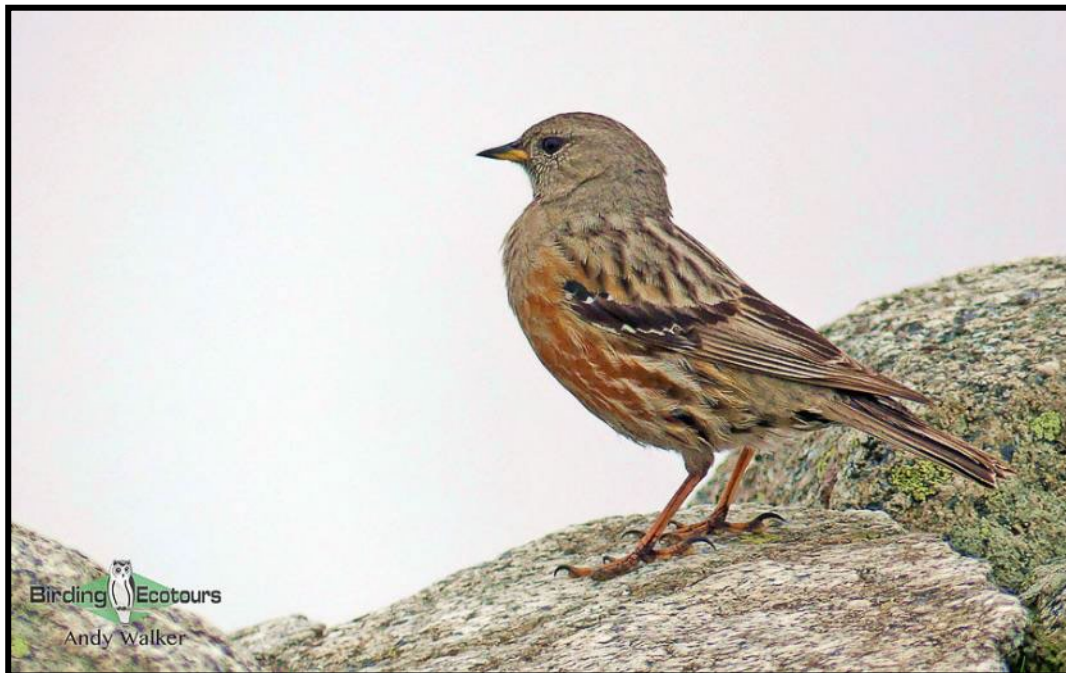
Alpine Accentor is a hardy passerine of high-altitude mountains.