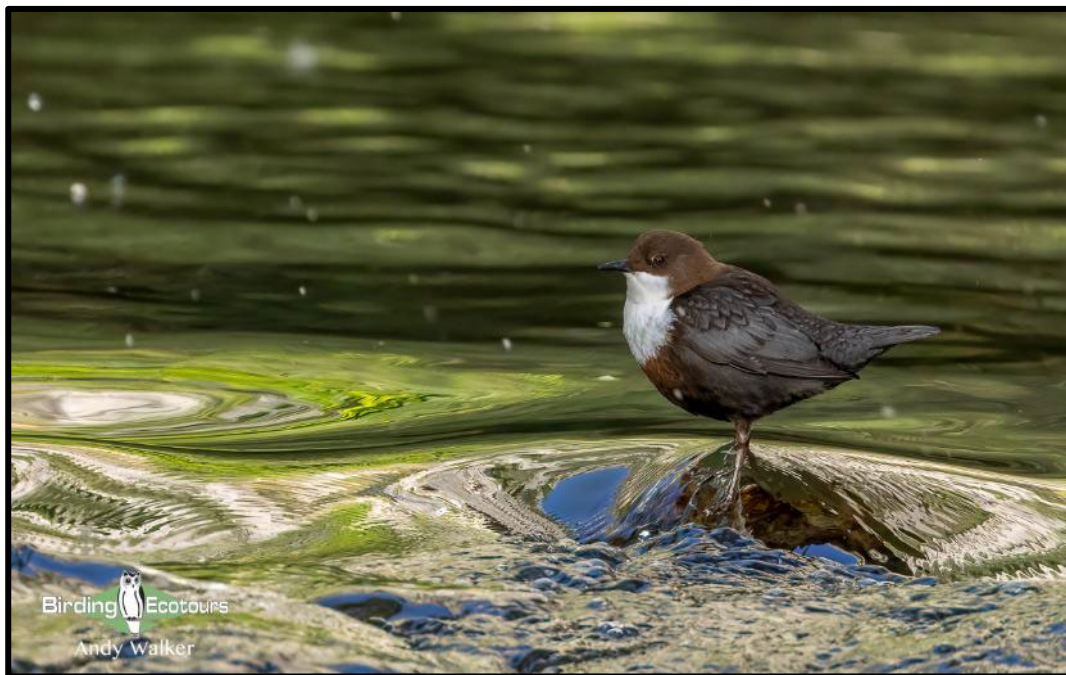
White-throated Dipper can be found in the mountain rivers.

In the afternoon we head northeast towards the Hoces del Rio Duratón National Park . If time allows, we will make our first attempt at the incredibly elusive Dupont's Lark . BirdLife International lists this bird as being of globally Near Threatened status and it has declined rapidly