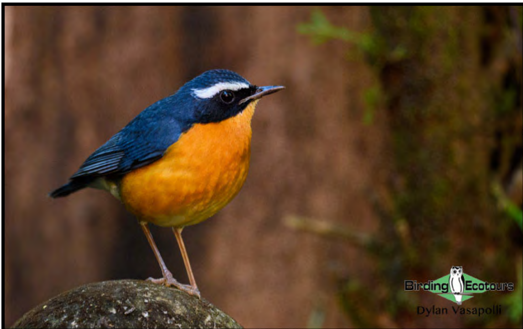
We will look on the ground for the gorgeous Indian Blue Robin .