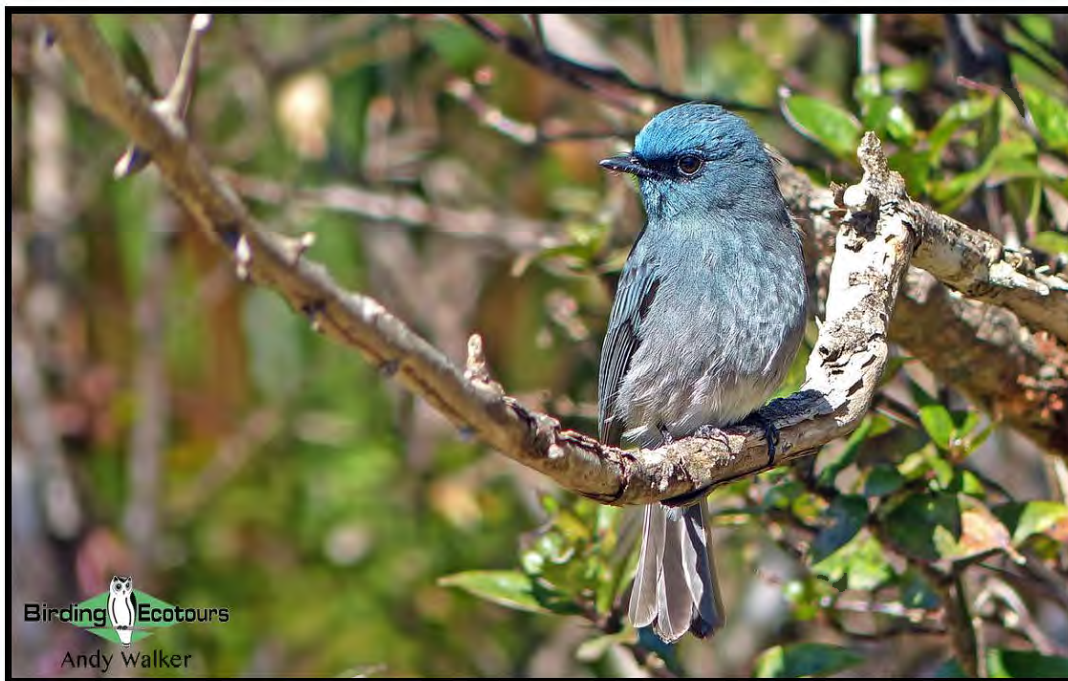
The endemic Dull-blue Flycatcher is found in the mountains of Sri Lanka.

In the morning we will be birding for any missing montane specials before driving to Kandy at an elevation of 477 meters (1,565 feet), the last Sinhalese kingdom in Sri Lanka, which was ceded to the British in 1815. En route we will pause at a tea factory to see the recently split Hill Swallow , which nests inside the factory. After a cuppa we will reach our accommodation, which is a hotel situated close to birding sites and the sacred city of Kandy, a UNESCO World Heritage Site.