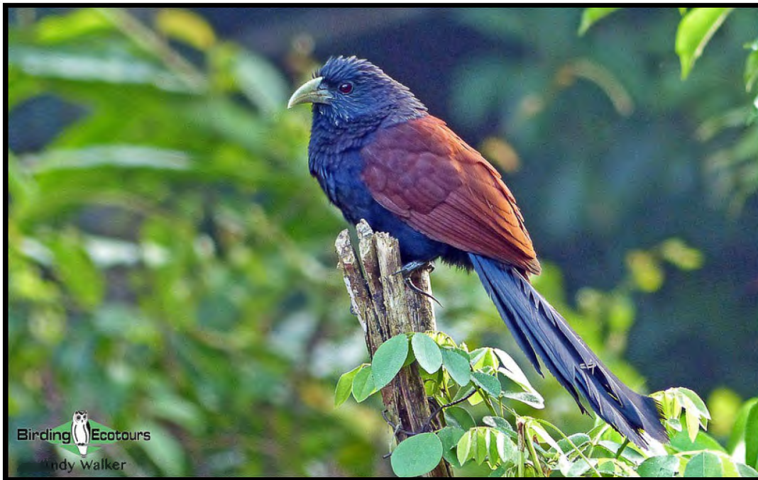
Green-billed Coucal is a secretive endemic and we will be constantly looking for one.