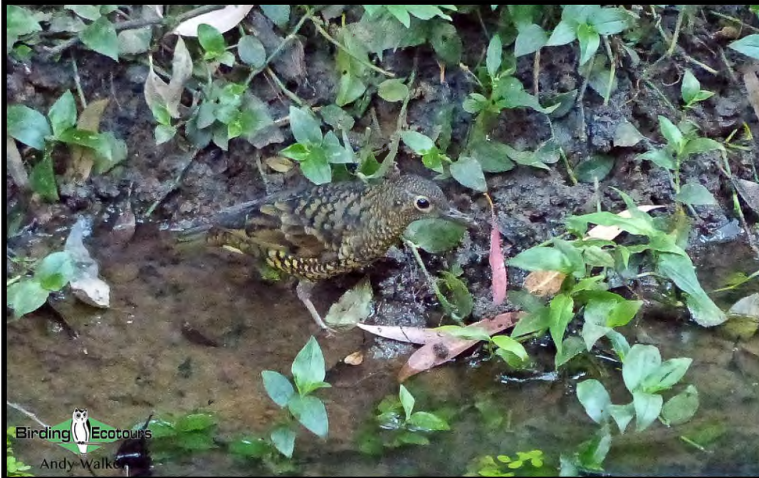
The secretive Sri Lanka Thrush , another highly sought endemic that skulks along the ground