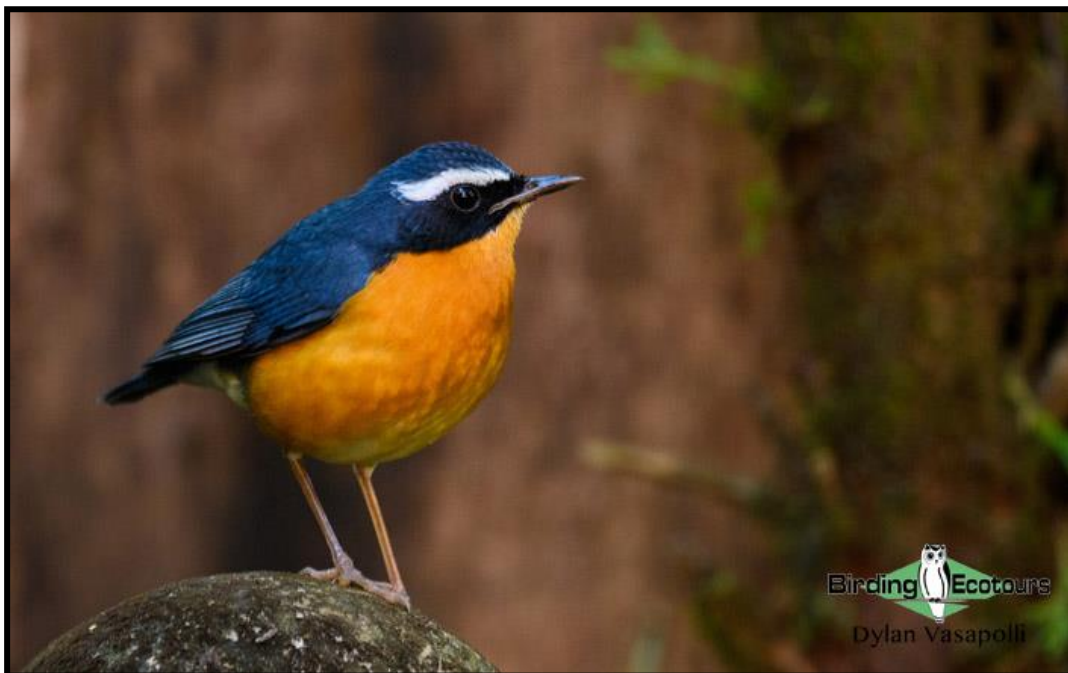
We will look on the ground for the gorgeous Indian Blue Robin .