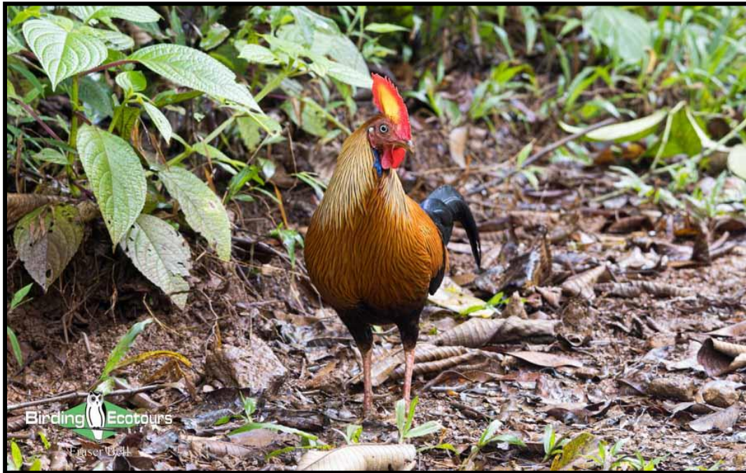
No ordinary chicken! A regal Sri Lanka Junglefowl looking at our group.

estimated population of only 200 to 250 birds in the wild. We will look for it at a daytime roost, and Sinharaja is the best place in the world to see it.