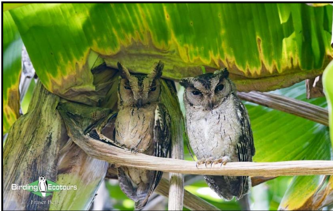
Indian Scops Owl are one of four species of owl we will look for at day roosts around the Tissamaharama lakes.

After a final morning birding in Sinharaja we will move east to the town of Tissamaharama, our base for three nights as we explore this excellent area for a wide range of birds. On arrival we will head out for our first wetland birding, focusing on the large Tissa lakes, which are fringed with dense vegetation. These are brilliant for a wide variety of waterbirds such as Lesser Whistling Duck , Cotton Pygmy Goose , Grey-headed Swamphen , Pheasant-tailed Jacana , Oriental Darter , Indian and Little Cormorants , Black-headed Ibis , Yellow Bittern , Spot-billed Pelican , and Stork-billed Kingfisher , among others. The mix of wooded home gardens, vegetated lakes, and flooded fields supports high diversity, and we are likely to add a large number of species to our trip list, with the likes of Coppersmith Barbet , White-naped Woodpecker , Rose-ringed Parakeet , Small Minivet , Brown Shrike , Plain Prinia , and Jerdon's Leafbird all abundant here.