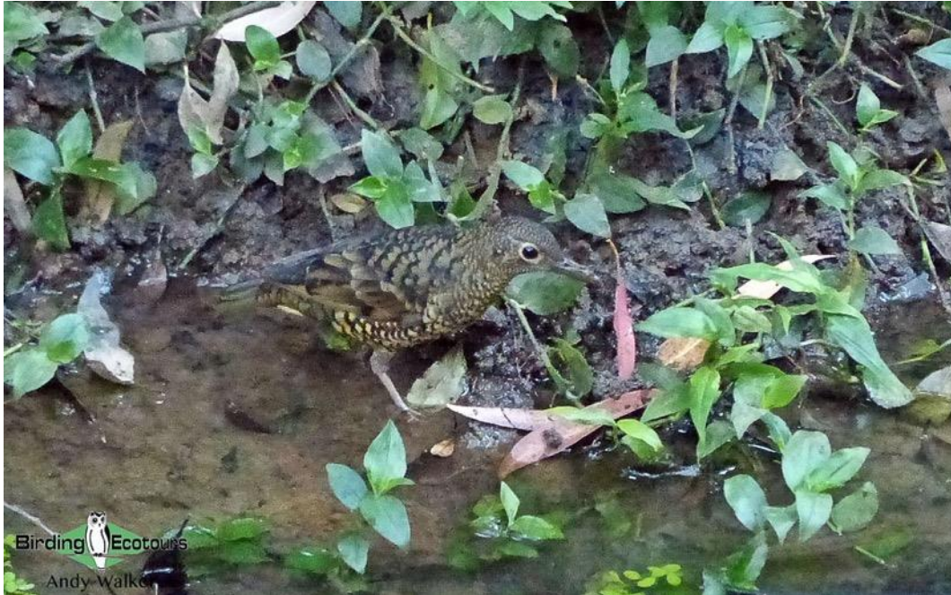
The secretive Sri Lanka Thrush , another highly sought endemic that skulks along the ground