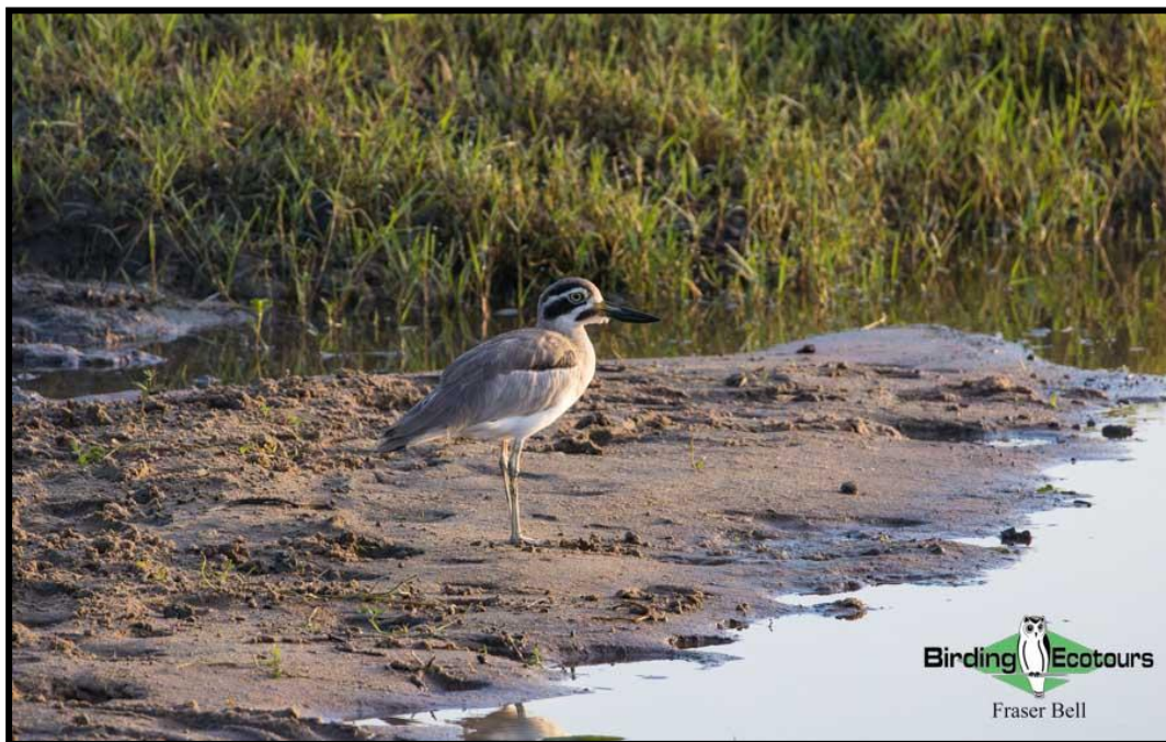
Great Stone-curlews can be seen at Bundala National Park.

We will spend the full day birding the fascinating habitats of Bundala National Park, Sri Lanka's first Ramsar site. This is the premier site for waterbirds, and you can often get close to the birds in the vehicles to get very good photographic opportunities. We will explore the extensive pools, flooded grasslands, dry thorny scrubland, sand dunes, brackish water lagoons, and salt pans for a large range of species. We will get there as early as possible to maximize our time in this wonderful set of habitats. Some of the species possible here are Black, Yellow, and Cinnamon Bitterns, Watercock, Great and Indian Stone-curlews, Eurasian Curlew, Marsh Sandpiper, Tibetan and Greater Sand Plovers, Kentish Plover, Red-necked Phalarope, Small Pratincole, Black-headed and Glossy Ibises, Eurasian Spoonbill, Black-necked Stork, Little and Indian Cormorants, Oriental Darter, Spot-billed Pelican, Yellow-wattled Lapwing, Black-tailed Godwit, Garganey, Greater Flamingo, Caspian, White-winged, Whiskered, Common, Greater Crested, Lesser Crested, and Little Terns . Other species possible in the area include Clamorous (Indian) Reed Warbler, Eurasian Hoopoe, Ashy-crowned Sparrow-Lark, Brown Fish Owl, Yellow-crowned Woodpecker, and Ashy Drongo .