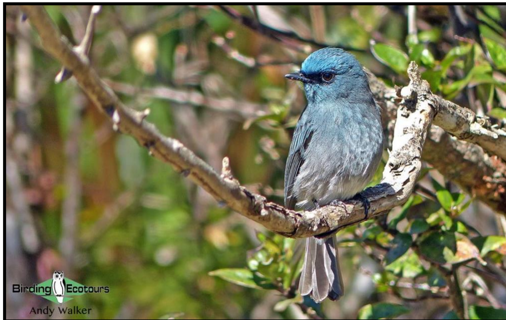
The endemic Dull-blue Flycatcher is found in the mountains of Sri Lanka.