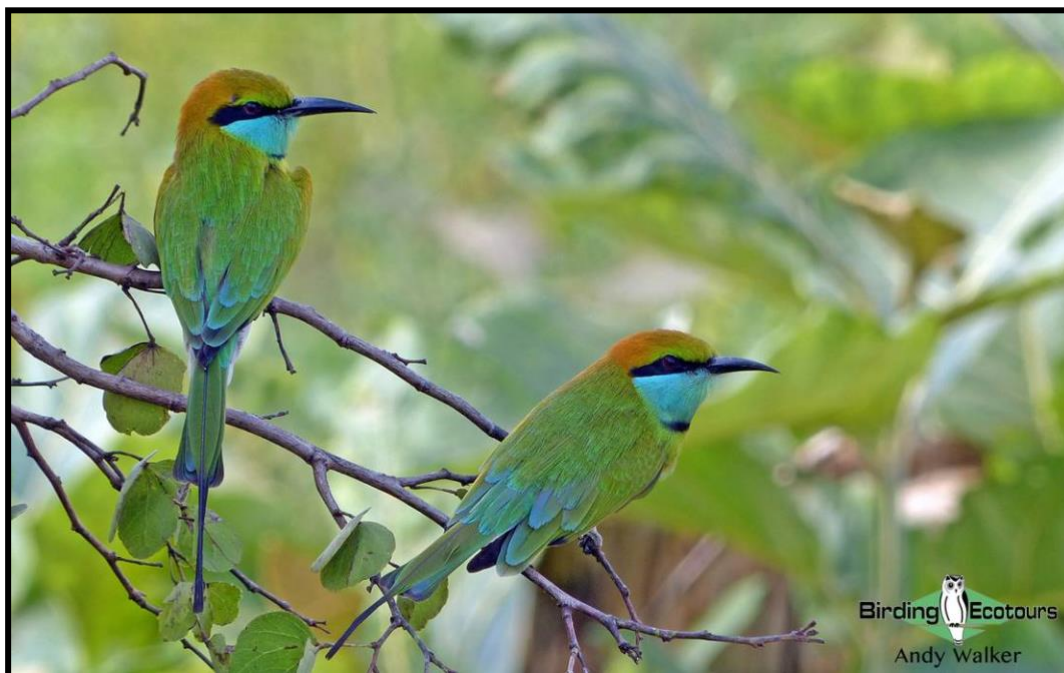
Asian Green Bee-eater is one of the species we hope to encounter in Yala National Park.

We have an amazing opportunity to do a full day of game drives in the famous Yala National Park. This park covers a vast area of monsoon forest, dry grassland, and lush wetlands, all bordering the Indian Ocean. We have one major avian target in the park, the endemic Sri Lanka Shama , a surprisingly shy bird of the dry forests here. Once we have this species in the bag, we will turn our attention to the large mammals that give the park its fame. Our big targets will be the Sri Lankan endemic subspecies of Leopard and Sloth Bear , which, despite their rarity, we have seen both on previous tours. Yala is thought to hold the greatest density of Leopard in the world but if we see one we will consider ourselves lucky! Other mammalian targets include Golden Jackal , Tufted Grey Langur , Wild Boar , Wild Water Buffalo , Sri Lankan Giant Squirrel , Sambar Deer , and Chital (Spotted Deer), and there is also a good chance of finding Asian Elephant , which is always a treat.