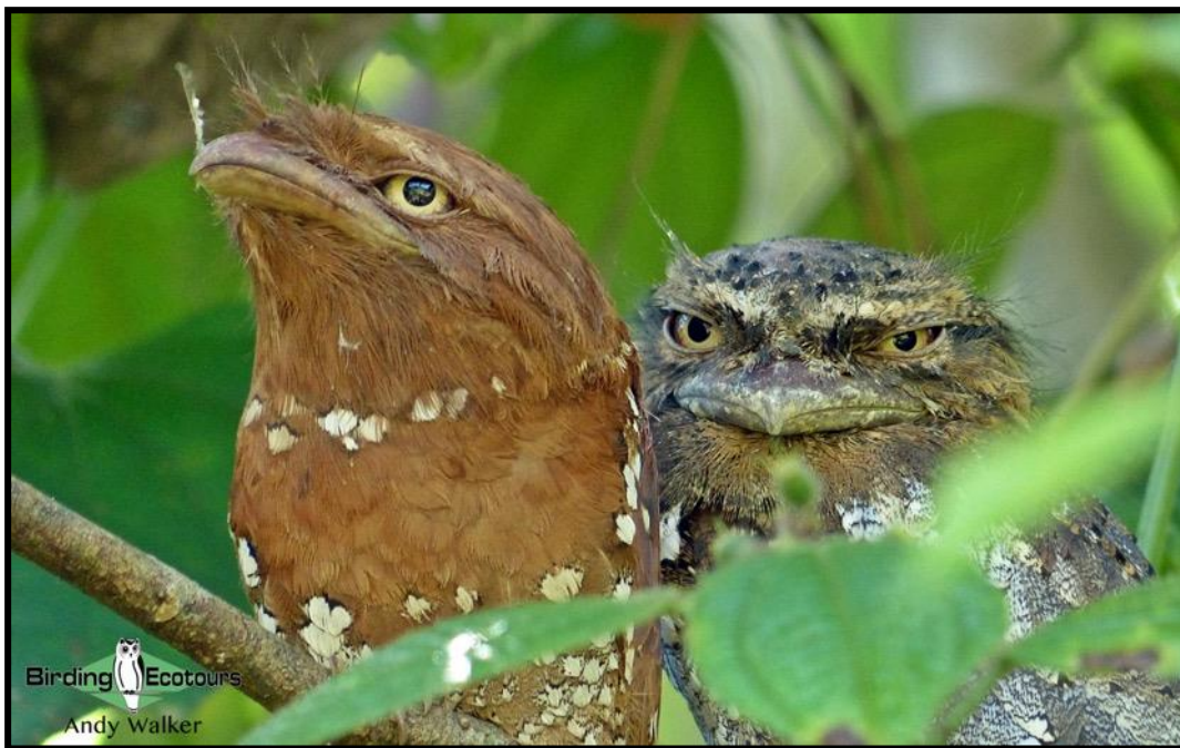
Sri Lanka Frogmouth can often be found during the daytime.

Sri Lanka is home to 35 currently recognized IOC endemic bird species, with some of the most impressive ones including the rare Sri Lanka Spurfowl , the gaudy Sri Lanka Junglefowl , Sri Lanka Hanging Parrot , Layard's Parakeet , the shy, thicket-dwelling Red-faced Malkoha , the tiny Chestnut-backed Owlet , the common Sri Lanka Grey Hornbill , Yellow-fronted Barbet , Crimson-fronted Barbet , and Yellow-eared Bulbul , the spectacular Sri Lanka Blue Magpie , the cute Sri Lanka White-eye , and the tricky, but worth-the-effort trio of Sri Lanka Whistling Thrush , Sri Lanka Thrush , and Spot-winged Thrush . We will also look for the relatively recently discovered (2001), Endangered (IUCN), range-restricted, and endemic Serendib Scops Owl , which we will hopefully find on its day roost, as we hope to do with the shy and secretive Sri Lanka Bay Owl too.