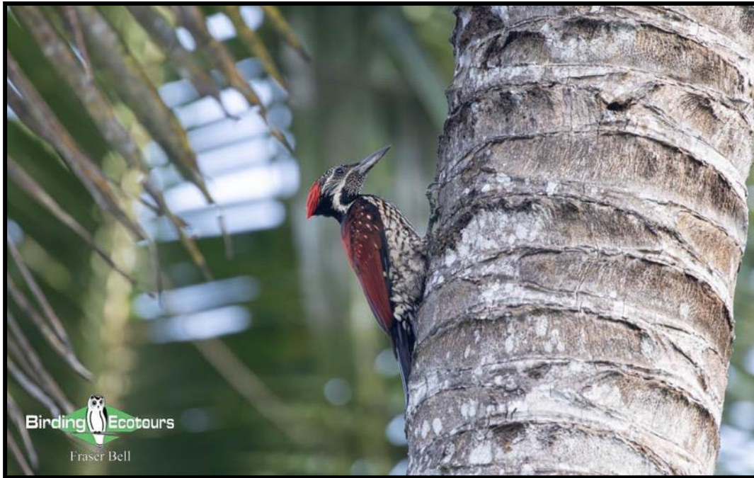
The endemic Red-backed Flameback is the most common woodpecker throughout much of Sri Lanka.