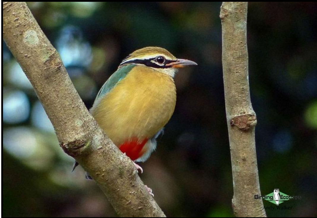
The stunning Indian Pitta spends its non-breeding season in Sri Lanka.