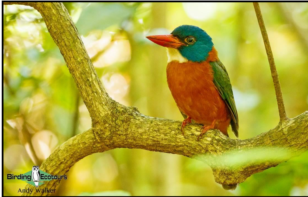
A Green-backed (Blue-headed) Kingfisher sits patiently in the forests of northern Sulawesi.

Kingfisher, Green-backed (Blue-headed) Kingfisher , and Sulawesi Dwarf Kingfisher ), the Hylocitrea (a highly sought-after monotypic family), the enigmatic Geomalia (an aberrant ground thrush), and the Satanic Nightjar in the mountains. Further to the aforementioned Standardwing , the island of Halmahera also supports the huge Ivory-breasted Pitta , several spectacular kingfishers such as Common Paradise Kingfisher , Blue-and-white Kingfisher , and Sombre Kingfisher , the unobtrusive Scarlet-breasted Fruit Dove , the bizarre Moluccan Owlet-nightjar , and Halmahera Paradise-crow (a member of the bird-of-paradise family).