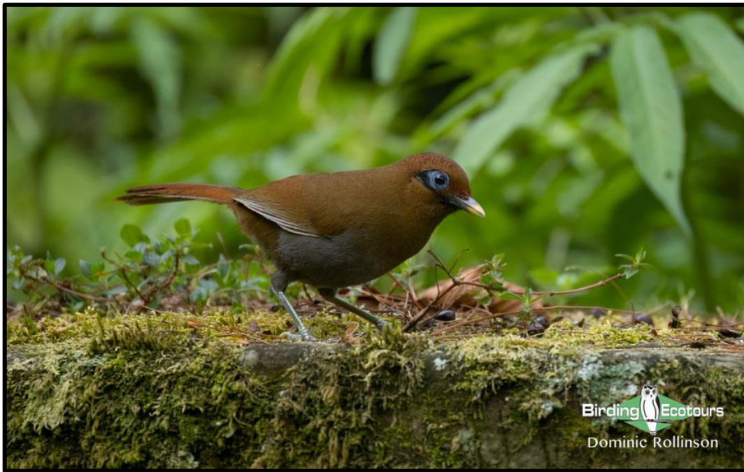
Rusty Laughingthrush is one of a few laughingthrush species we might see on this tour.

Eurasian Jay , and the scarce Ashy Wood Pigeon , while a local waterfall is home to the gorgeous Little Forktail .