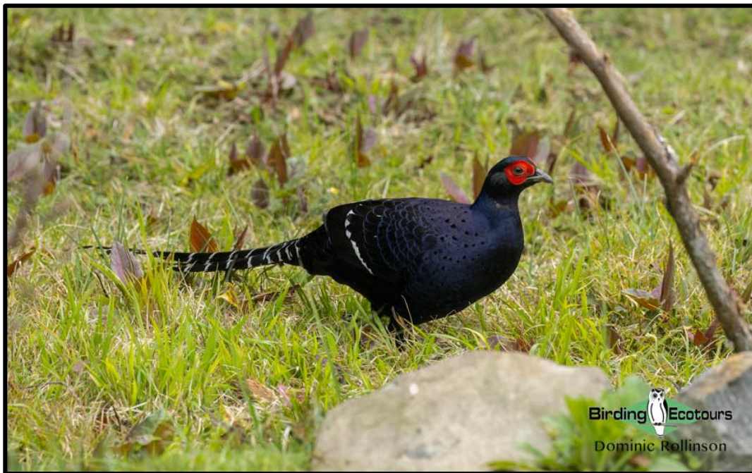
The endemic Mikado Pheasant is a highly prized target species.

The main target in the higher altitude forests is the graceful Mikado Pheasant . While staking them out along the road, the highly confiding White-whiskered Laughingthrush and Maritime (Formosan) Striped Squirrel will likely pose for you. Nearby we will be on alert for Taiwan (formerly White-browed) Bush Robin and the smart Collared Bush Robin . As we get into hemlock and dwarf bamboo forest at the highest points, we will hopefully encounter the distinctive local version of Southern Nutcracker as well as Yellow-bellied Bush Warbler, Taiwan Bush Warbler , and the cute and highly active Flamecrest .