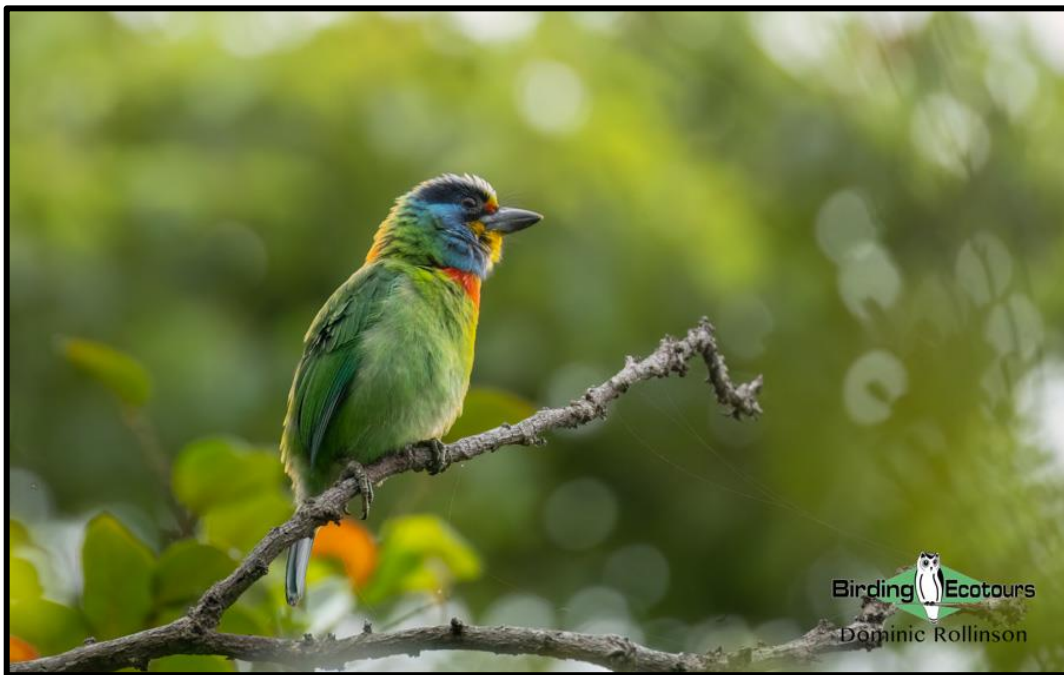
Taiwan Barbet is one of Taiwan's most widespread endemics.