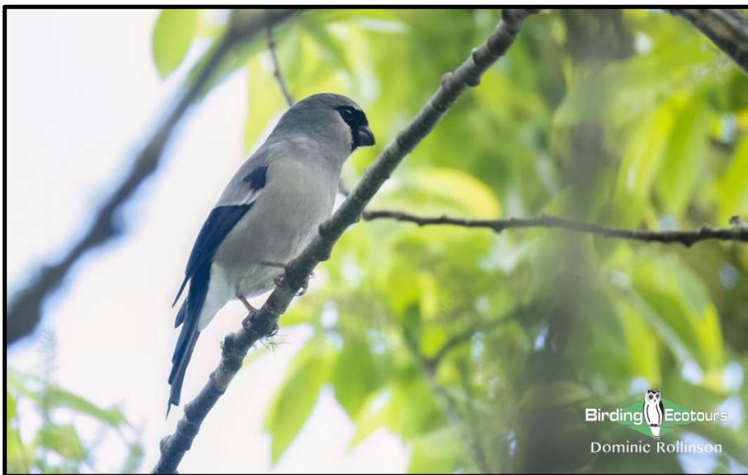
Taiwan Bullfinch is one of our many endemic targets around Alishan.

Overnight: Zhuqi Township (near Alishan National Scenic Area)