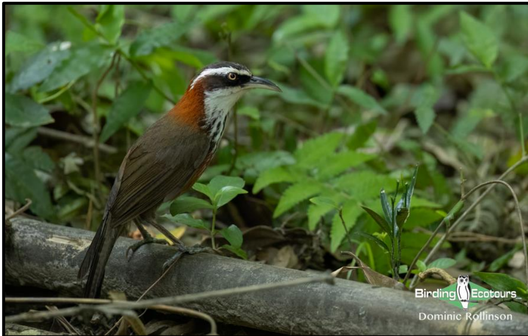
Taiwan Scimitar Babbler is an attractive Taiwanese endemic.

Most of the endemic birds are found in the mountains, meaning birding takes place in some absolutely gorgeous scenery with nice cool temperatures, a pleasant change from the warmer lowlands where there are also plenty of excellent birds to be found, including several more endemics, and the migratory and highly sought-after Fairy Pitta . A few of the species occurring in Taiwan with distinctive local subspecies (and potential future splits) include Ryukyu Scops Owl , Dusky Fulvetta , Golden Parrotbill , Maroon Oriole , and many more.