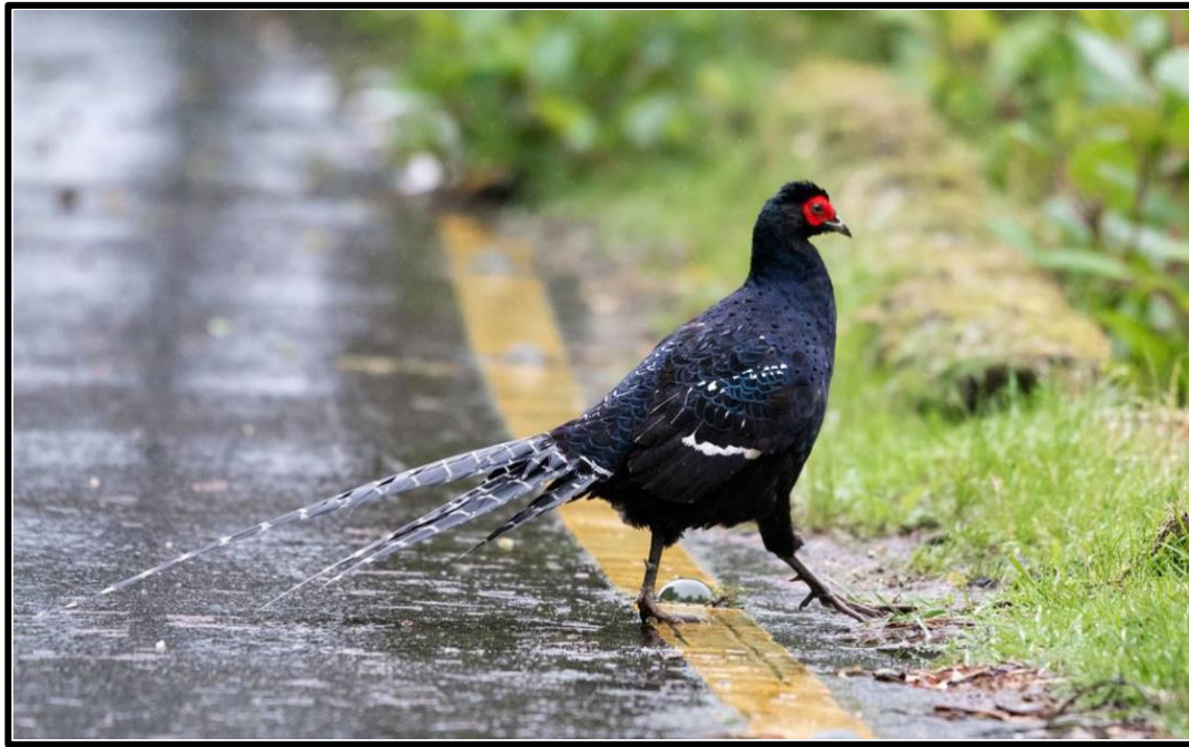
The endemic Mikado Pheasant is a highly prized target species (photo Da Chih Chen).

of Southern (Spotted) Nutcracker as well as Brown-flanked Bush Warbler , Yellow-bellied Bush Warbler , Taiwan Bush Warbler , and Taiwan Shortwing .