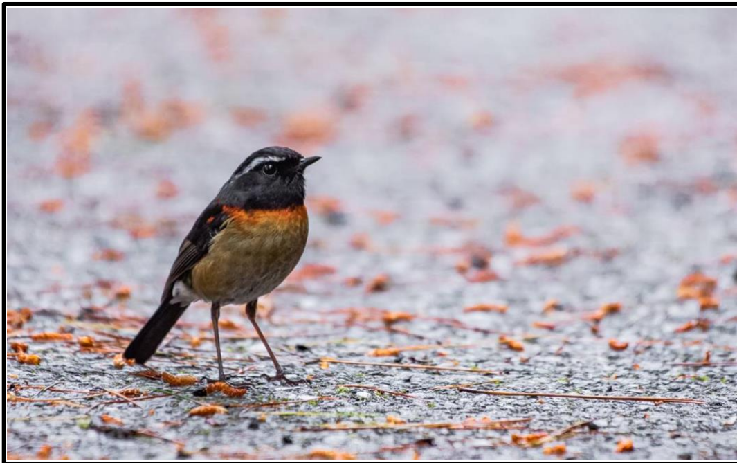
The endemic Collared Bush Robin is a rather dainty and approachable bird of the higher elevations that we will spend time birding in while on Taiwan.