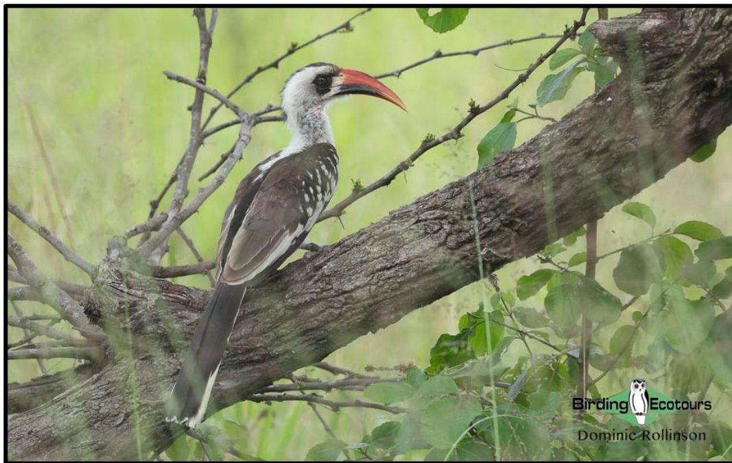
Tanzanian Red-billed Hornbill – a Tanzanian endemic.