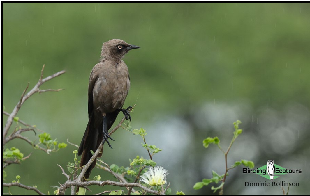
Ashy Starlings are numerous in Tarangire National Park.