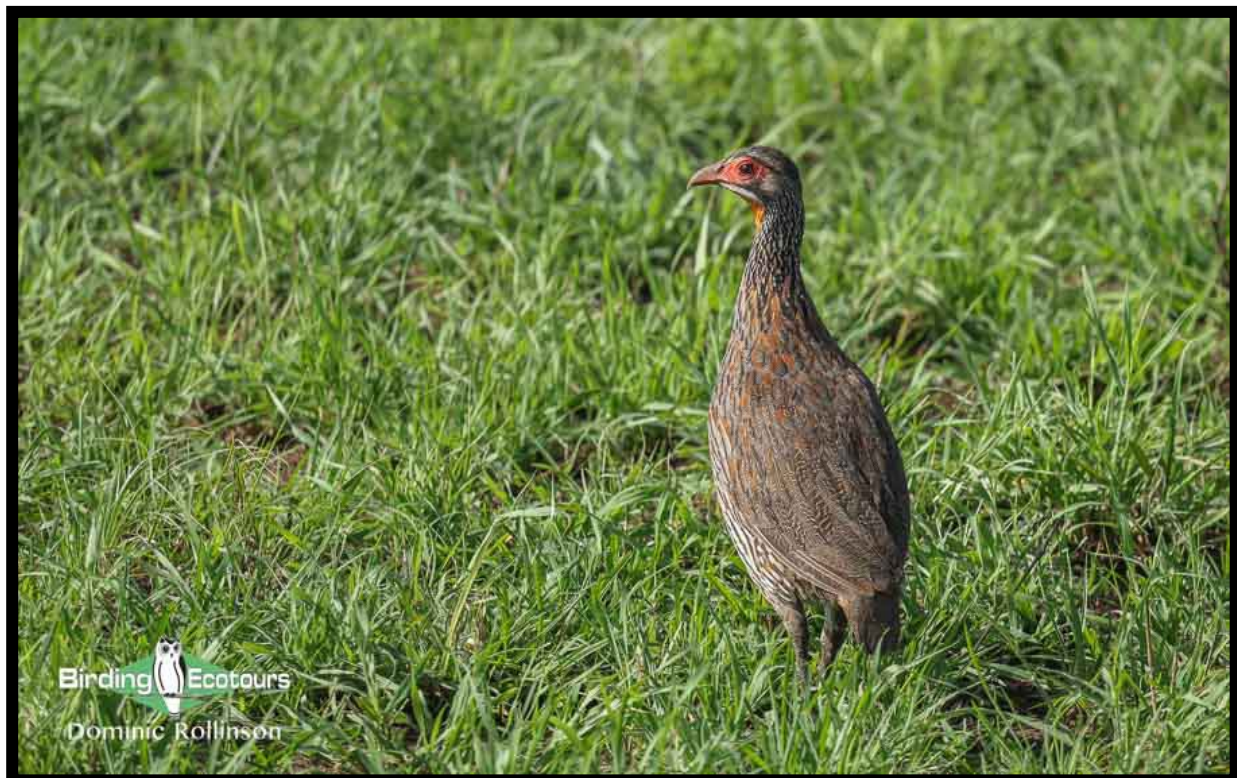
Grey-breasted Spurfowl, a highly localized Tanzanian endemic.