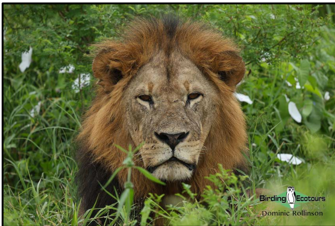
The Serengeti supports large numbers of Lions.

This morning we embark on a spectacular journey that few people will ever forget. If you've never been to Africa before, you're likely to be amazed by African Savanna Elephant, Cape Buffalo, and the sheer number of bird species. After an exciting drive we'll reach the Serengeti, where we enjoy the huge and impressive wildebeest migration, not to mention the large numbers of Plains Zebras and Thomson's Gazelles. Other megafauna that we'll search for include Tsessebe (Topi), Common Eland, Grant's Gazelle, Bohor Reedbuck, and Maasai Giraffe. This is one of the best places on the planet to see big cats – we've sometimes seen Lion, Leopard, and Cheetah in a single day, as well as some of the smaller cats such as Serval and Caracal. Finding a kill should allow us to see a good number of vulture species, such as Rüppell's, White-backed, Lappet-faced, White-headed, and Hooded Vultures.