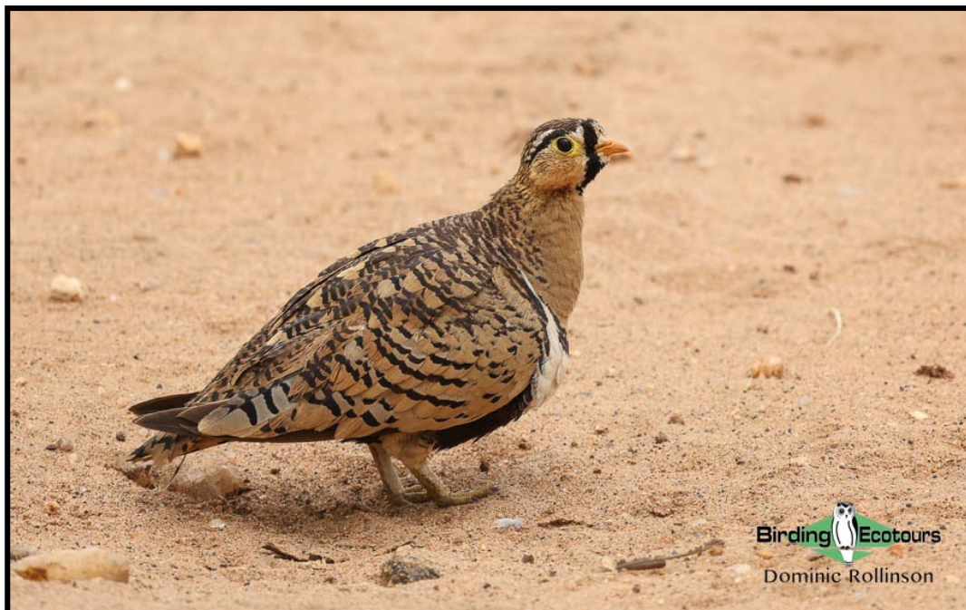
We often find Black-faced Sandgrouse in Tarangire National Park.