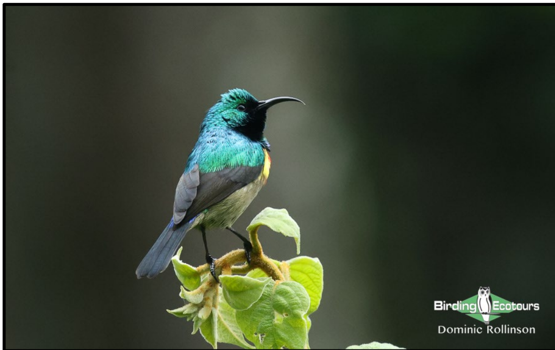
The attractive Eastern Double-collared Sunbird.