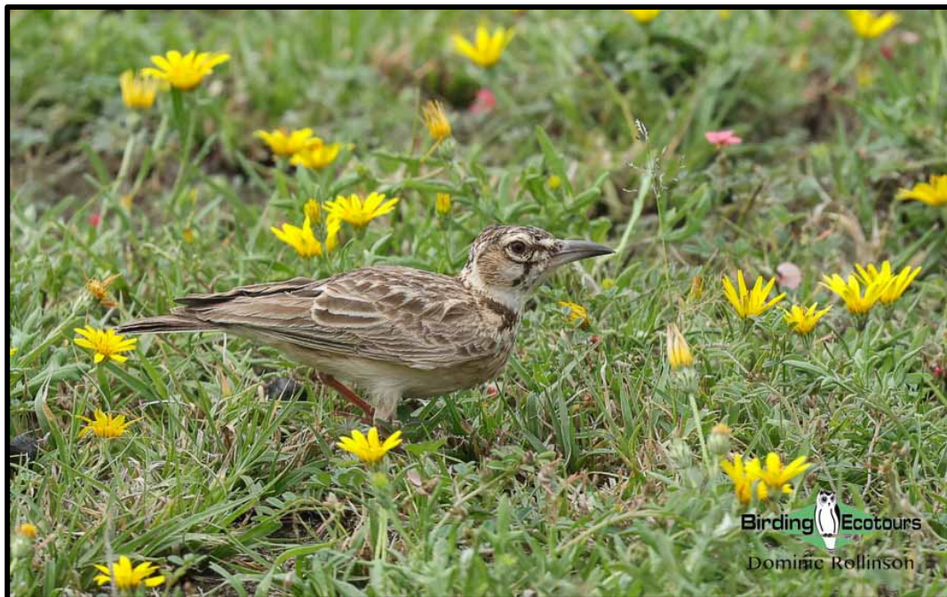
The distinctive Short-tailed Lark will be searched for alongside the rare Beesley's Lark .

We will spend time birding the (aptly named) Lark Plains for the rare and localized Beesley's Lark (less than 200 remaining) along with a host of other lark species, including Fawn-colored , Short-tailed , Athi Short-toed , and Rufous-naped Larks and Fischer's Sparrow-Lark . Other species we will keep an eye out for on the plains include Kori Bustard , Eastern Chanting Goshawk , Greater Kestrel , Temminck's and Double-banded Coursers , Yellow-throated and Chestnut-bellied Sandgrouse , Abyssinian and Capped Wheatears , Taita Fiscal , and numerous others.