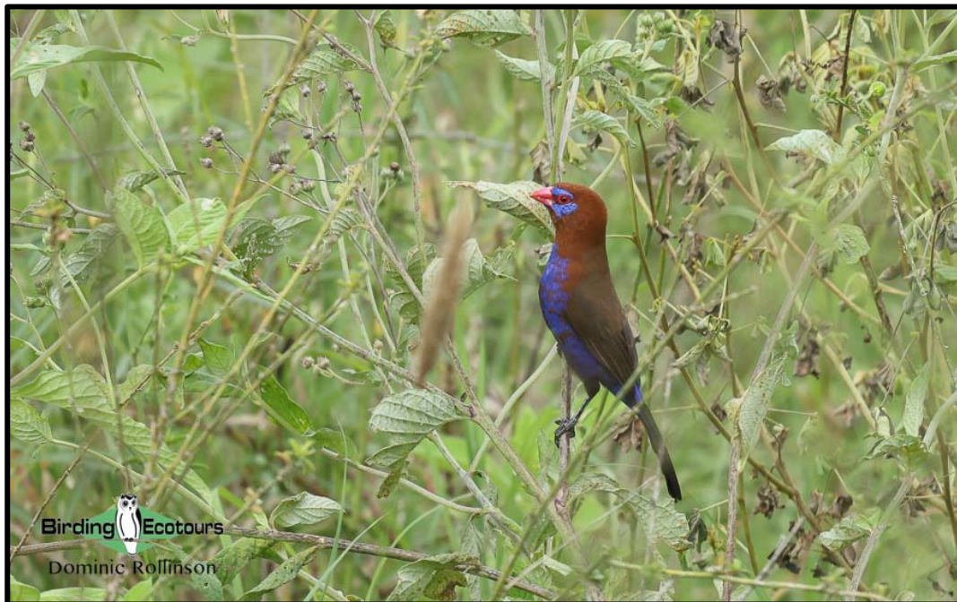
The gorgeous Purple Grenadier is readily encountered in northern Tanzania.

After breakfast we will make our way out of Arusha and arrive at Lake Manyara National Park in the late morning. Here we usually add quite a number of birds to our list and will enjoy a picnic lunch while being distracted by many exciting bird species. In the forested areas we'll be on the lookout for Narina Trogon , Grey Cuckooshrike , Mountain Wagtail , Crowned Hornbill , and the huge Silvery-cheeked Hornbill , among others. In the more open woodland, we should hopefully find Spotted Palm Thrush , Red-and-yellow Barbet , White-bellied Tit , Banded Parisoma , Rufous Chatterer , Rufous-tailed Weaver , Steel-blue and Straw-tailed Whydahs , and Purple Grenadier . The reserve is particularly good for raptors and some of our targets today include Lappet-faced and White-backed Vultures , Bateleur , Crowned Eagle , African Hawk-Eagle , African Goshawk , Verreaux's Eagle-Owl and the diminutive Pearl-spotted Owllet .