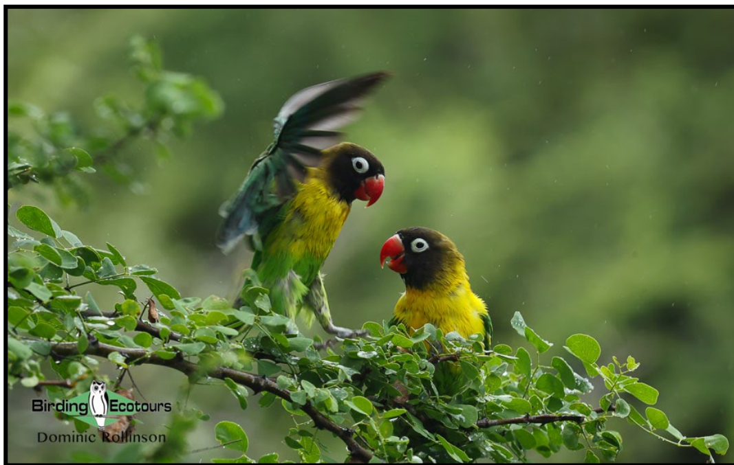
The endemic Yellow-collared Lovebird is one of our many colorful targets on this trip.

If you could visit Africa only once, this would undoubtedly be the tour to take. Our Northern Tanzania birding safari is designed to showcase the very best of Africa in just ten days, combining iconic wildlife spectacles with outstanding birding. Where else can you see Lion , Leopard , and Cheetah , witness the breathtaking Great Wildebeest Migration , and see a hundred bird species in a single day? Add the chance to gaze upon Mount Kilimanjaro , Africa's highest mountain, and to explore two of the world's most famous wildlife destinations – the Serengeti and the spectacular Ngorongoro Crater – and it quickly becomes clear why northern Tanzania ranks among the finest safari destinations on Earth. We enjoy easy yet exceptionally rewarding savanna birding on this tour as we target several localized and endemic species, typically with good photographic opportunities along the way. This tour offers one of the finest introductions to Africa's wildlife and birds available anywhere on the continent.