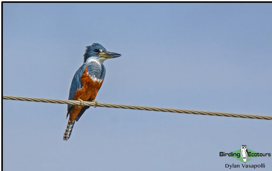
The large Ringed Kingfisher is a feature along the Rio Grande.

Following on, this tour ventures into the Lower Rio Grande Valley , where a number of days are spent exploring the excellent and vast network of state parks, preserves and wildlife areas. This wild part of the state supports a range of species more typically found further south in Mexico, and indeed the Neotropics. Perhaps no better example of this exists with the fact that Ocelot occur in the area, though a great deal of luck is needed to see this secretive and rare cat. A wide range of species will be targeted, including such charismatic species as Plain Chachalaca , Aplomado Falcon , Ringed Kingfisher , Golden-fronted Woodpecker , Green Jay and Long-billed Thrasher . We will also make a special effort for rare species like Morelet's (White-collared) Seedeater , and will keep an ear to the ground for any rarities that may be present in the area – which may include such sought-after species as Northern Jacana and Crimson-collared Grosbeak . In addition, a number of waterbirds will be seen, everything from spoonbills to pelicans and curlews, and a number of species more regularly associated with the drier American southwest, such as Greater Roadrunner and Black-throated Sparrow , should also feature.