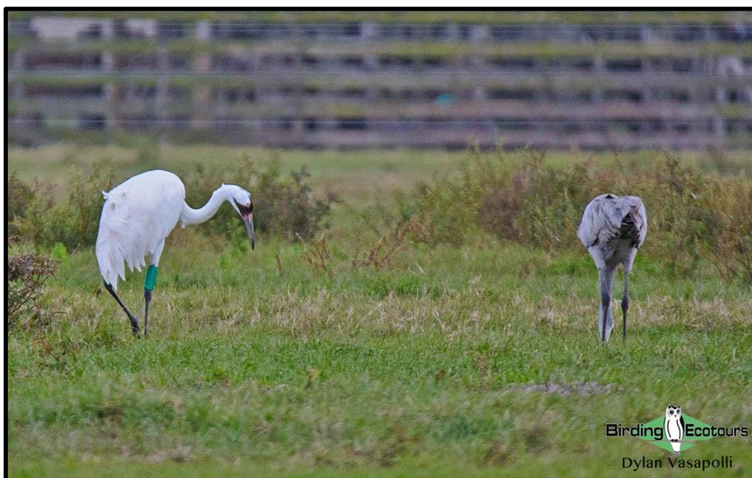
Whooping Crane (left) is an incredibly desirable North American endemic bird.

This short tour, timed at the start of winter, sees us focusing on the many resident specials of the state, and in particular, trying to find as many of the Mexican/Neotropical species as possible. Indeed, a great deal of bird species can only be reliably found in Texas, within the US. First and foremost is Whooping Crane . This species has a tragic history, having been on the verge of extinction with fewer than 20 individuals left in the wild, before a great rehabilitation and reintroduction program was set in motion. With non-stop work over decades, this species has been down-listed to Endangered by the IUCN Red List , and now some 300+ individuals survive in the wild. This is an important target for us on this tour, and we dedicate time around Corpus Christi, at the start of this tour, where we can access the Aransas National Wildlife Refuge , specifically targeting this highly sought-after species.