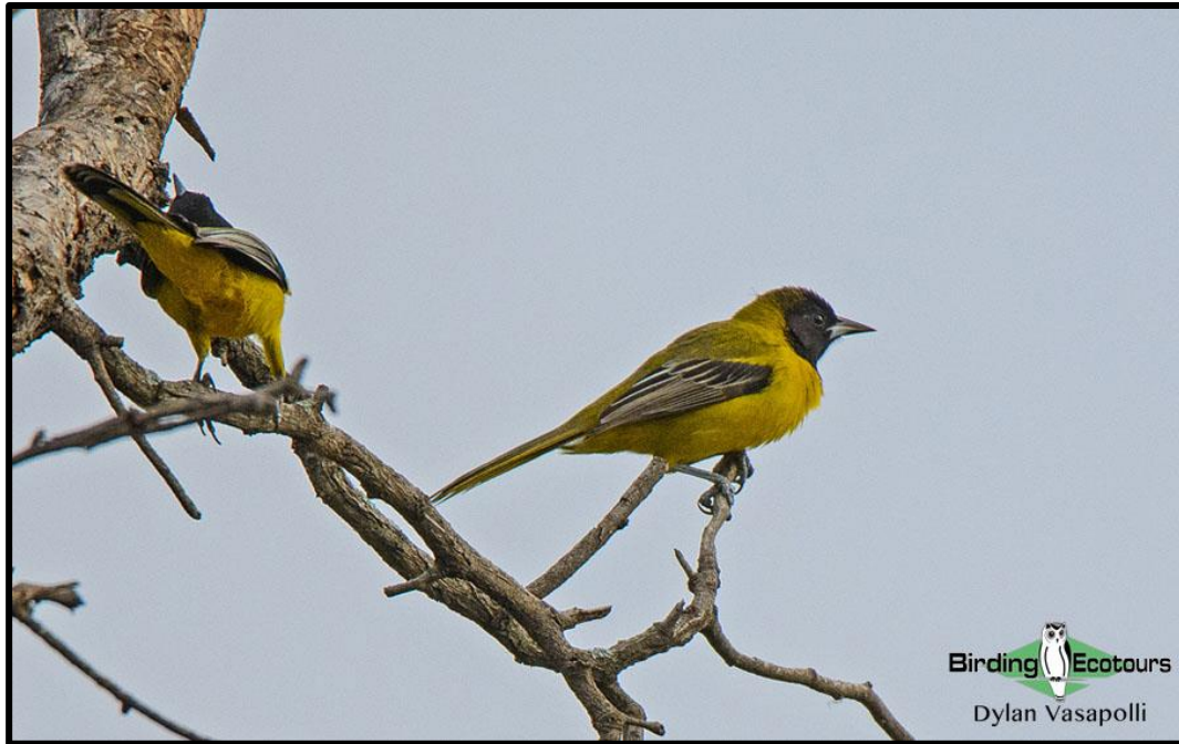
Audubon's Oriole are a regular feature at the Salineño Wildlife Preserve .