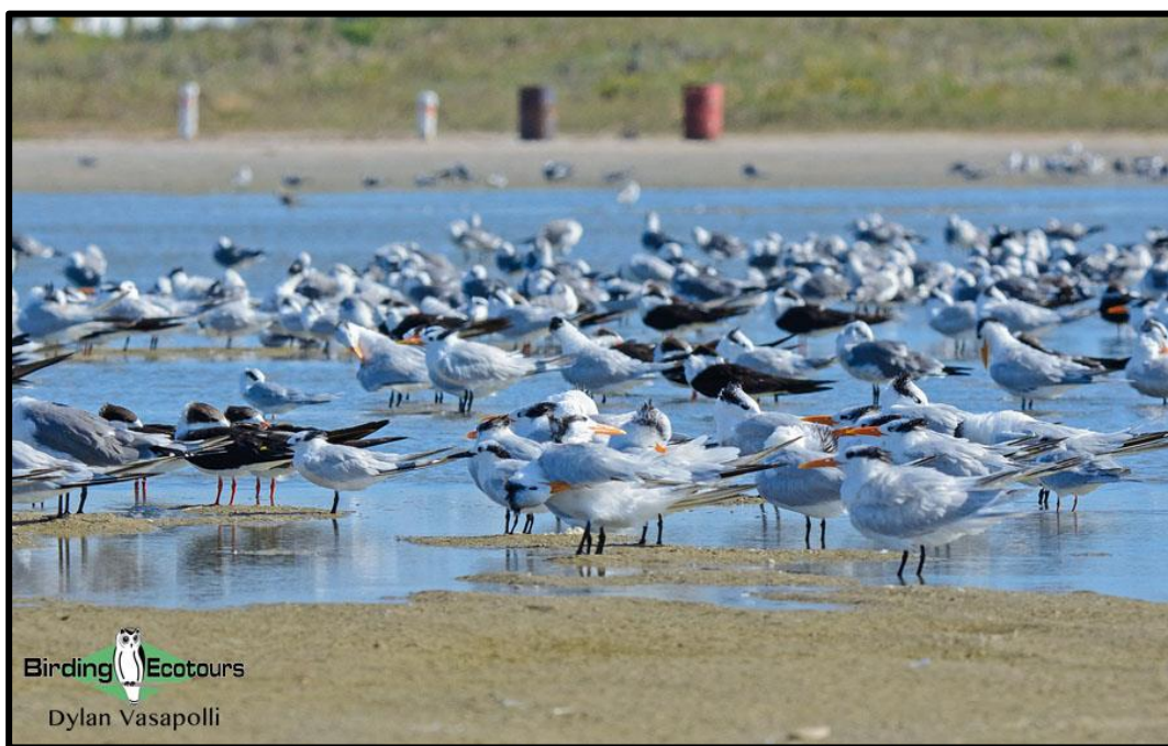
A selection of the skimmers, terns, gulls and other shorebirds that await us on South Padre Island.

Our afternoon will be spent focusing on the large waterbodies and coastal scrub thickets of the Laguna Atascosa National Wildlife Refuge , and the mudflats and shorelines of South Padre Island. A wide range of ducks and other waterfowl is usually present at Laguna Atascosa, and we'll be on the lookout for wintering Greater White-fronted Goose , American Wigeon , Redhead and Ruddy Duck , amongst others – and we even have the off-chance of rare species such as Eurasian Wigeon . However, perhaps more attractive to us are their hides/blinds, offering an excellent opportunity to see some of the skulking species of the valley, such as White-tipped Dove and Olive Sparrow . We should also get our first opportunity to see some of the many specials of the US, largely confined to the Lower Rio Grande Valley, such as Ladder-backed Woodpecker and Long-billed Thrasher . Additionally, this is a good site for the charismatic Greater Roadrunner , and other sought-after species such as Crested Caracara and Scissor-tailed Flycatcher .