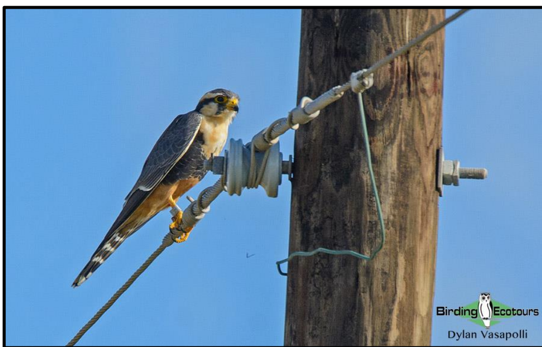
Aplomado Falcon is a localized and sought-after ABA bird.