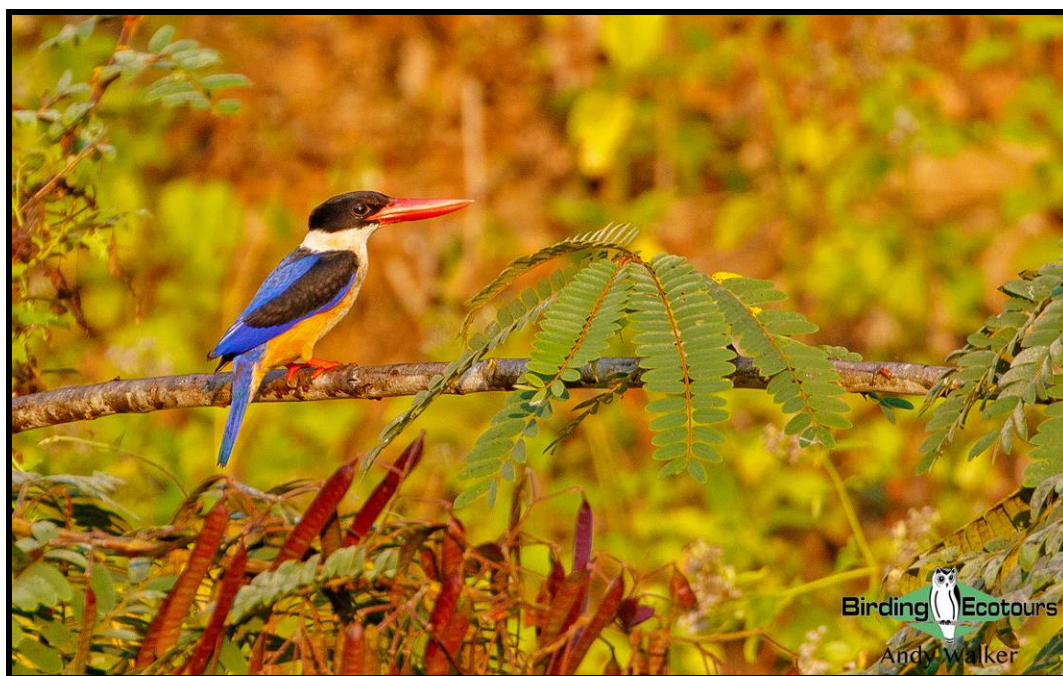
Black-capped Kingfisher is a striking bird.