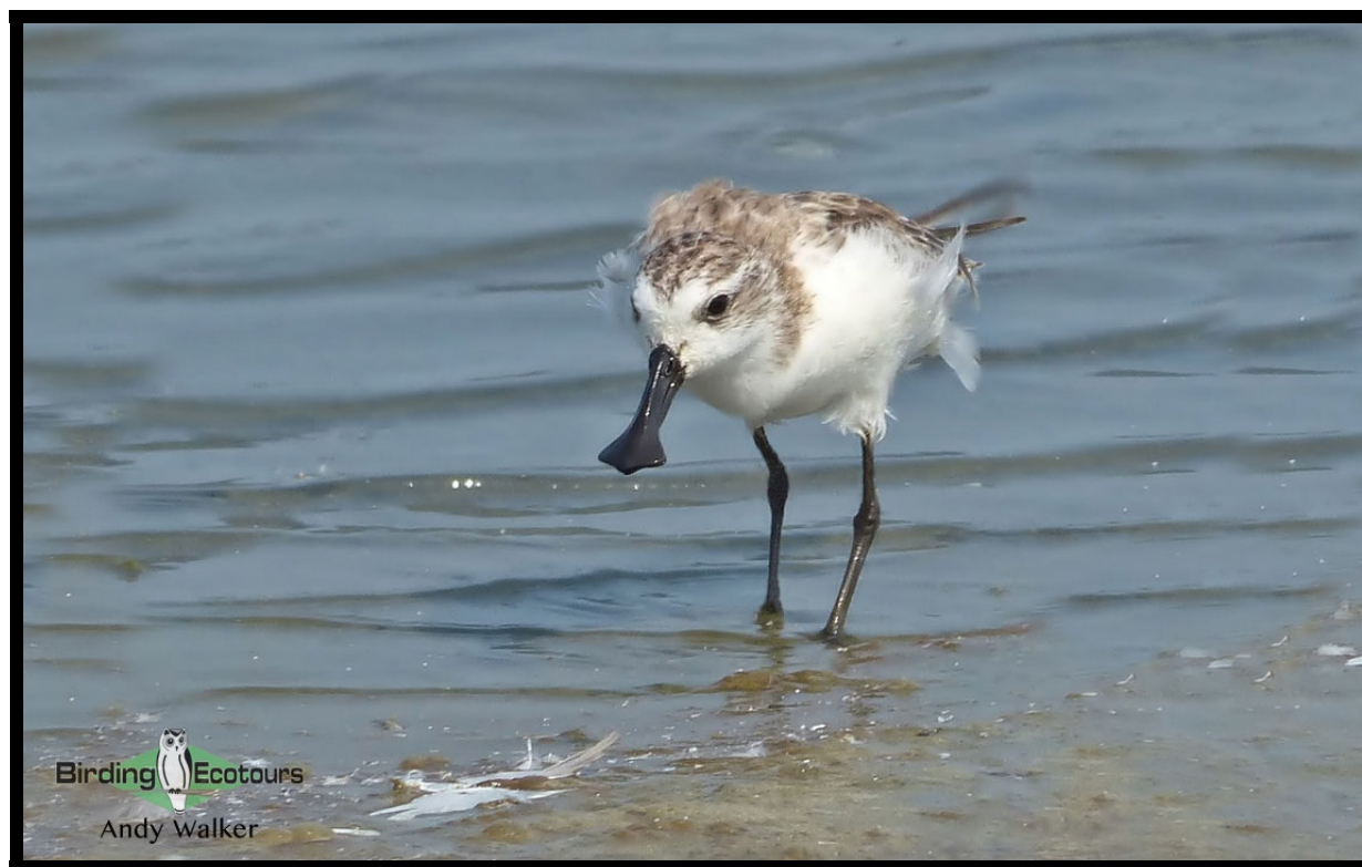
Spoon-billed Sandpiper, one of the most sought-after birds on earth.