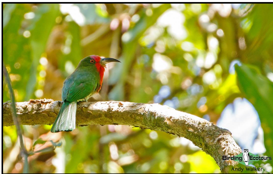
Red-bearded Bee-eater is another beautiful target while in Kaeng Krachan National Park.

We will spend two days birding within and around this exciting park. Our time will be spent at a range of elevations to connect with the associated species of these areas. At the higher elevations of the park we are restricted to birding along a few roads that cut through the park, but this still gives us some fantastic opportunities for some range-restricted species, such as Ratchet-tailed Treepie, Collared, Spot-necked, Grey-throated, Golden, and Rufous-fronted Babblers , and Black-throated Laughingthrush . Other species on offer here include Red-headed Trogon, Red-bearded Bee-eater, Ferruginous Partridge, Kalij Pheasant, Grey Peacock-Pheasant, Mountain Imperial Pigeon, Rufous-bellied Eagle, Mountain Hawk-Eagle, Silver-breasted and Long-tailed Broadbills, Great Hornbill, Banded Kingfisher, Great Barbet, and Bamboo Woodpecker , along with lots of bulbuls, babblers, and warblers.