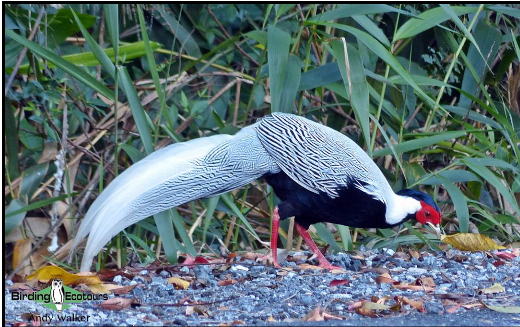
Silver Pheasant is a spectacular target bird during our time in Khao Yai National Park.

The forests along the way to the higher elevations can support some spectacular birds, and a few strategic stops may yield Long-tailed Broadbill , Banded Broadbill , Siamese Fireback , Coral-billed Ground Cuckoo , Blue Pitta , Eared Pitta , Blue-bearded Bee-eater , Orange-breasted Trogon , Common Hill Myna , and Sultan Tit .