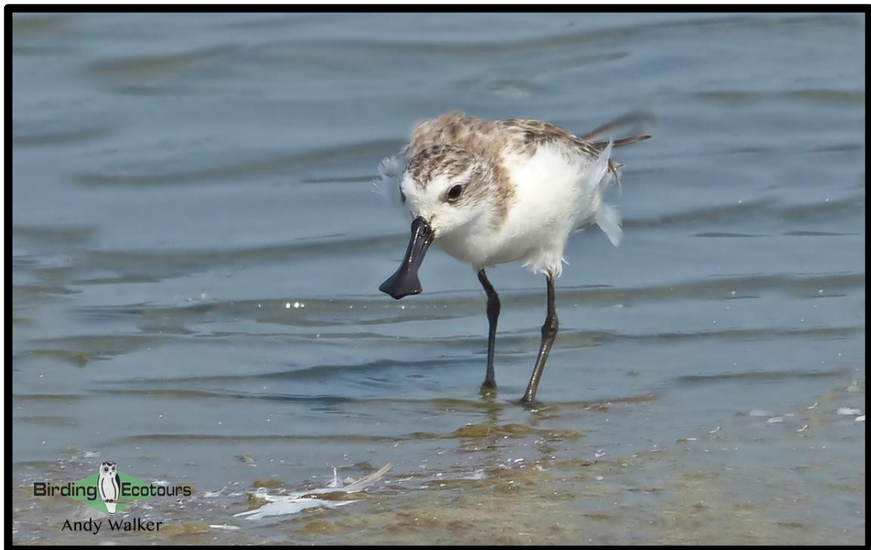
Spoon-billed Sandpiper, one of the most sought-after birds on earth.

03 – 12 JANUARY 2027 10 – 19 FEBRUARY 2028