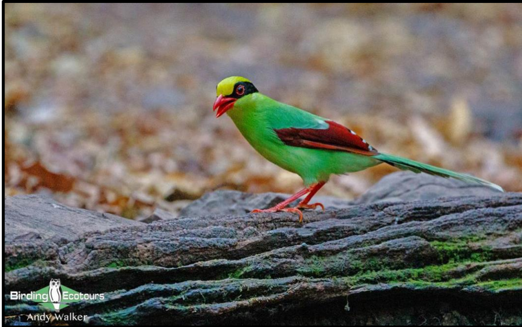
The colors on the gorgeous Common Green Magpie need to be seen to be believed.

In the late morning we will commence our journey from the Kaeng Krachan area back around Bangkok and to the northeast of the Thai capital city. We will stop for lunch along the way and will visit a small temple to look for Rufous Limestone Babbler along the way. We will check into our comfortable hotel late in the afternoon for the next three nights.