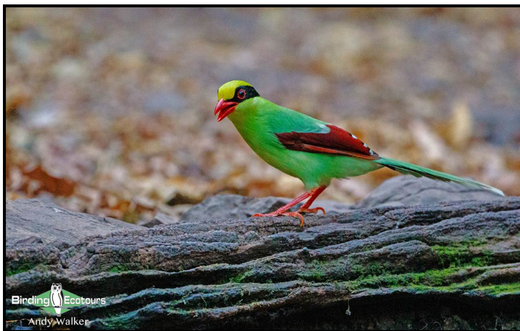
The colors on the gorgeous Common Green Magpie need to be seen to be believed.

Necklaced Laughingthrushes, White-rumped Shama, and an assorted range of other interesting passerines.