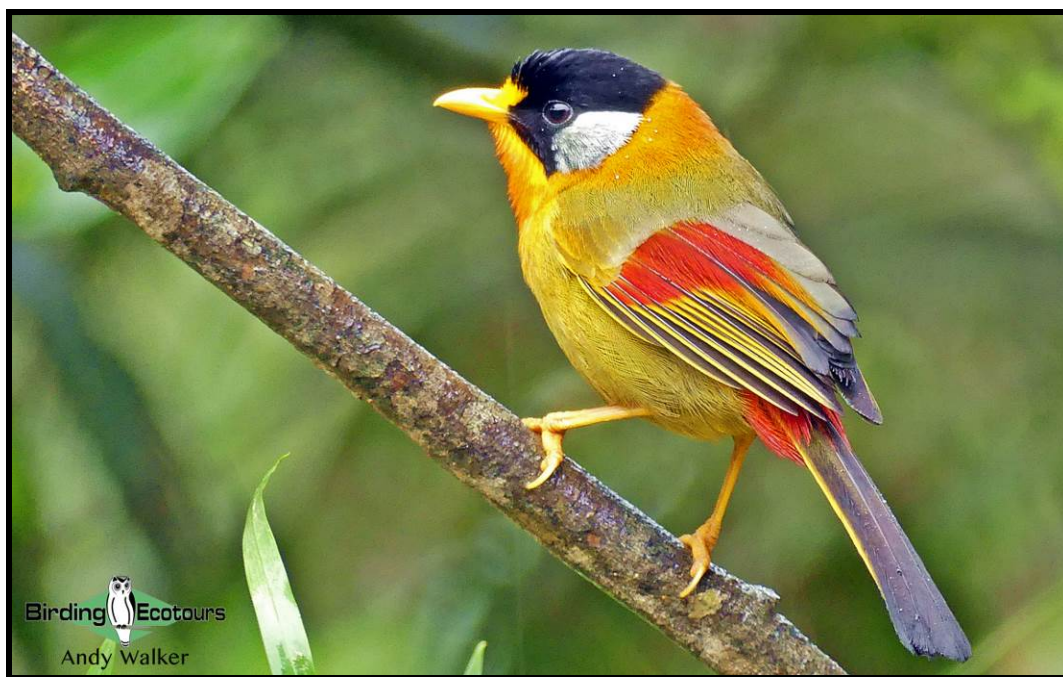
Silver-eared Mesia can be seen in the forests of Doi Ang Khang.