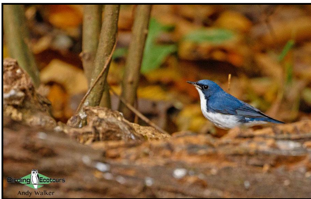
The pretty Siberian Blue Robin is a winter visitor to Thailand.

Forest birding high up and around the bog is likely to get us some great birds, and as time goes by (usually once the sun gets onto the trees and warms things up in the morning) things start to really happen here. We hope to find Rufous-throated Partridge, Mountain Bamboo Partridge, Ashy Wood Pigeon, Black-tailed Crake, Golden-throated Barbet, Yellow-bellied Fantail, Yellow-cheeked Tit, Silver-eared Laughingthrush, Spectacled Barwing, Dark-backed Sibia, Silver-eared Mesia, Blue-winged Minla, Himalayan Shortwing, Scaly and Dark-sided Thrushes, Buff-barred and Ashy-throated Warblers, Slaty-backed and Snowy-browed Flycatchers, Yellow-bellied Flowerpecker, Mrs. Gould's, Black-throated, and Green-tailed Sunbirds, and Common Rosefinch.