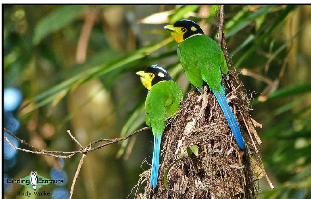
Long-tailed Broadbill — one of two broadbill species we hope to encounter on this tour.

This short tour forms a circuit around northern Thailand, starting and ending in the northern capital city of Chiang Mai. We will commence our experience of northern Thailand birding with a visit to Doi Inthanon, the country's highest mountain. The unique set of habitats here offers us some excellent birds as well as letting us come to grips with some of the more common northern species. Special birds here may include Rufous-throated Partridge , Mountain Bamboo Partridge , Black-tailed Crake , Spectacled Barwing , Himalayan Bluetail , Himalayan Shortwing , Dark-sided Thrush , White-crowned , Slaty-backed , and Black-backed Forktails , Long-tailed Broadbill , and Red-headed Trogon . The dry, lowland forest at the foot of the mountain can be full of woodpeckers, and the stunning Black-headed Woodpecker is one of the best-looking. Other targets here will include White-rumped Falcon , Red-billed Blue Magpie , and Blossom-headed Parakeet .