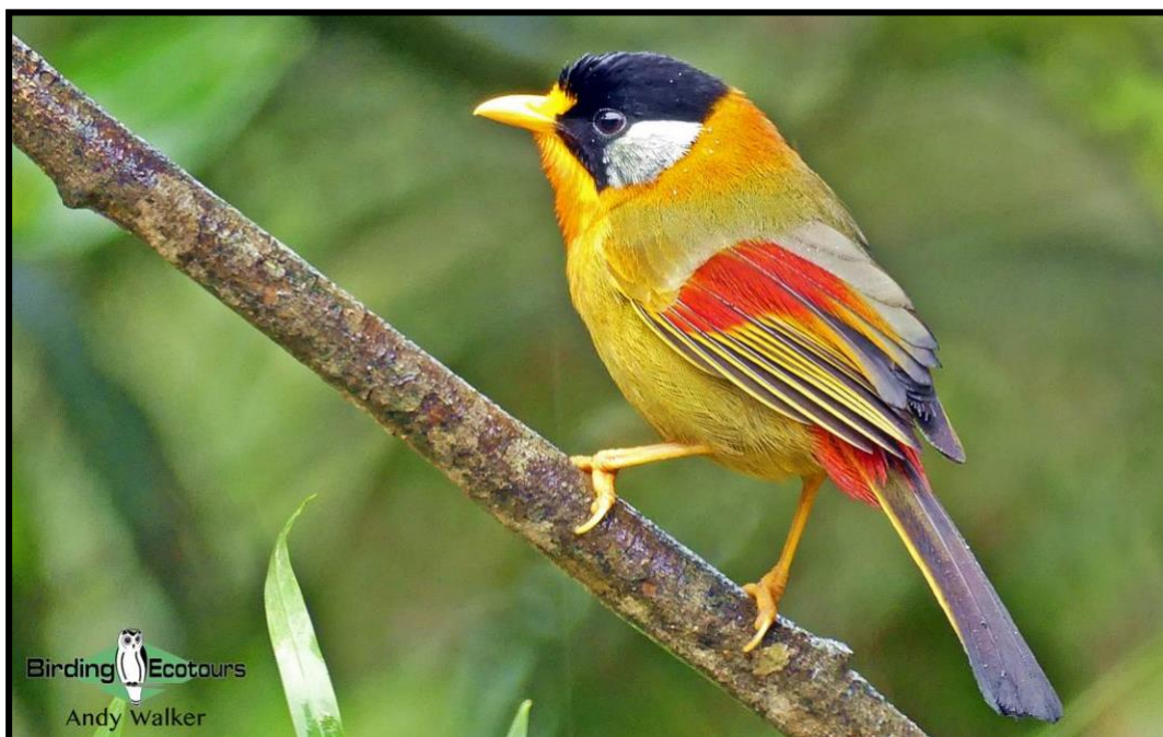
Silver-eared Mesia can be seen in the forests of Doi Ang Khang.