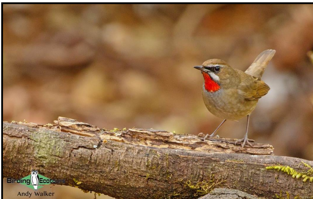
Siberian Rubythroat is one of the many migrants we hope to encounter.