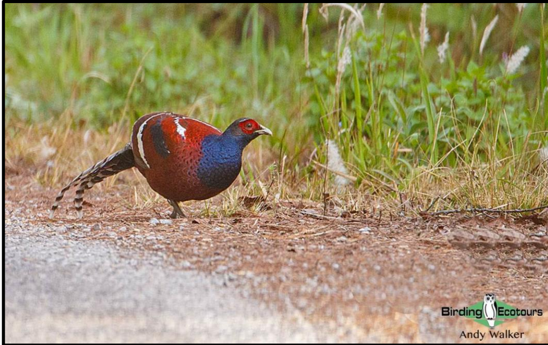
Mrs. Hume's Pheasant requires patience and luck in the mountains, but it is worth it!