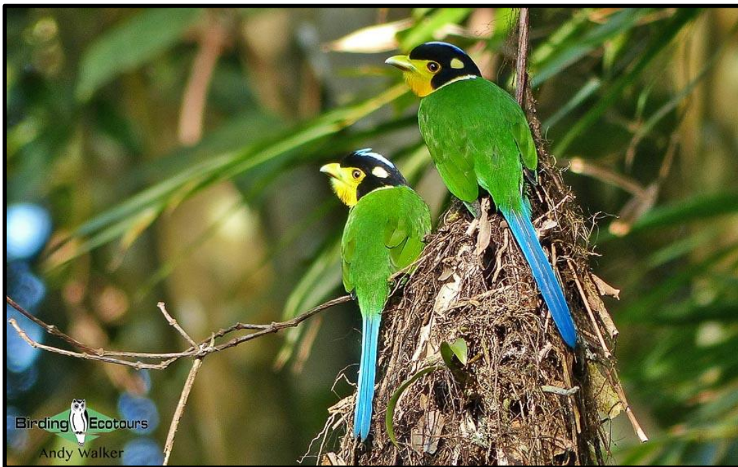
Long-tailed Broadbill — one of two broadbill species we hope to encounter on this tour.

This short tour forms a circuit around northern Thailand, starting and ending in the northern capital city of Chiang Mai. We will commence our experience of northern Thailand birding with a visit to Doi Inthanon, the country's highest mountain. The unique set of habitats here offers us some excellent birds as well as letting us come to grips with some of the more common northern species. Special birds here may include Rufous-throated Partridge, Mountain Bamboo Partridge, Black-tailed Crake, Spectacled Barwing, Himalayan Bluetail, Himalayan Shortwing, Dark-sided Thrush, White-crowned, Slaty-backed, and Black-backed Forktails, Long-tailed Broadbill, and Red-headed Trogon . The dry, lowland forest at the foot of the mountain can be full of woodpeckers, and the stunning Black-headed Woodpecker is one of the best-looking. Other targets here will include White-rumped Falcon, Red-billed Blue Magpie, and Blossom-headed Parakeet .