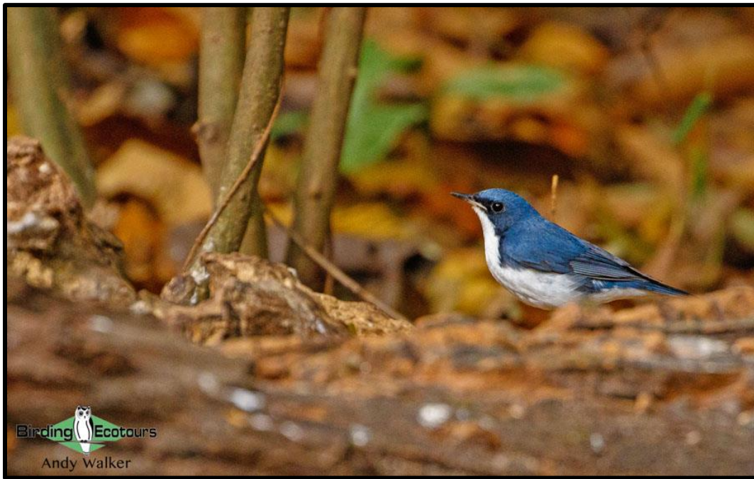
The pretty Siberian Blue Robin is a winter visitor to Thailand.

Forest birding high up and around the bog is likely to get us some great birds, and as time goes by (usually once the sun gets onto the trees and warms things up in the morning) things start to really happen here. We hope to find Rufous-throated Partridge, Mountain Bamboo Partridge, Ashy Wood Pigeon, Black-tailed Crake, Golden-throated Barbet, Yellow-bellied Fantail, Yellow-cheeked Tit, Silver-eared Laughingthrush, Spectacled Barwing, Dark-backed Sibia, Silver-eared Mesia, Blue-winged Minla, Himalayan Shortwing, Scaly and Dark-sided Thrushes, Buff-barred and Ashy-throated Warblers, Slaty-backed and Snowy-browed Flycatchers, Yellow-bellied Flowerpecker, Mrs. Gould's, Black-throated, and Green-tailed Sunbirds, and Common Rosefinch.