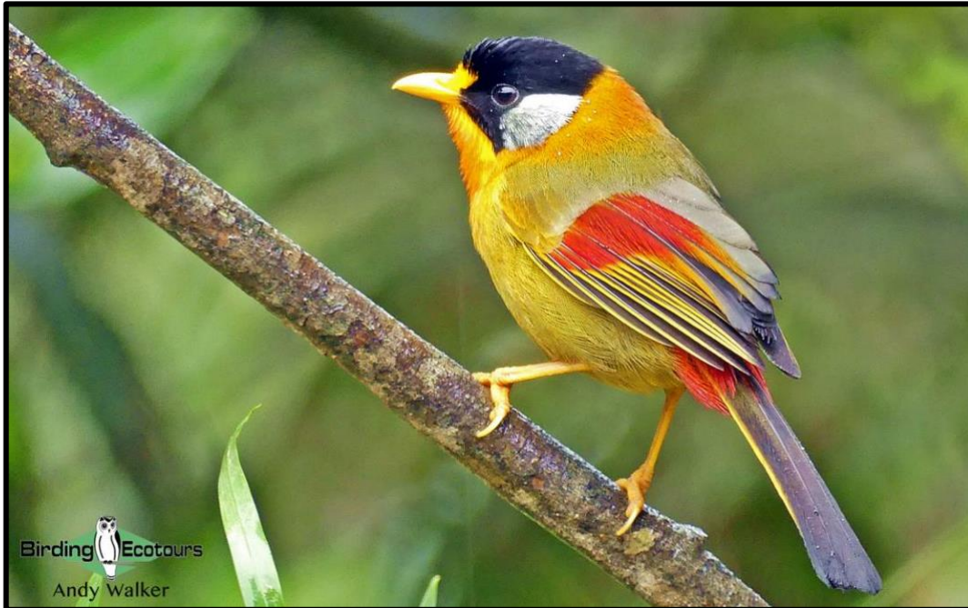
Silver-eared Mesia can be seen in the forests of Doi Ang Khang.