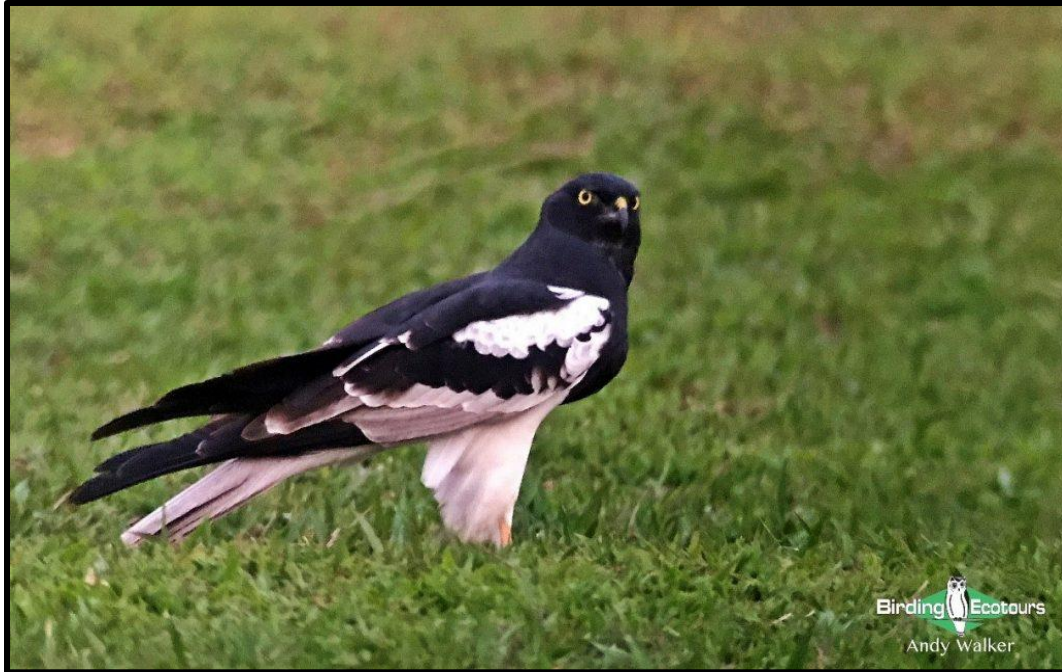
Pied Harrier — one of the most attractive raptors in the world.