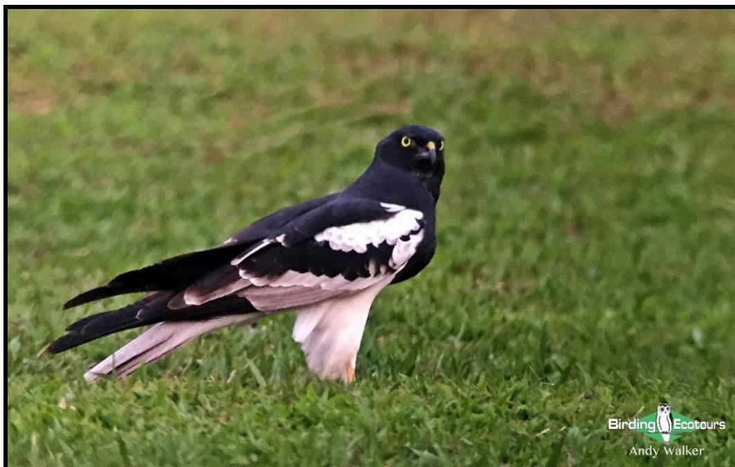
Pied Harrier — one of the most attractive raptors in the world.