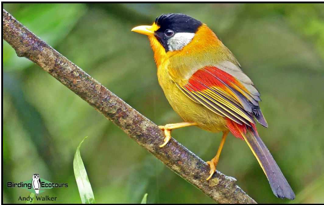
Silver-eared Mesia can be seen in the forests of Doi Ang Khang.