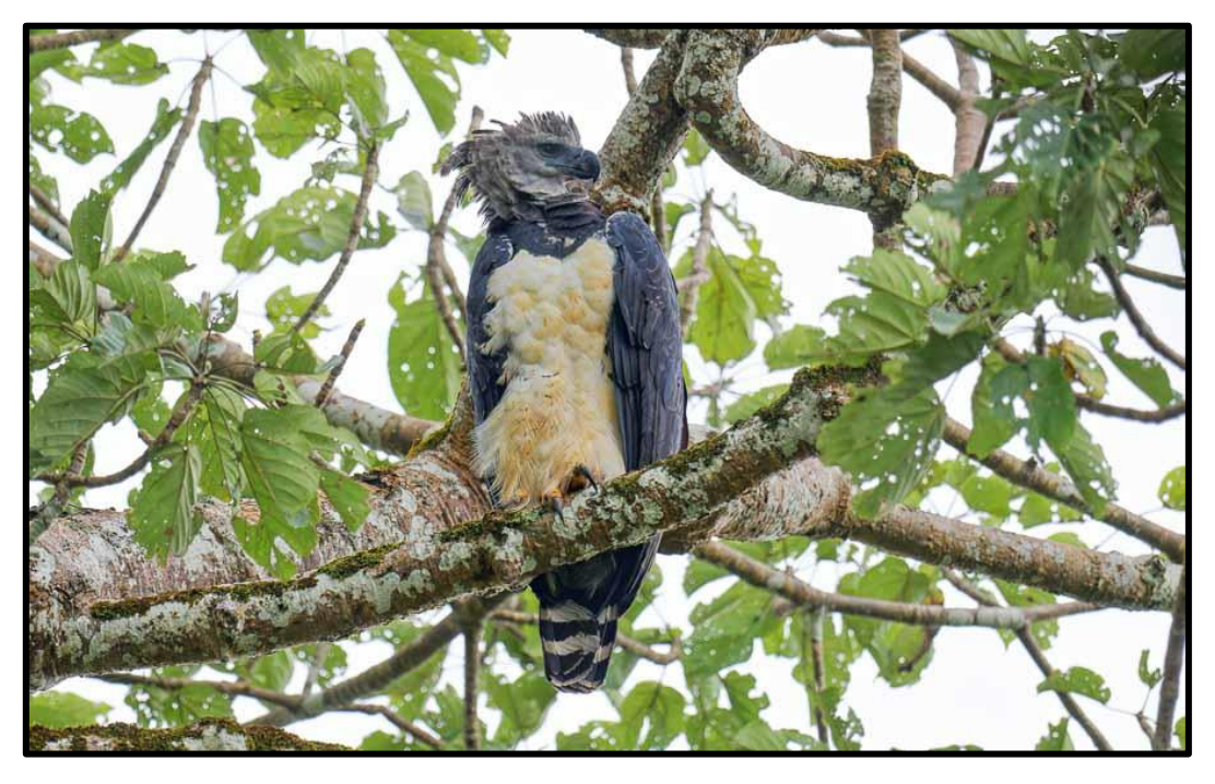
We hope to encounter the mighty Harpy Eagle in the Darién.

During this 12-day birding tour you will start the adventure visiting Canopy Camp in the Darién Province, a beautiful and safe area to visit, far from the Colombian border. During the next four days we will look for a whole set of range-restricted species shared only with Colombia, some of them quite tough to find in other neotropical countries. The amenities at Canopy Camp are very comfortable; each camping unit provides a safari-style tent with wooden floors, beds, electricity, fans (however, no air-conditioners), a second room for luggage, and a private bathroom outside the tent. Some of the birds that we'll be on the lookout for in the Darién include White-eared Conebill, Double-banded Greytail, Dusky-backed Jacamar, Black Oropendola, Spectacled Parrotlet, Black-crowned Antpitta, Bare-crowned Antbird, Black Antshrike, Grey-cheeked Nunlet, Spot-crowned Barbet, and Orange-crowned Oriole. We will also try for Blue Cotinga, Green Shrike-Vireo, Stripe-cheeked Woodpecker and perhaps even the rare Harpy Eagle.