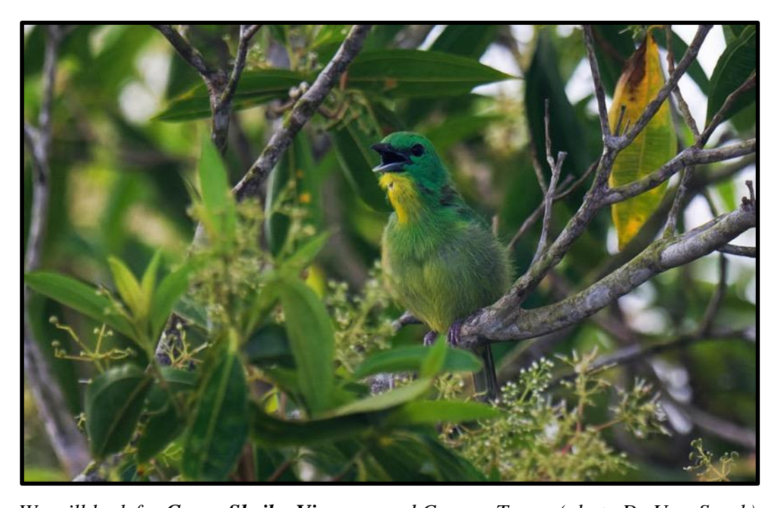
We will look for Green Shrike-Vireo around Canopy Tower.

We will meet at the observation deck before dawn to enjoy the forest's chorus from the canopy with the early calls of Barred and Slaty-backed Forest Falcons . While enjoying some coffee we will try to detect the secretive Green Shrike-Vireo and the beautiful Blue Cotinga . Other birds likely here include Northern Mealy and Red-lored Amazons , Brown-capped Tyrannulet , Collared Aracari , and the striking Keel-billed Toucan .