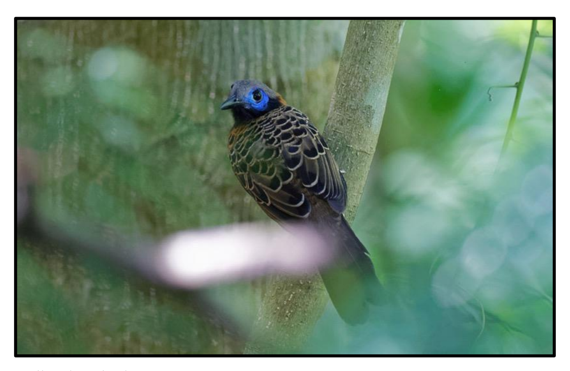
Ocellated Antbird will be searched for near army ant swarms (photo Dr Uwe Speck).