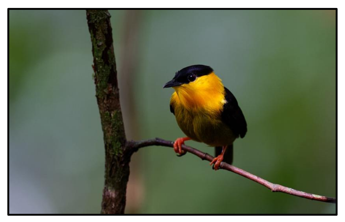
We will search for the striking Golden-collared Manakin near Canopy Tower.