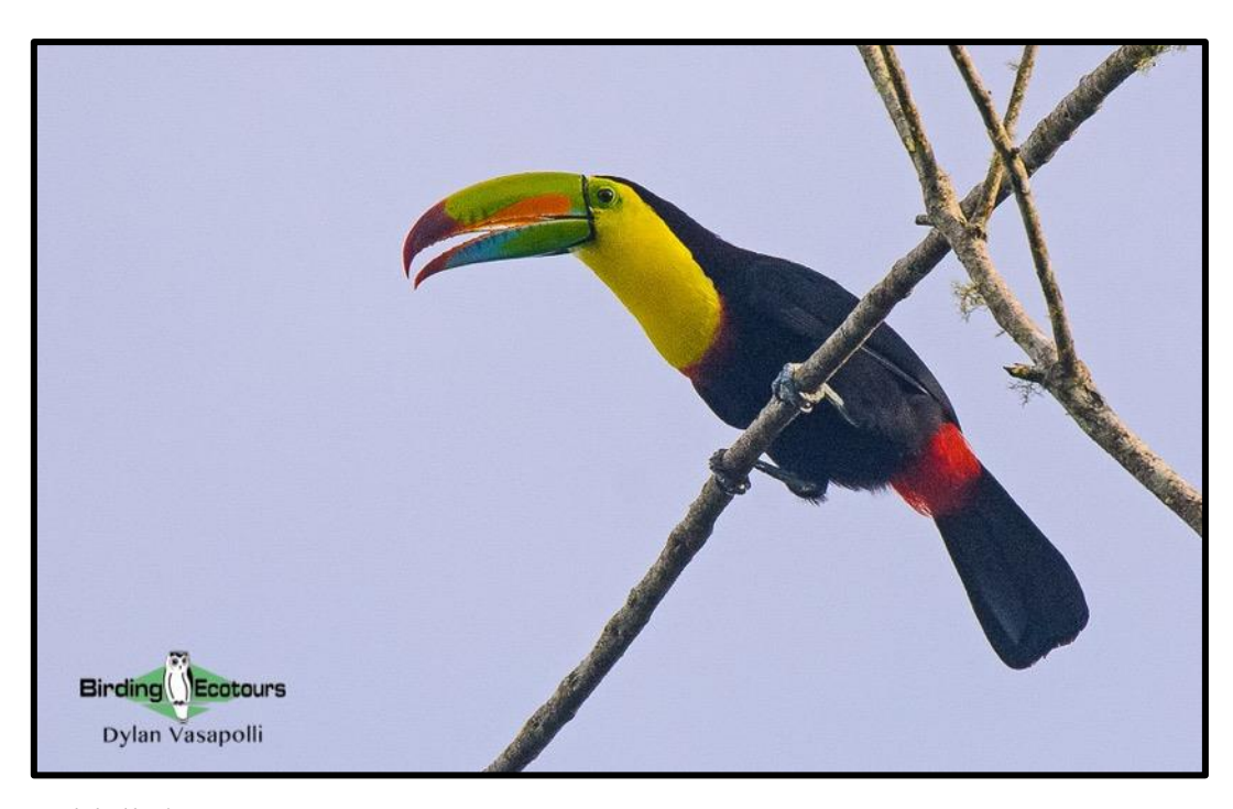
Keel-billed Toucan is one of several toucan species we hope to encounter in Panama.

We will transfer to Canopy Camp in the Darién Province in Panama where we will spend the next three days exploring different locations looking for some Darién and regional endemics such as Dusky-backed Jacamar, Black Antshrike, Grey-cheeked Nunlet, Black Oropendola, Double-banded Greytail, White-eared Conebill, Spot-crowned Barbet, Choco Sirystes and Speckled Mourner. Other species which we will be on the lookout for include Great Green Macaw, Rufous Piha, Rufous-winged Tyrannulet, Sooty-headed Tyrannulet, Bare-crowned Antbird, Black-crowned Antpitta, Northern Barred Woodcreeper, Yellow-throated Toucan, Pied Puffbird, White Hawk, Cinnamon Woodpecker, Gartered Trogon, Cocoa Woodcreeper, Golden-headed Manakin, Black-headed Tody-Flycatcher, Collared Aracari, Keel-billed Toucan, Chestnut-headed Oropendola, Golden-hooded Tanager, Mottled Owl, Ochre-lored Flatbill, Barred Puffbird, and Tropical Royal Flycatcher.