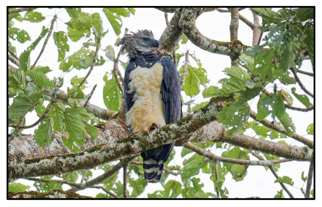
We hope to encounter the mighty Harpy Eagle in the Darién.

During this 12-day birding tour you will start the adventure visiting Canopy Camp in the Darién Province, a beautiful and safe area to visit, far from the Colombian border. During the next four days we will look for a whole set of range-restricted species shared only with Colombia, some of them quite tough to find in other neotropical countries. The amenities at Canopy Camp are very comfortable; each camping unit provides a safari-style tent with wooden floors, beds, electricity, fans (however, no air-conditioners), a second room for luggage, and a private bathroom outside the tent. Some of the birds that we'll be on the lookout for in the Darién include White-eared Conebill, Double-banded Greytail, Dusky-backed Jacamar, Black Oropendola, Spectacled Parrotlet, Black-crowned Antpitta, Bare-crowned Antbird, Black Antshrike, Grey-cheeked Nunlet, Spot-crowned Barbet, and Orange-crowned Oriole. We will also try for Blue Cotinga, Green Shrike-Vireo, Stripe-cheeked Woodpecker and perhaps even the rare Harpy Eagle.