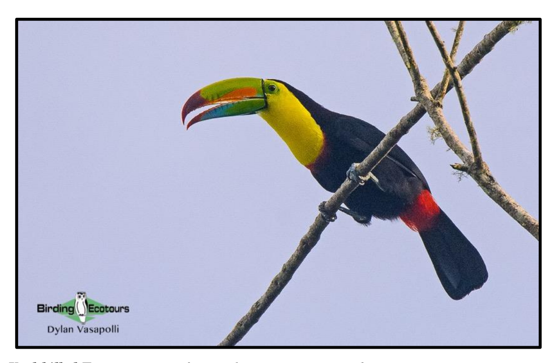
Keel-billed Toucan is one of several toucan species we hope to encounter in Panama.

We will transfer to Canopy Camp in the Darién Province in Panama where we will spend the next three days exploring different locations looking for some Darién and regional endemics such as Dusky-backed Jacamar, Black Antshrike, Grey-cheeked Nunlet, Black Oropendola, Double-banded Greytail, White-eared Conebill, Spot-crowned Barbet, Choco Sirystes and Speckled Mourner. Other species which we will be on the lookout for include Great Green Macaw, Rufous Piha, Rufous-winged Tyrannulet, Sooty-headed Tyrannulet, Bare-crowned Antbird, Black-crowned Antpitta, Northern Barred Woodcreeper, Yellow-throated Toucan, Pied Puffbird, White Hawk, Cinnamon Woodpecker, Gartered Trogon, Cocoa Woodcreeper, Golden-headed Manakin, Black-headed Tody-Flycatcher, Collared Aracari, Keel-billed Toucan, Chestnut-headed Oropendola, Golden-hooded Tanager, Mottled Owl, Ochre-lored Flatbill, Barred Puffbird, and Tropical Royal Flycatcher.