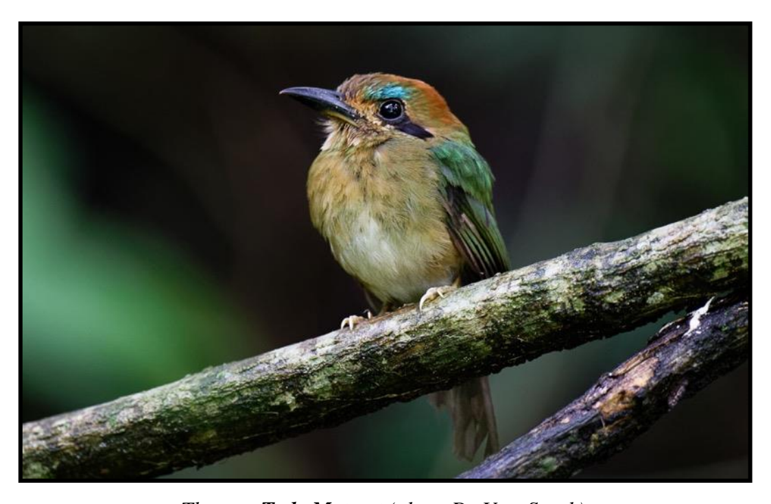
The cute Tody Motmot.