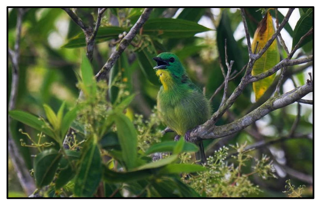
We will look for Green Shrike-Vireo around Canopy Tower.

We will meet at the observation deck before dawn to enjoy the forest's chorus from the canopy with the early calls of Barred and Slaty-backed Forest Falcons . While enjoying some coffee we will try to detect the secretive Green Shrike-Vireo and the beautiful Blue Cotinga . Other birds likely here include Northern Mealy and Red-lored Amazons , Brown-capped Tyrannulet , Collared Aracari , and the striking Keel-billed Toucan .