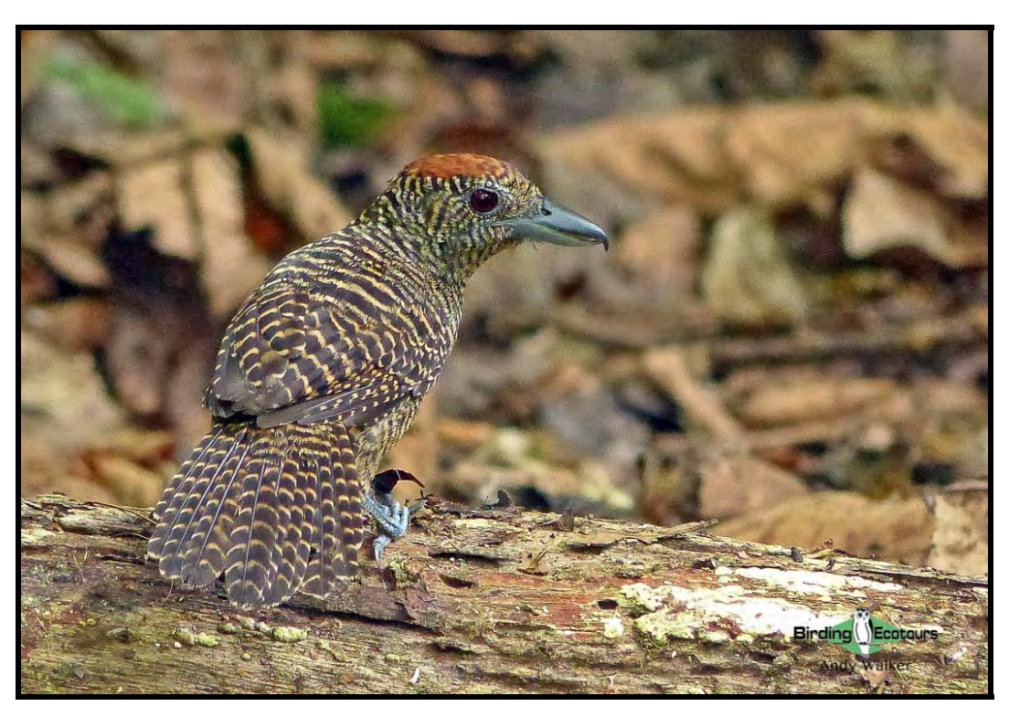
The impressive Fasciated Antshrike is possible along the Pipeline Road.