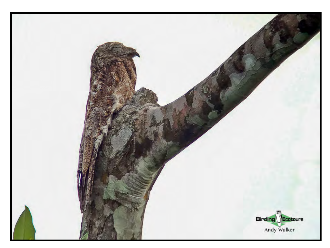
Great Potoo is often seen at its cryptic day roosts.