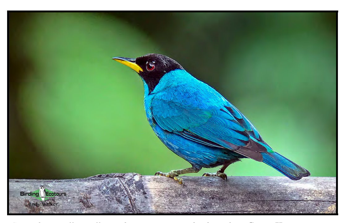
Semaphore Hill usually produces some great birds such as Green Honeycreeper.

After breakfast we will bird the famous Semaphore Hill, looking for Rufous and Broad-billed Motmots , Slaty-tailed Trogon , Semiplumbeous Hawk , Plain-colored and White-shouldered Tanagers , Fulvous-vented Euphonia , and Green Honeycreeper . Before lunch we will check the hummingbird feeders around the lodge entrance, enjoying views of Blue-chested Hummingbird , Violet-bellied Hummingbird , White-necked Jacobin , and Snowy-bellied Hummingbird .