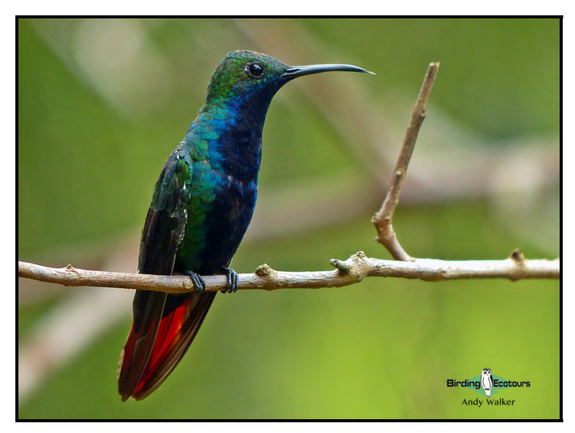
Black-throated Mango is one of the many hummingbird species we should see visiting feeders.

We will have lunch in the village of Torti, enjoying some nice hummingbird feeders with species such as Scaly-breasted and Snowy-bellied Hummingbirds , Rufous-breasted Hermit , Black-throated Mango , and Long-billed Starthroat . We will continue to the Canopy Camp in the Darién Province, where we will spend the afternoon birding around the camp grounds, looking for Olivaceous Piculet and Spot-crowned Barbet .