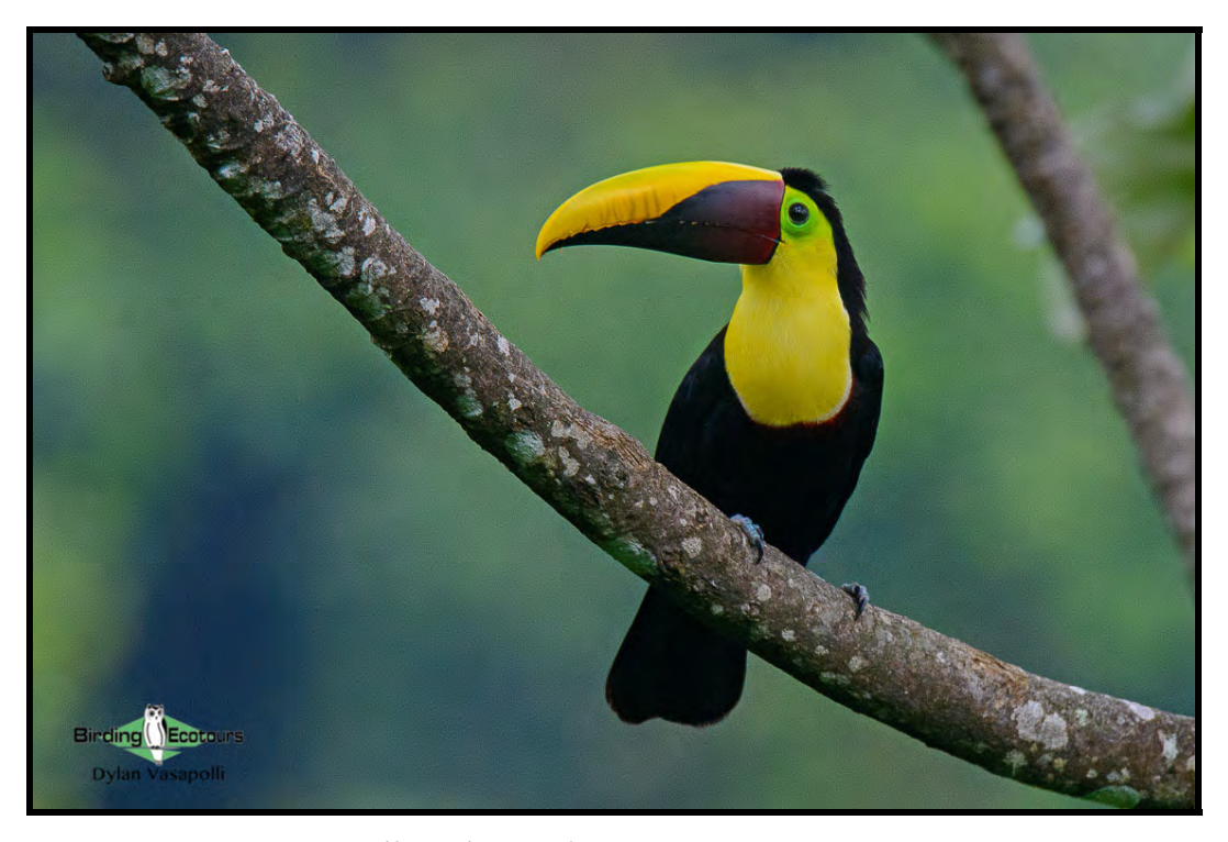
The brightly colored Yellow-throated Toucan will hopefully be seen on this tour.

During this 12-day tour you will have the chance to visit the Gamboa area near the Panama Canal, where we will be based at the world-famous Canopy Tower Lodge. This tower, a former US military center that was built to house powerful radar used in the defense of the canal, today is one of the most magnificent birding lodges in Latin America, allowing the guest a magnificent 360° view of the forest of the Soberanía National Park. We will stay a total of four nights, exploring the great surroundings, including places like the Pipeline Road, Summits Ponds, Semaphore Hill Road, and the Gamboa Marina Resort while looking for species such as Brownhooded Parrot, Northern Mealy and Red-lored Amazons, Keel-billed and Yellow-throated Toucan, Rufous and Broad-billed Motmots, American Pygmy Kingfisher, Boat-billed Heron, Crimson-backed and Golden-hooded Tanagers, Purple-throated Fruitcrow, Spotted Antbird, Dot-winged Antwren, Long-billed Gnatwren, Song Wren, Slaty-tailed, Gartered, and White-tailed Trogons, and if we are lucky Rufous-vented Ground Cuckoo and Ocellated Antbird. The lodge's surroundings are also good for wildlife, including Brown-throated Sloth, Nine-banded Armadillo, Central American Agouti, and Lesser Capybara.