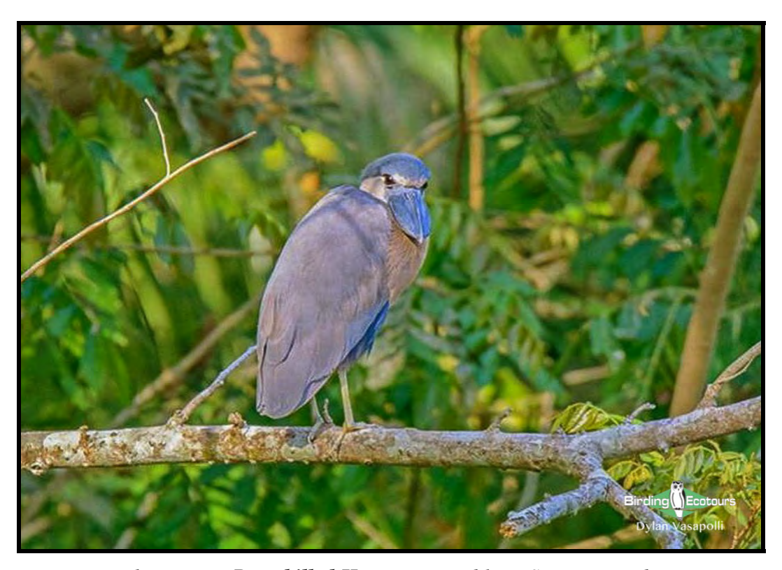
The strange Boat-billed Heron is possible at Summit Ponds.

Then we will visit the Canopy Lodge in the Valle del Antón (Anton Valley), surrounded by lush forested hills and ridges and home to several special species, such as Yellow-eared Toucanet, Snowcap, Ochraceous Wren, White-tipped Sicklebill, Black-and-yellow Tanager, Tiny Hawk, Tody Motmot, Rosy Thrush-Tanager, Grey-headed Chachalaca, and Collared Trogon, and we'll have another chance for Rufous-vented Ground Cuckoo. The Canopy Lodge is a very comfortable, beautiful lodge, situated in a peaceful location and surrounded by gardens, where we will try for Tropical Screech Owl and, with luck, Uniform Crake as well as for several tanagers like Bay-headed and Dusky-faced Tanagers.